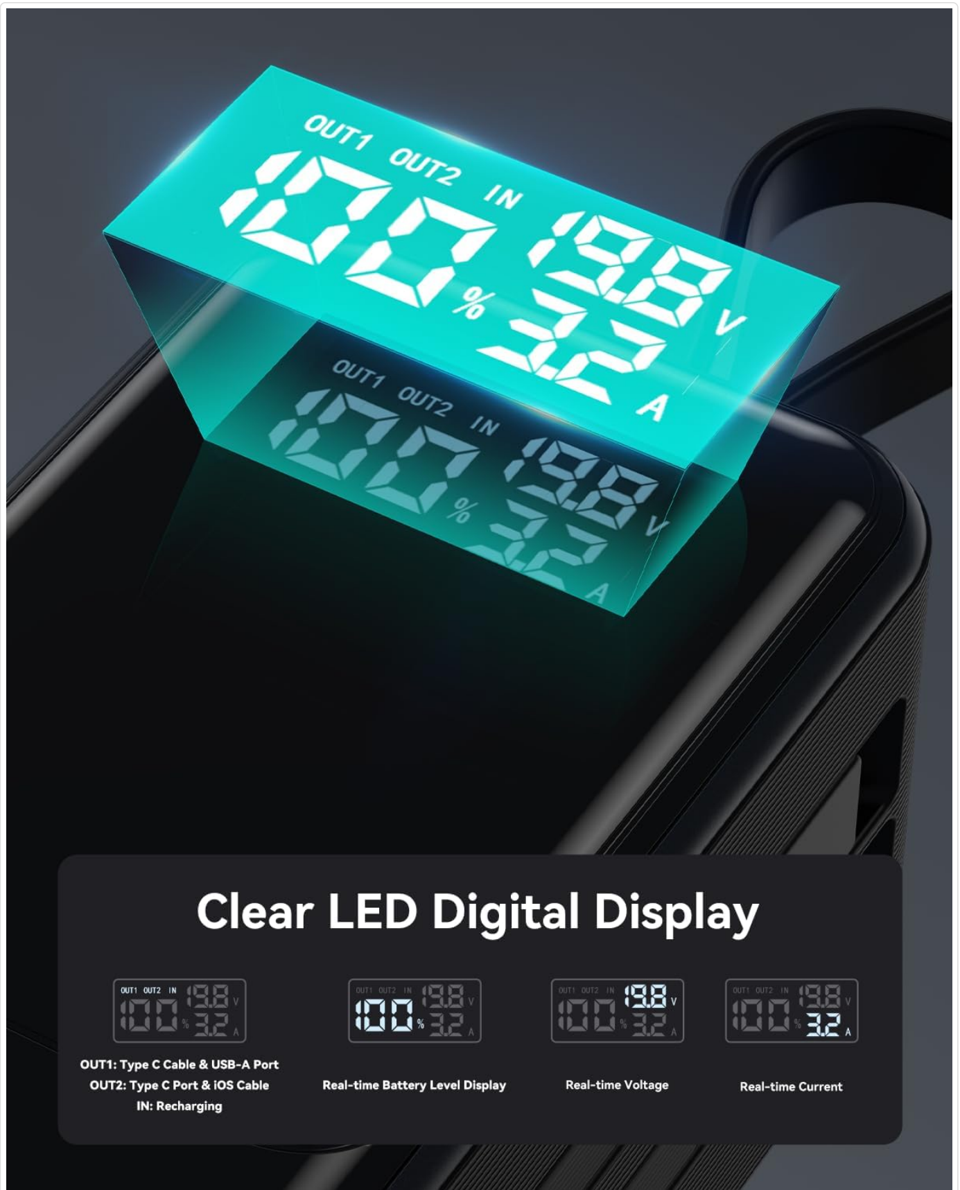
Image: A close-up of the MOKiN Power Bank's clear LED digital display, showing real-time battery level, voltage, and current.