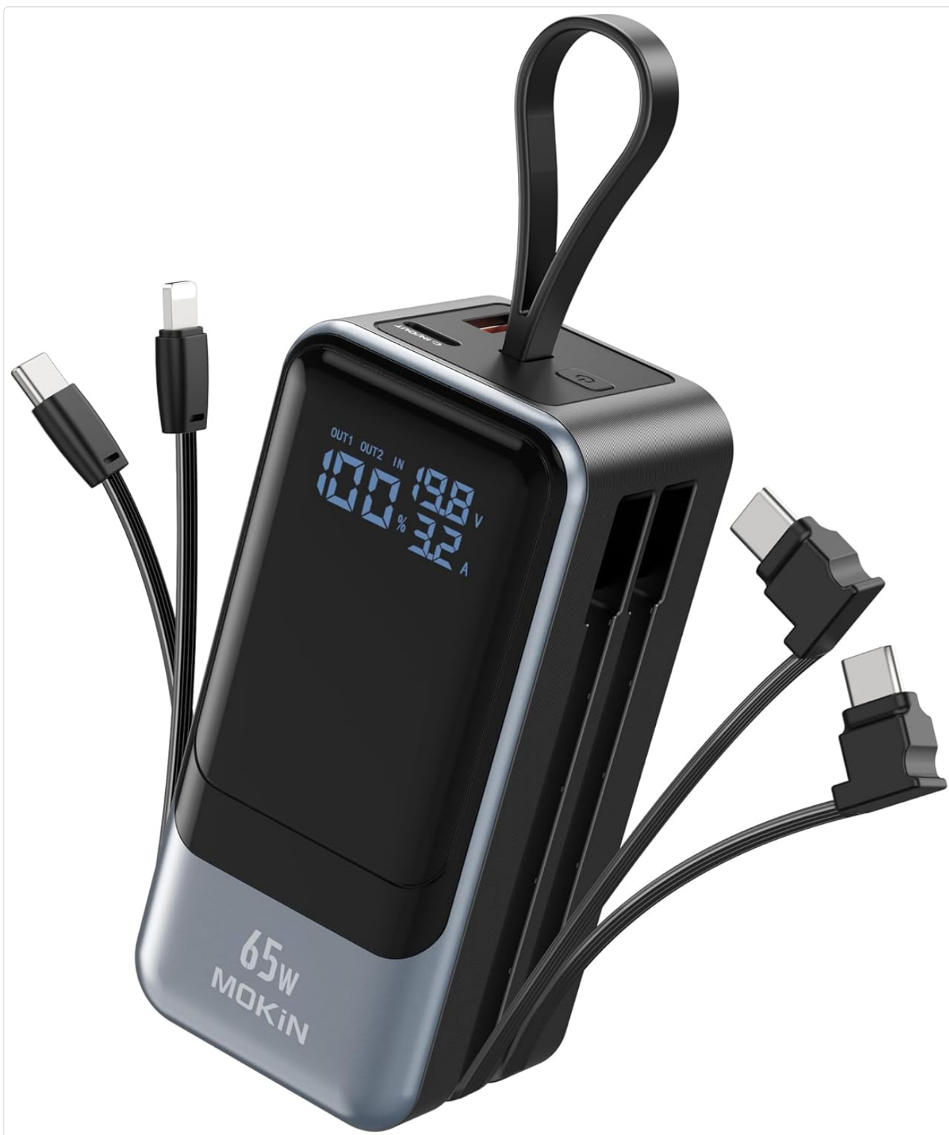
Image: MOKiN 65W Power Bank with built-in USB-C and iOS cables, showcasing its digital display and compact design.