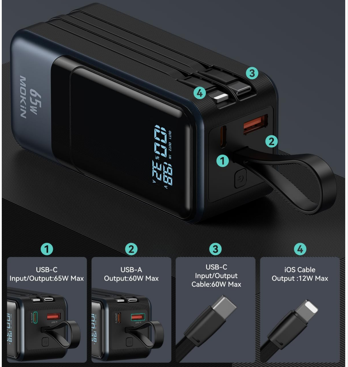
Image: Diagram illustrating the two input and four output options of the MOKiN Power Bank, including USB-C, USB-A, and built-in cables.