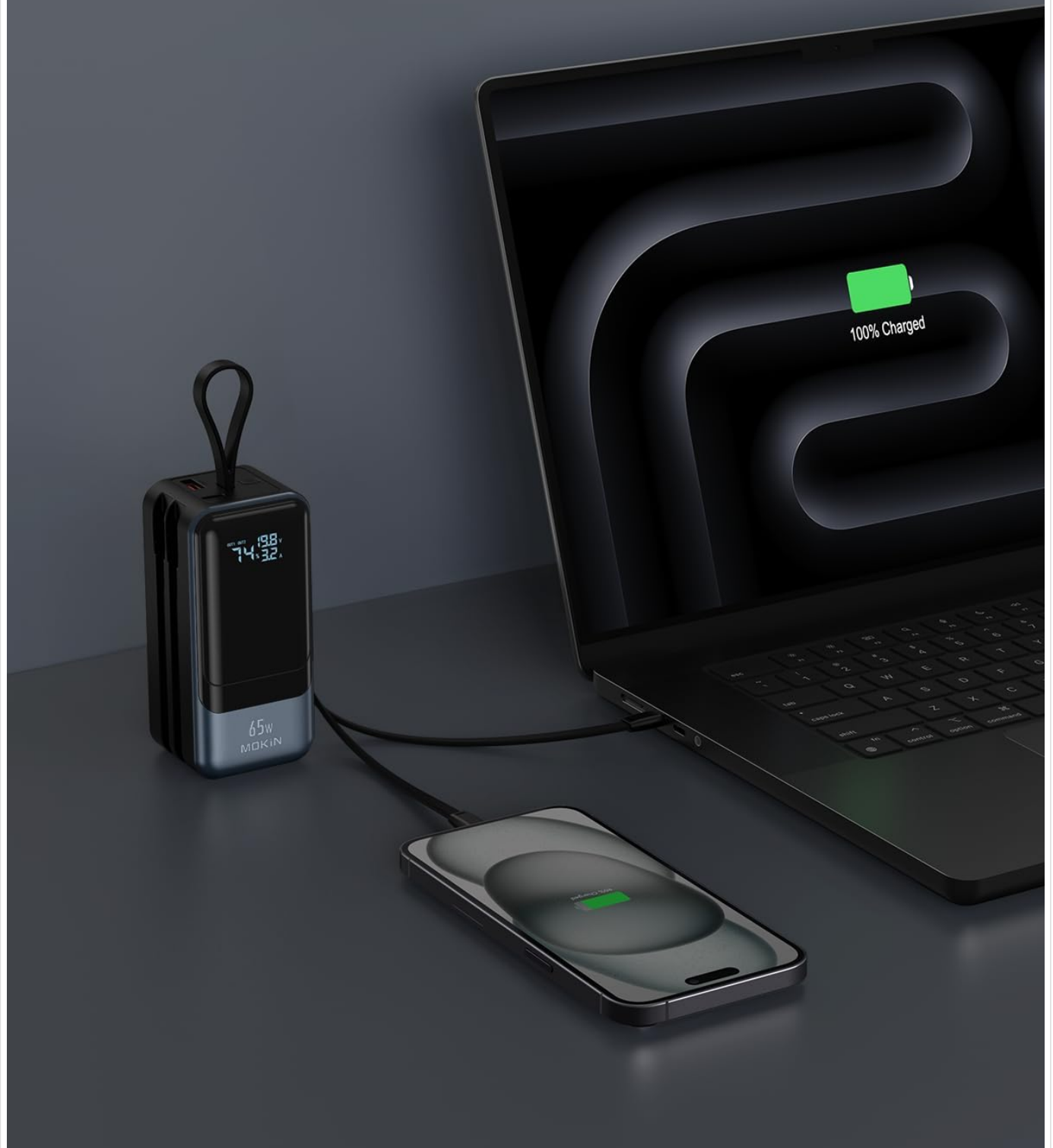
Image: The MOKiN Power Bank charging a laptop and a smartphone concurrently, showcasing its efficient power delivery.

Your browser does not support the video tag.