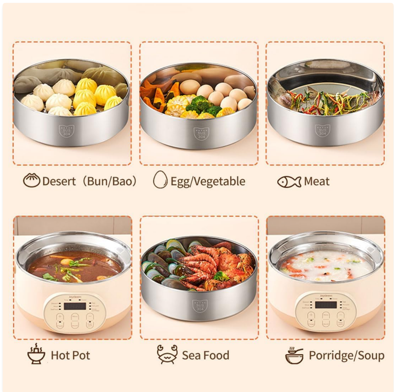
Figure 6: Variety of dishes prepared with the steamer