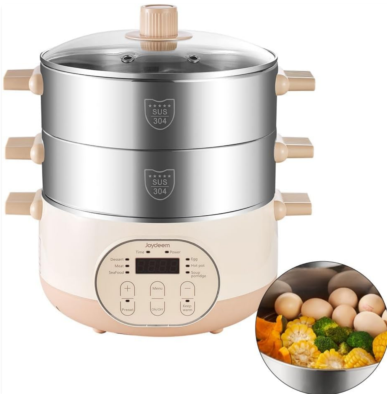
Figure 1: Joydeem Electric Food Steamer (Model JD-DZG15B)