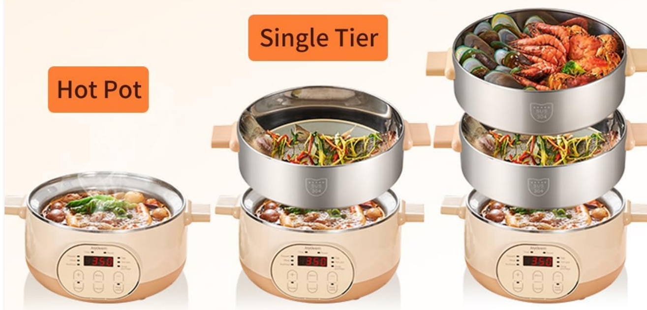
Figure 4: Steaming and Hot Pot configurations