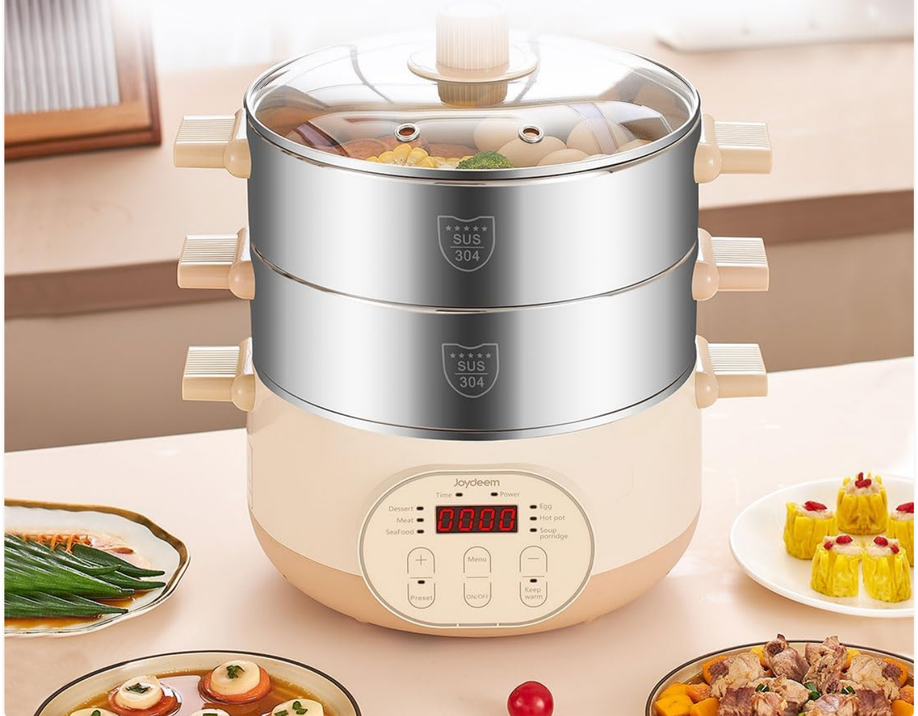
Figure 5: Large capacity and high power for efficient cooking