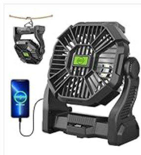
Image: The fan's USB output port, illustrating its capability to charge external devices.