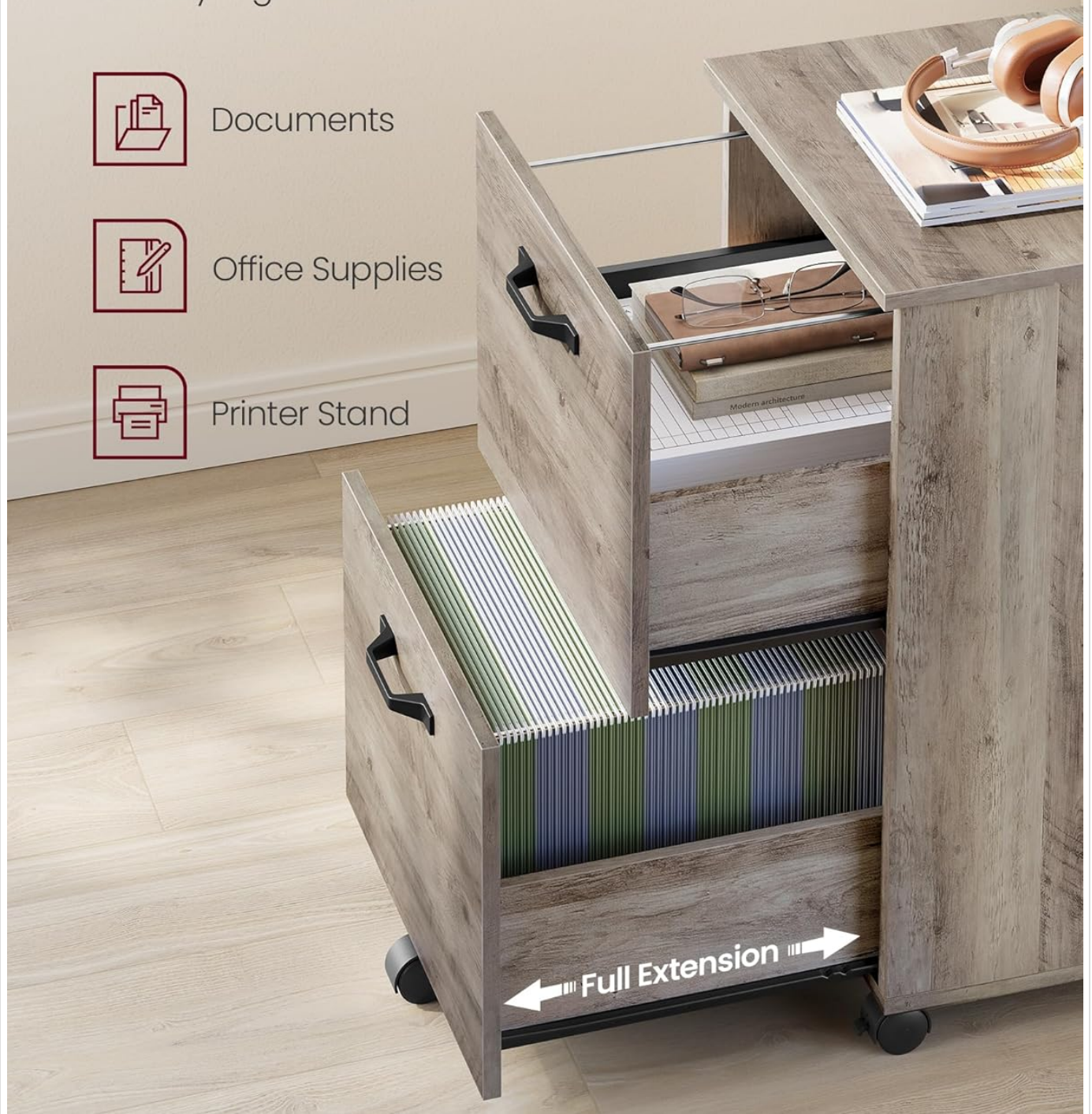
Image: The file cabinet with both drawers open, demonstrating ample space for hanging files, documents, and office supplies, emphasizing full extension for accessibility.