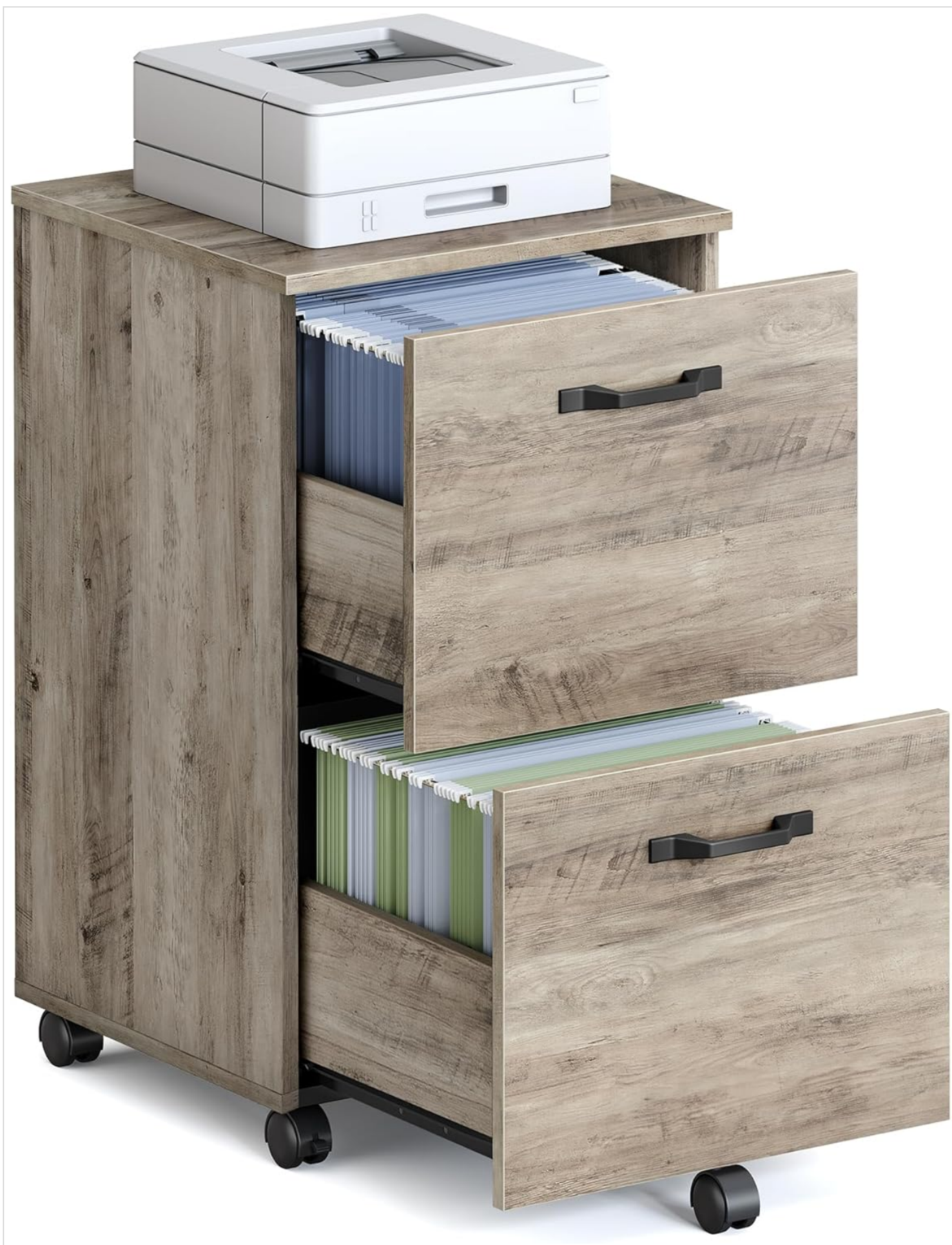
Image: The VASAGLE 2-Drawer Rolling File Cabinet in Heather Greige, featuring two drawers designed for file storage and a top surface suitable for a printer.