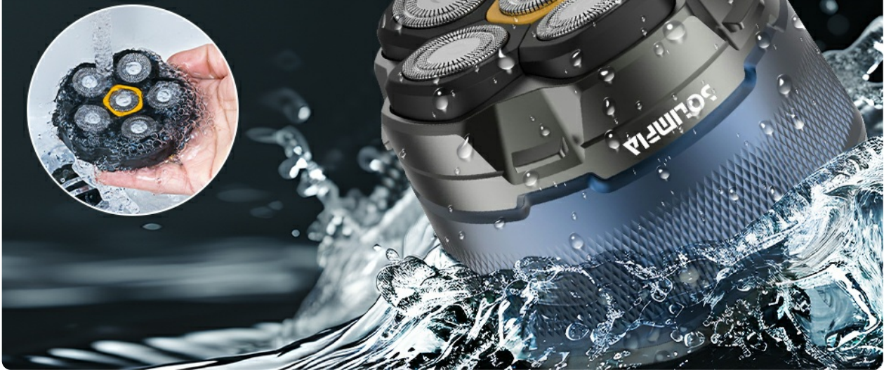
Figure 5.2: The shaver being rinsed under running water, highlighting its IPX6 waterproof rating.

Clean and Hygienic After Rinsing Under Running Water