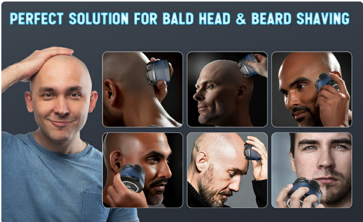
Figure 4.2: Demonstrating the versatility of the shaver for both head and beard shaving.

The SOLIMPIA FK-8750 is IPX6 waterproof, allowing for both wet and dry shaving. For a dry shave, ensure your skin is clean and dry. For a wet shave, you may use shaving foam or gel for added comfort. Gently move the shaver in circular motions over the desired area, ensuring the floating heads maintain contact with your skin. The 6D floating heads are designed to adapt to the contours of your head, face, and neck for a close and comfortable shave.