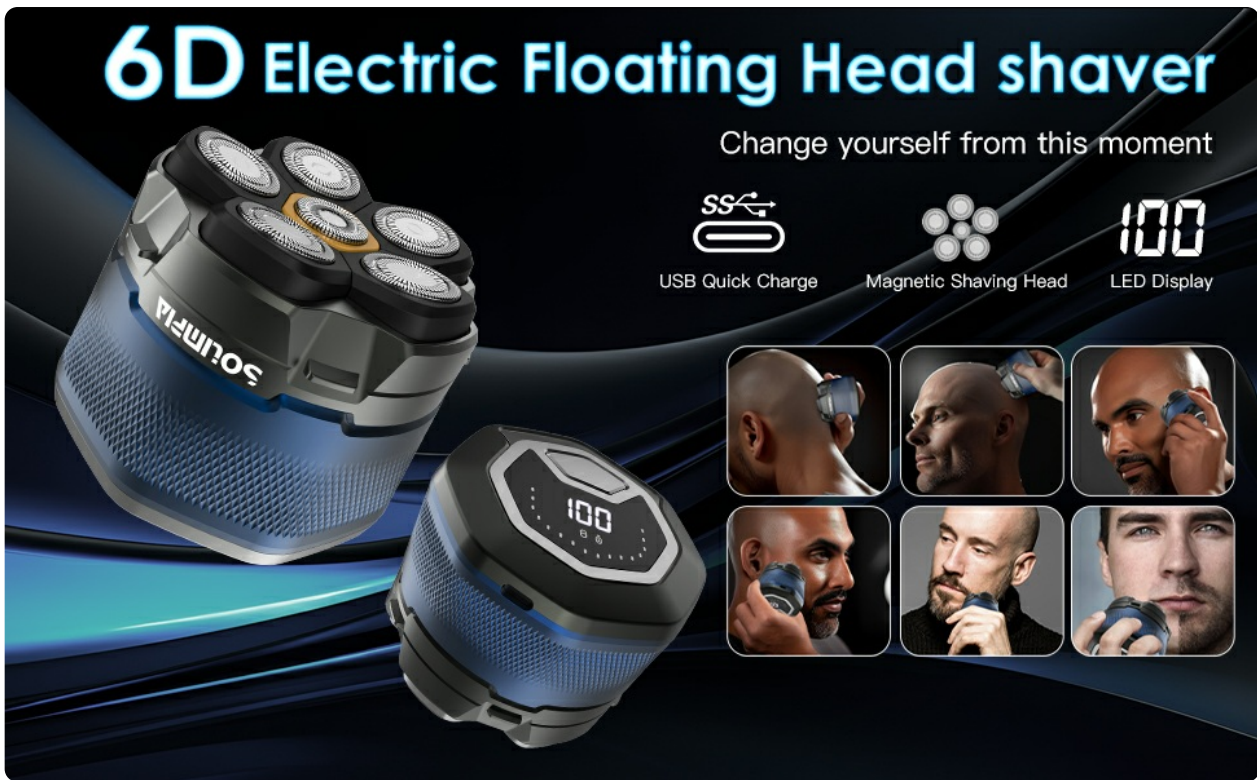
Figure 2.2: Overview of the 6D Electric Floating Head Shaver's features including USB Quick Charge, Magnetic Shaving Head, and LED Display.