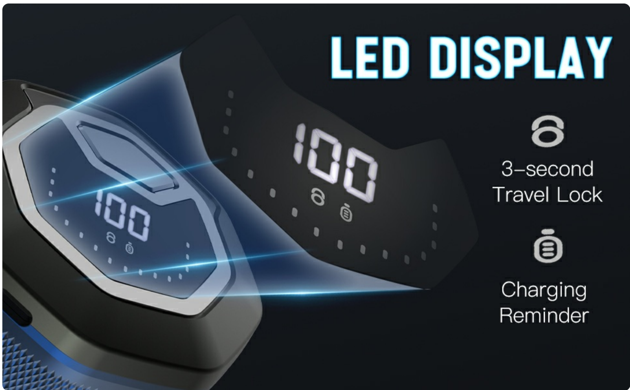
Figure 4.1: The LED display showing battery level, travel lock, and charging reminder.