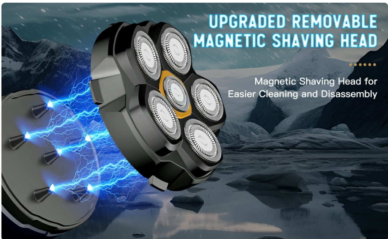
Figure 5.1: The magnetic shaving head detaching for easy cleaning.