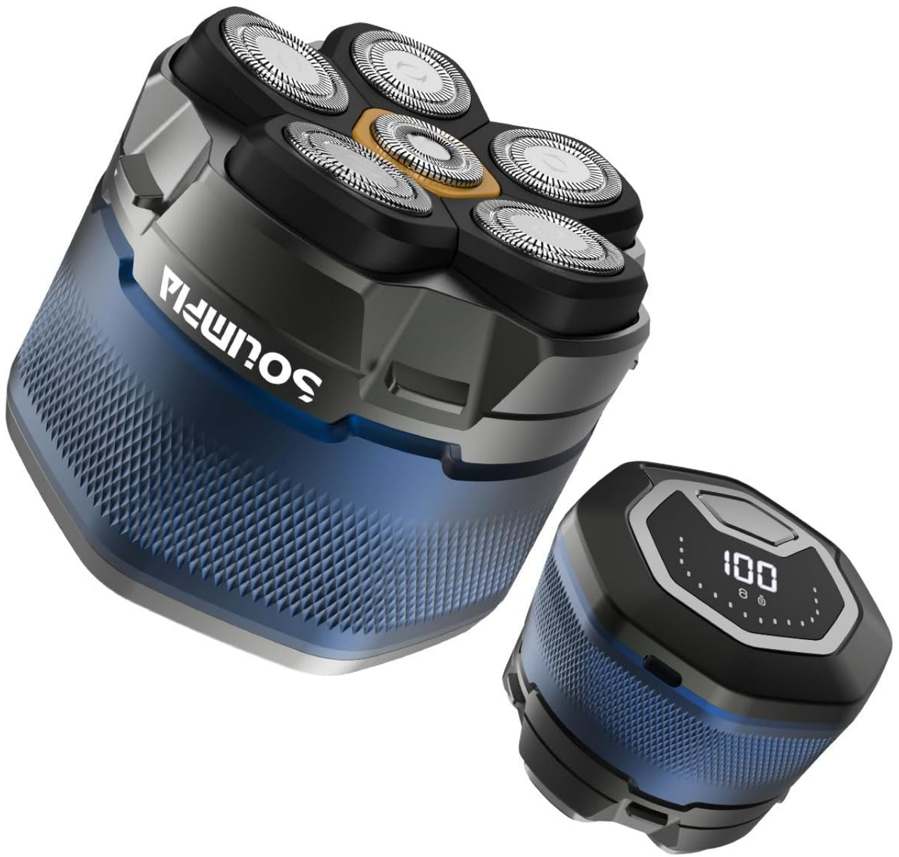
Figure 2.1: SOLIMPIA FK-8750 6D Electric Head Shaver.