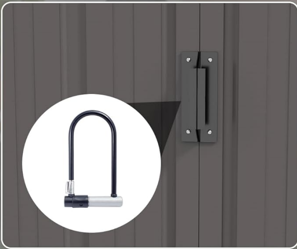
Lockable Design You can add a padlock for added security (not included)