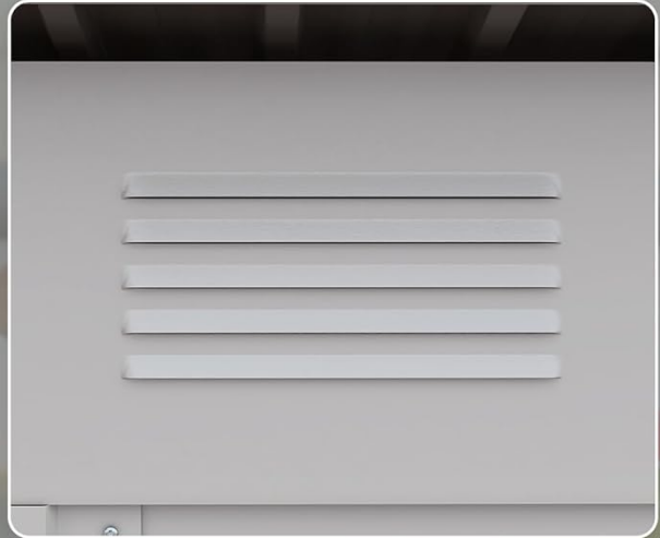
2 Ventilation Windows For excellent air flow