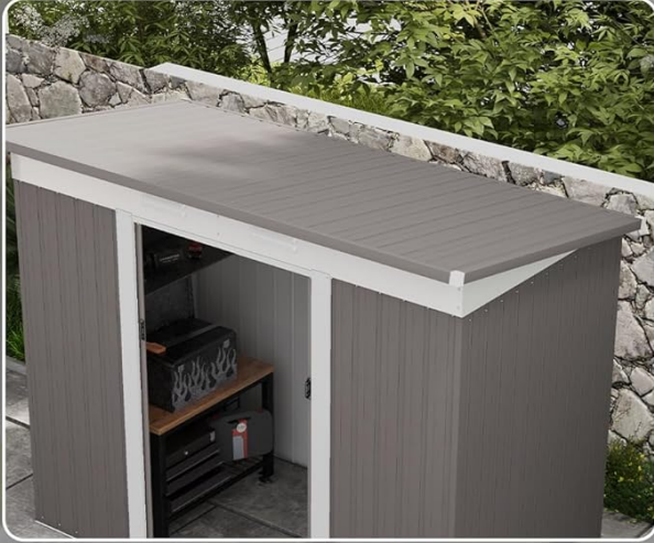
Tilted Roof Prevent water accumulation