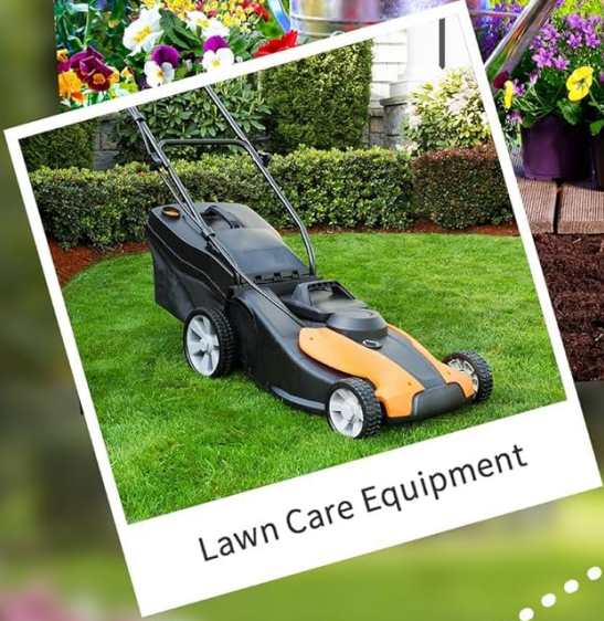
Lawn Care Equipment