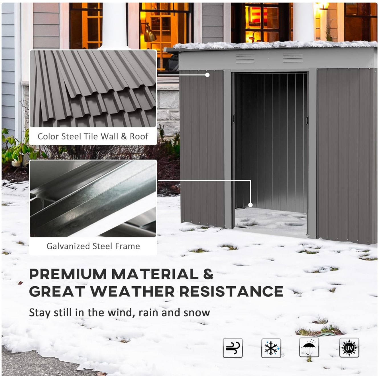
Figure 3.4: Illustration of the shed's construction materials: color steel tile for walls and roof, and galvanized steel for the frame, ensuring weather resistance.

Your browser does not support the video tag.