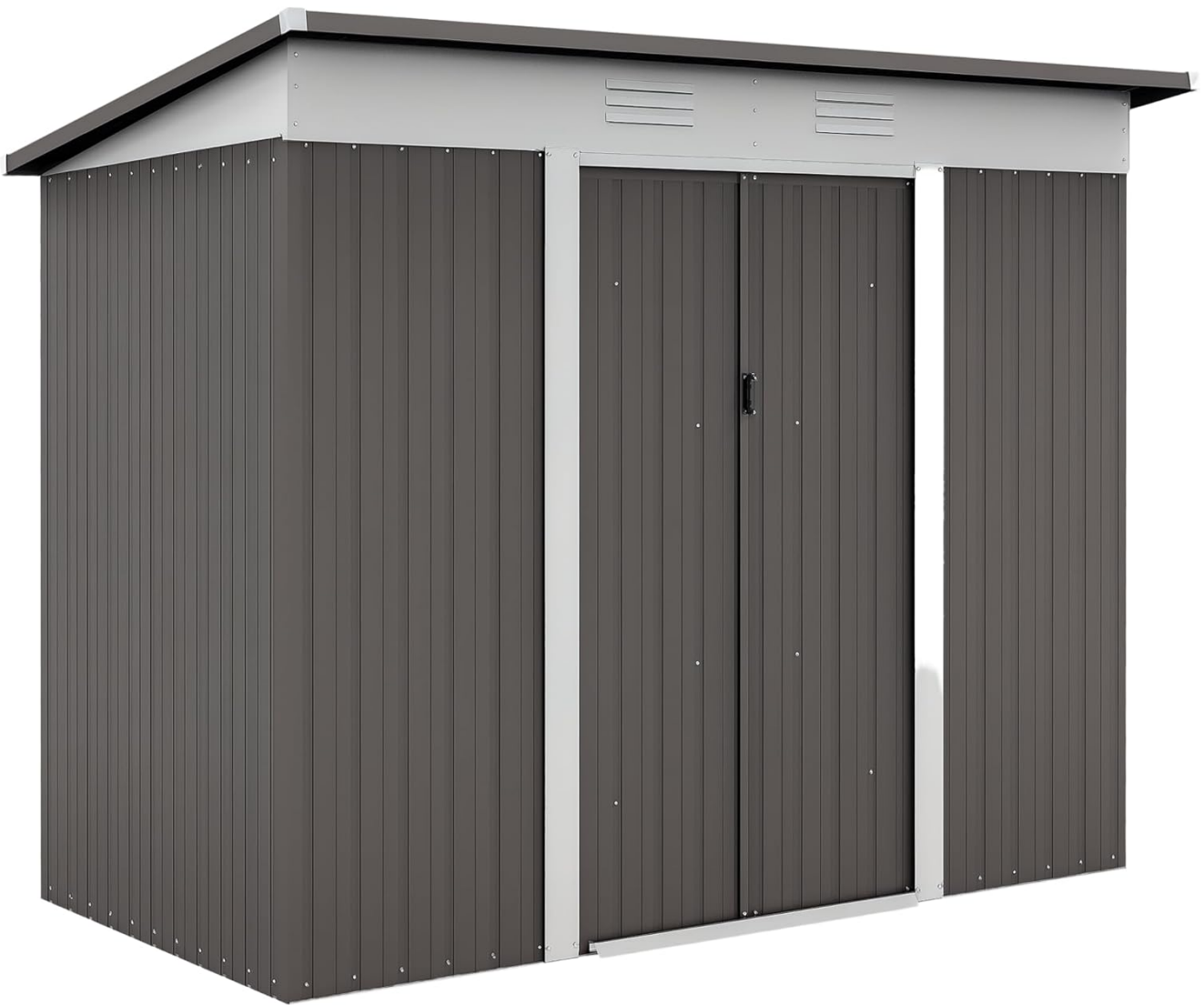
Figure 1.1: Exterior view of the Outsunny 8' x 4' Metal Lean-to Garden Shed.