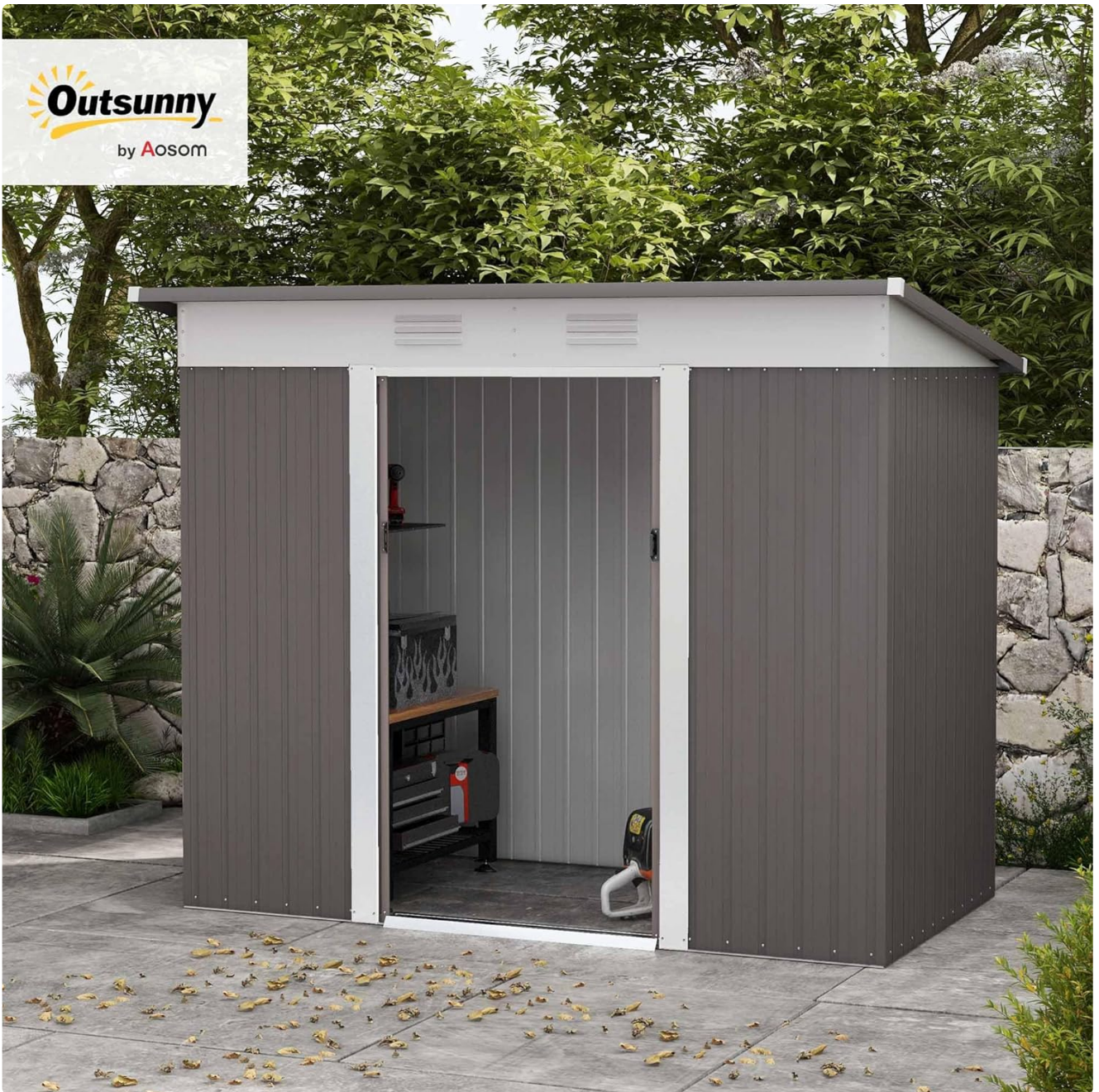
Figure 3.1: Shed with double sliding doors open, revealing interior storage space.