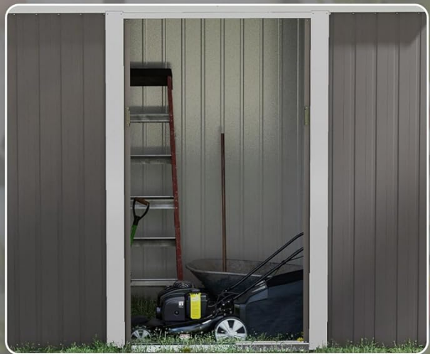
Double Sliding Door More convenient and more space saving to open than panel doors