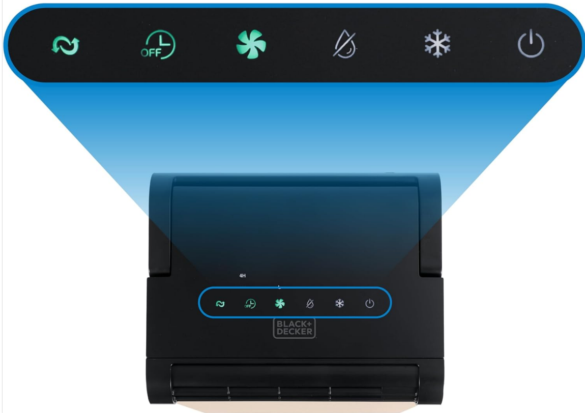
Image: The electronic control panel displaying various function icons and LED indicators.