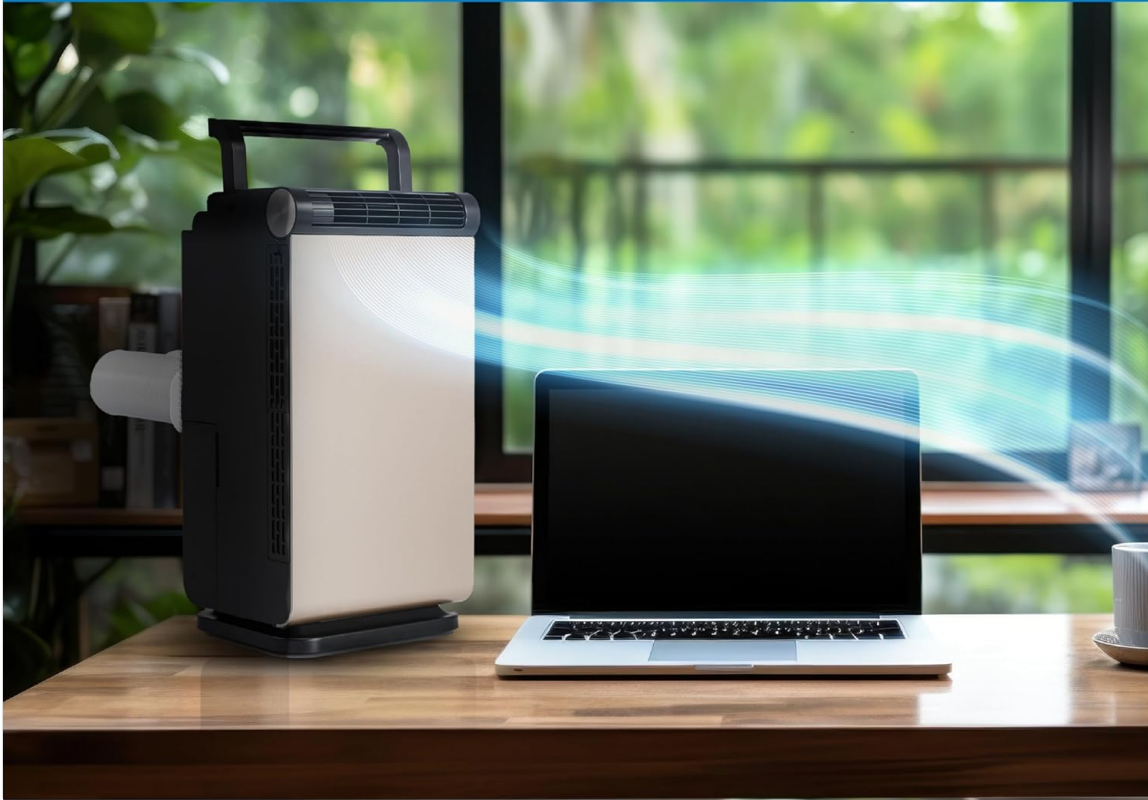
Image: The unit providing personal cooling in a workspace environment.