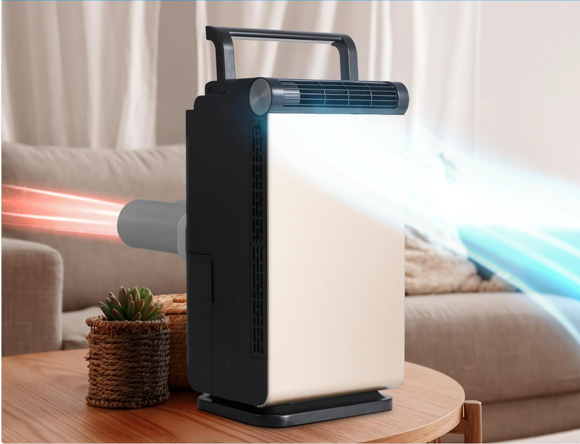
Image: The portable air conditioner shown with its dual exhaust hoses connected, illustrating how warm air is directed away from the unit.