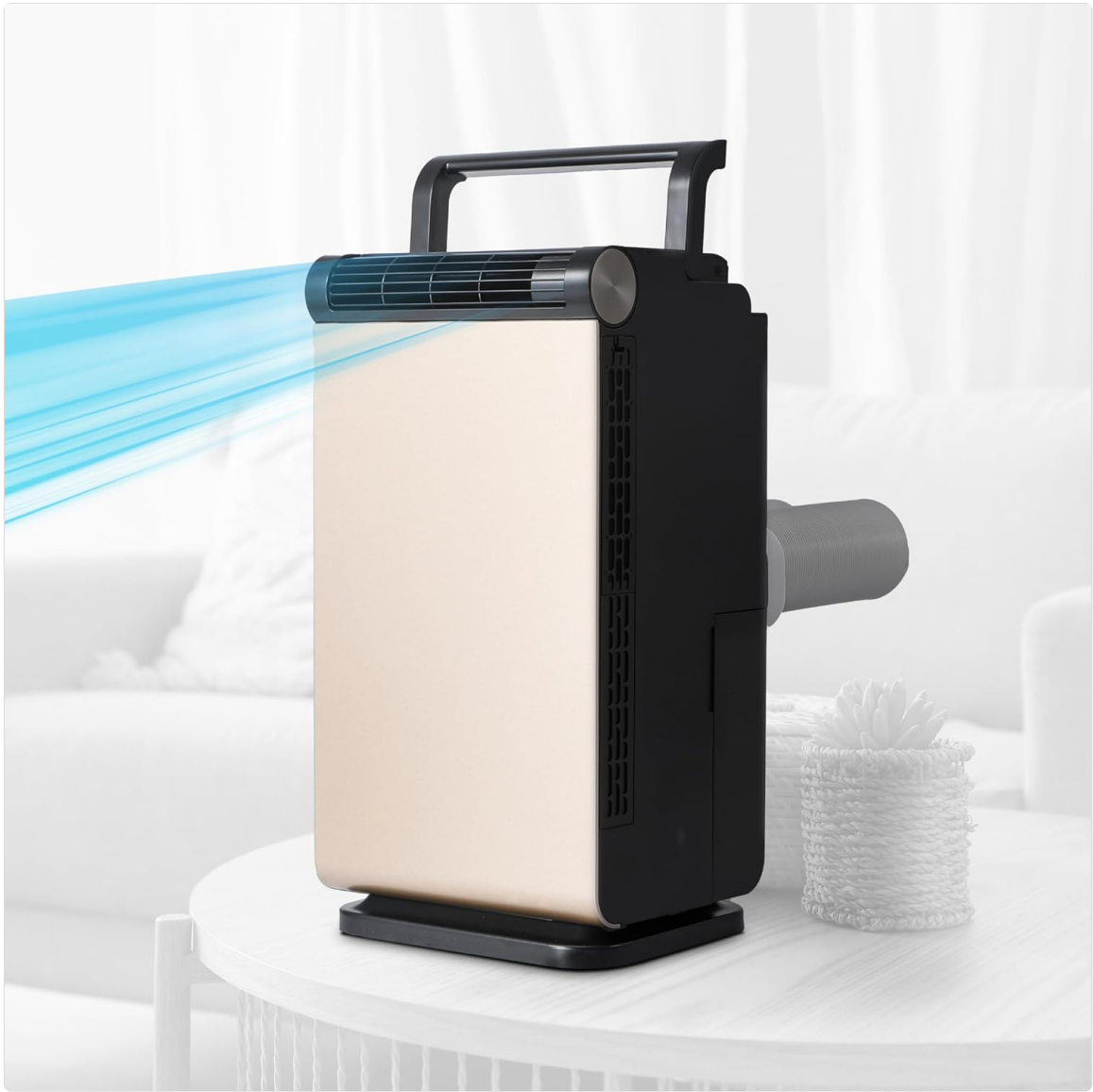
Image: The portable AC actively cooling, demonstrating its airflow in a personal space.