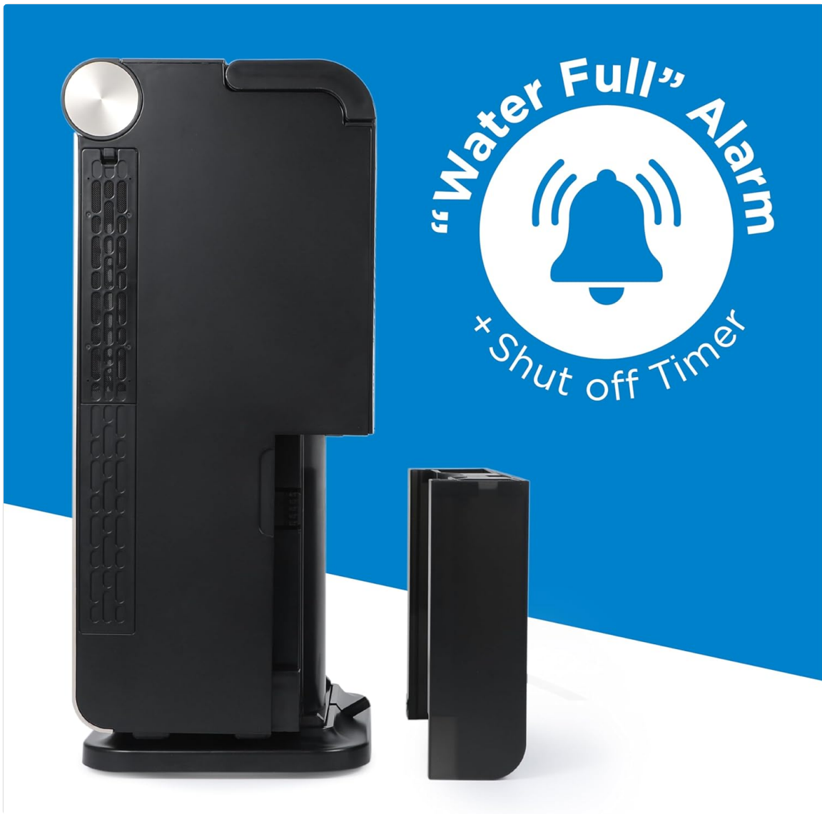
Image: The unit's side panel indicating the water collection area and alarm features.