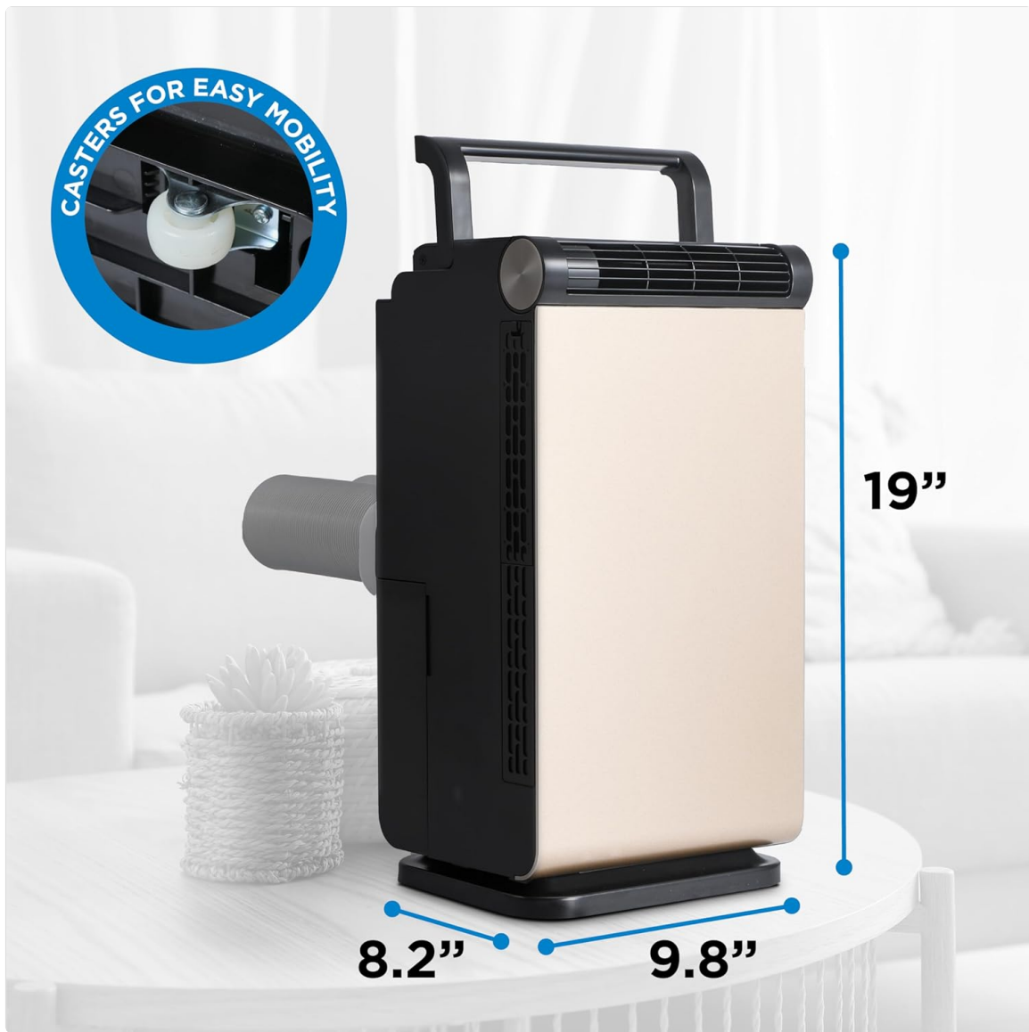
Image: A visual representation of the unit's compact dimensions and the integrated casters for easy movement.