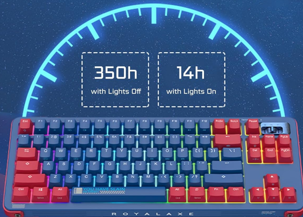
Image: Battery life estimates for the keyboard with and without RGB lighting.