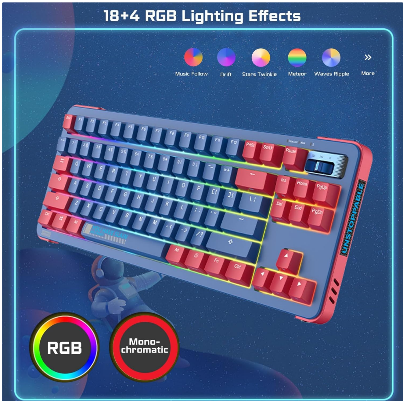
Image: Examples of RGB lighting effects available on the keyboard.