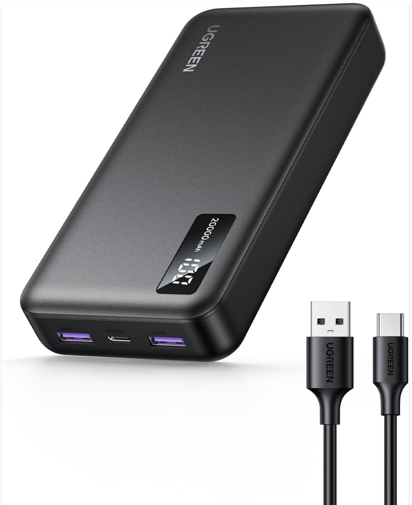
Figure 1: UGREEN 20000mAh Power Bank showing its sleek black design, digital display, and included charging cable.