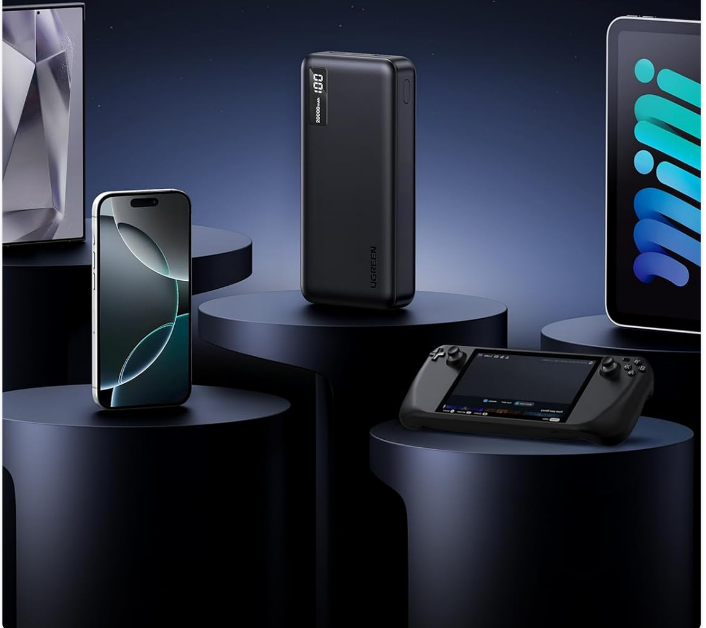
Figure 2: The 20,000mAh capacity allows for multiple charges of various devices, including smartphones, tablets, and gaming consoles.