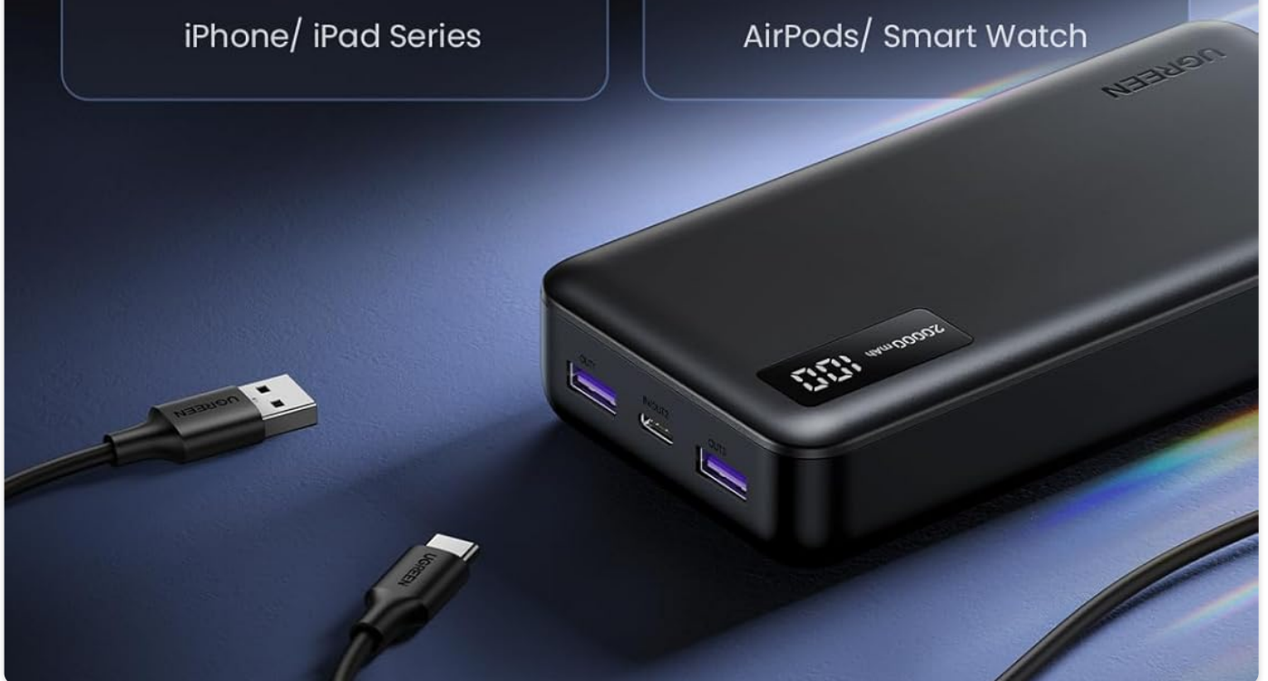
Figure 7: Universal compatibility ensures the power bank works seamlessly with a wide array of devices, including those requiring low-current charging.