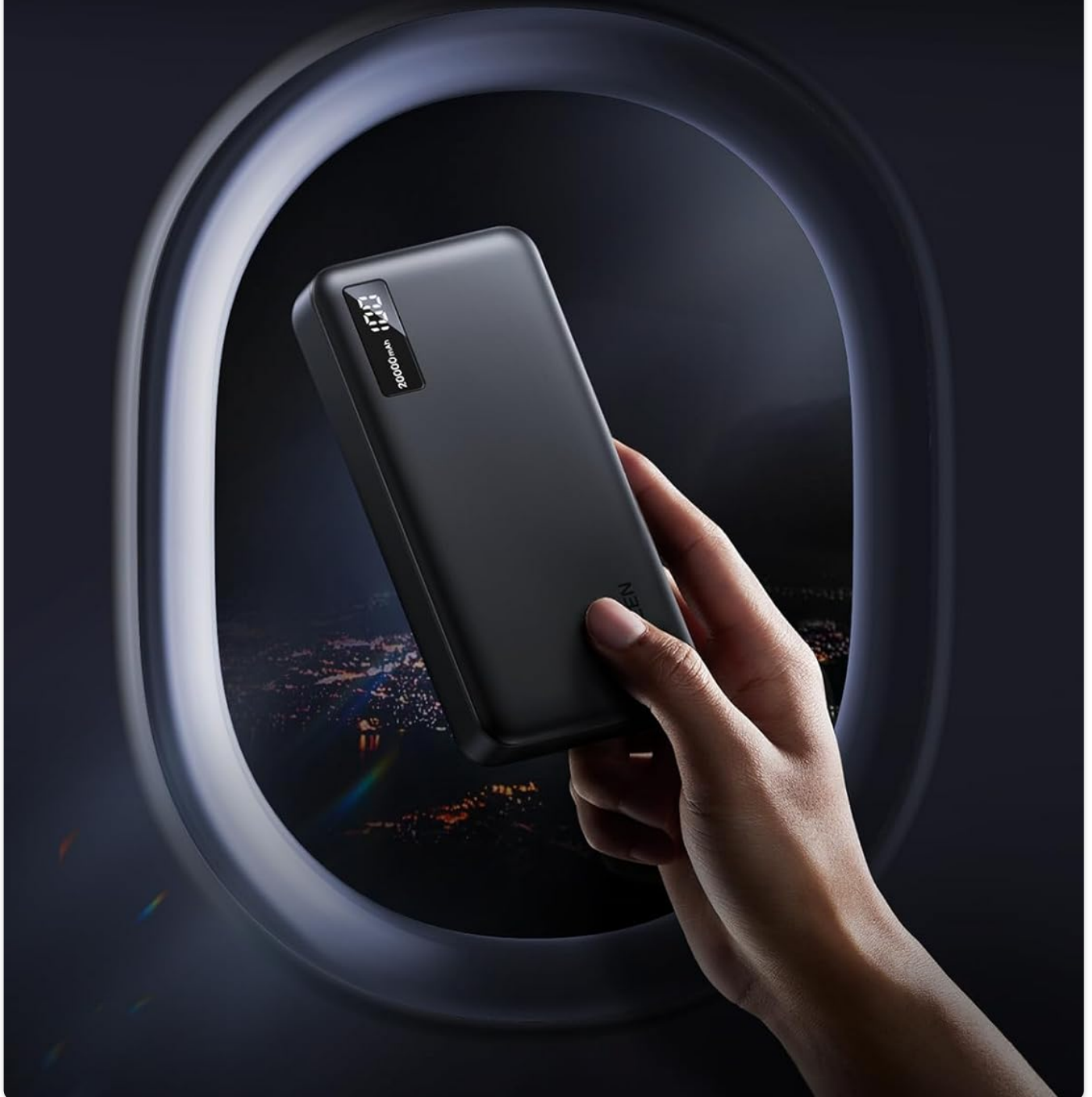
Figure 8: The power bank is airline approved, making it a convenient travel accessory.