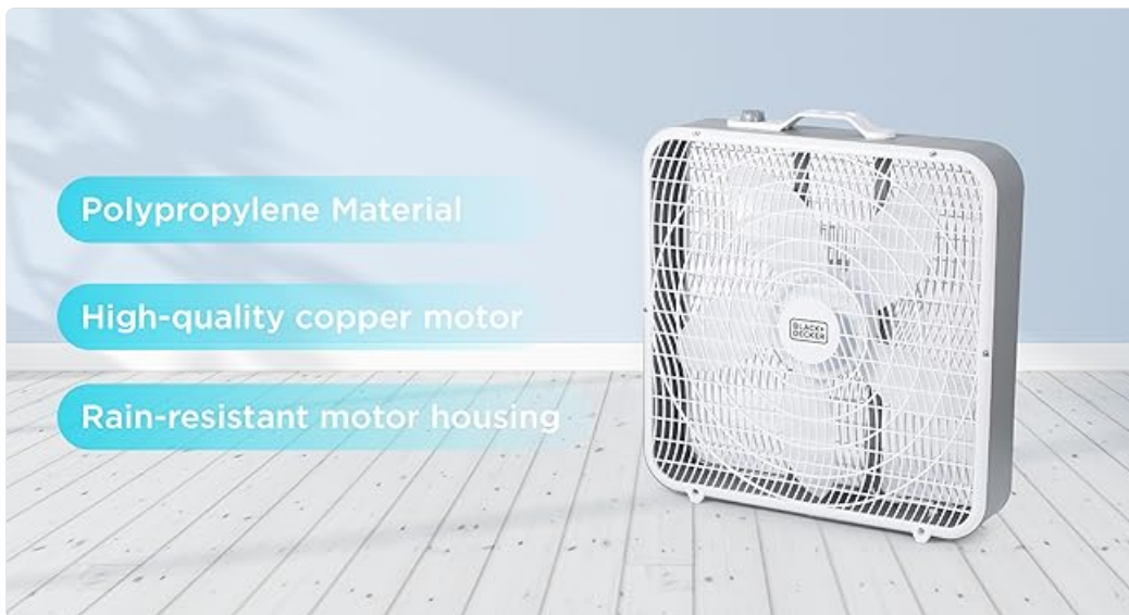
Figure 6: The fan is ideal for various spaces including office, home, and garage.