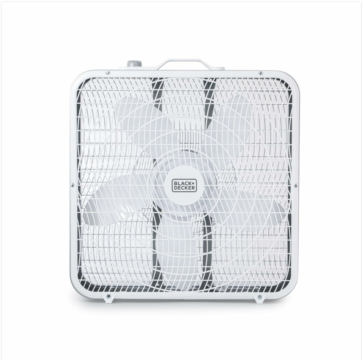
Figure 1: Front view of the BLACK+DECKER 20-inch Box Fan.