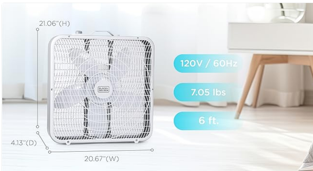
Figure 7: Detailed dimensions of the 20-inch Box Fan.