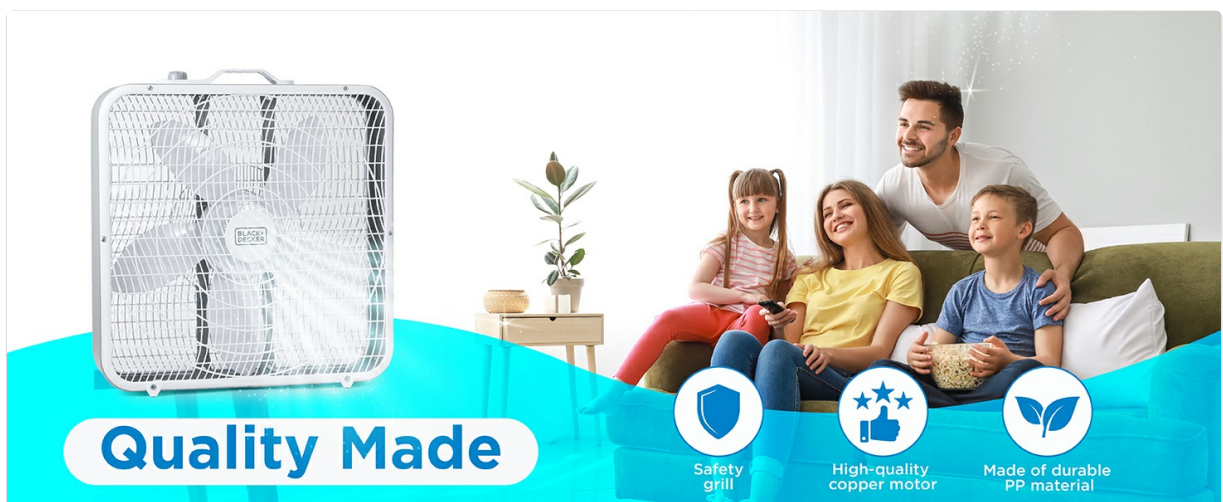
Figure 4: The integrated carry handle allows for easy portability of the fan.