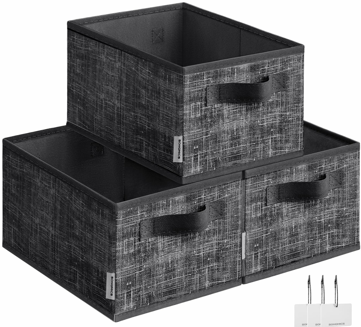
Image: Three Ink Black SONGMICS Storage Cubes on a white shelf, demonstrating their use in closet organization.