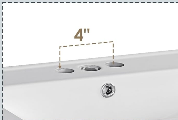
4" Pre-Drilled Faucet Holes (faucet not included)