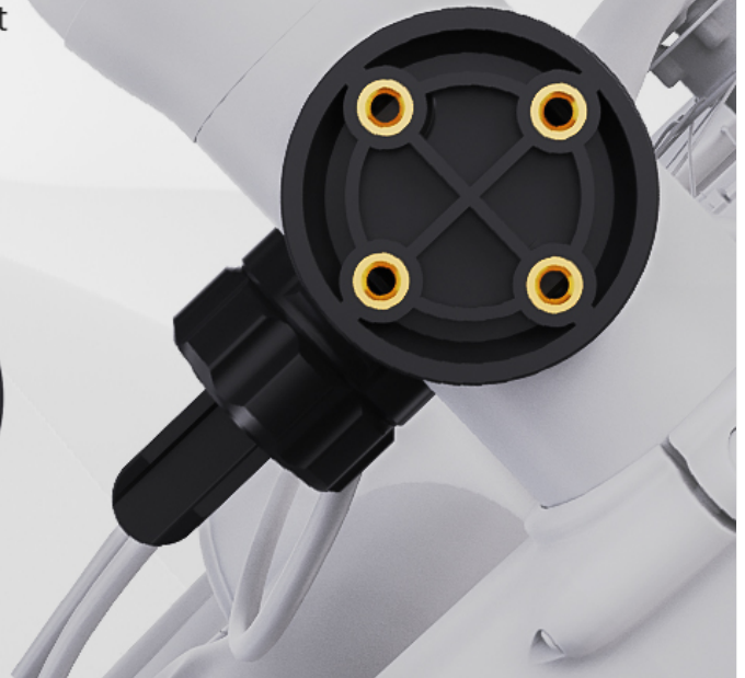
Image: Close-up of the mount's base showing the four screw holes for adjusting device orientation.