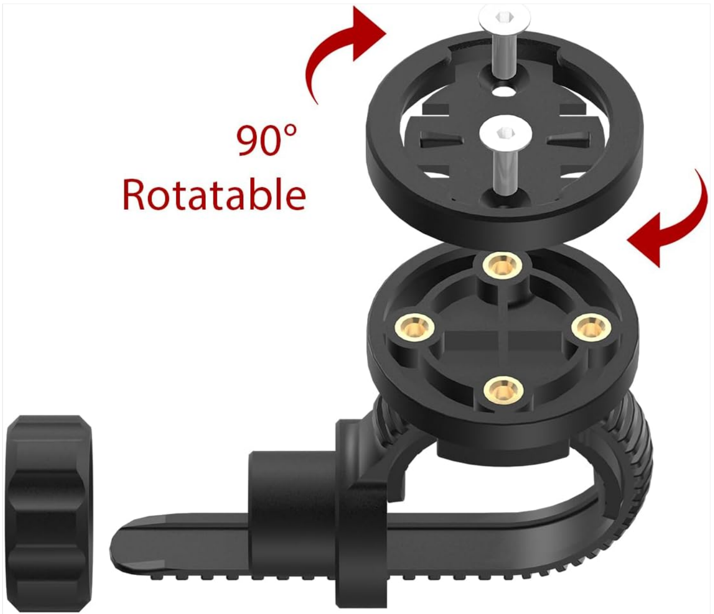
Image: Exploded view demonstrating the 90-degree rotatable base for adjusting device orientation.