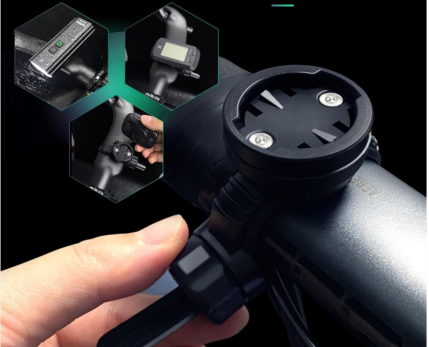
Image: Examples of compatible devices such as GPS units, spotlights, and radar taillights mounted on the S6-Adjustable bracket.