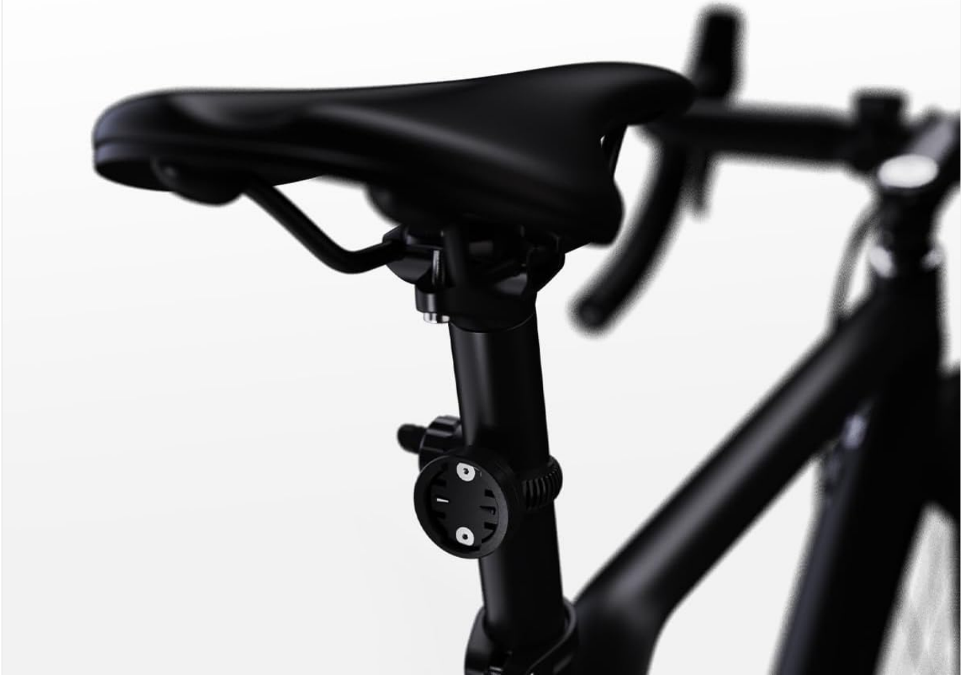
Image: The S6-Adjustable mount on a seatpost, demonstrating its versatility for rear-mounted accessories.

Suitable for circular handlebars, flat handlebars, handlebars, seat tubes, and other positions.