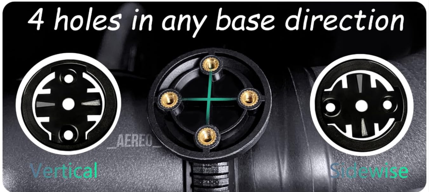
Image: The S6-Adjustable mount securely attached to a round handlebar, ready for device attachment.