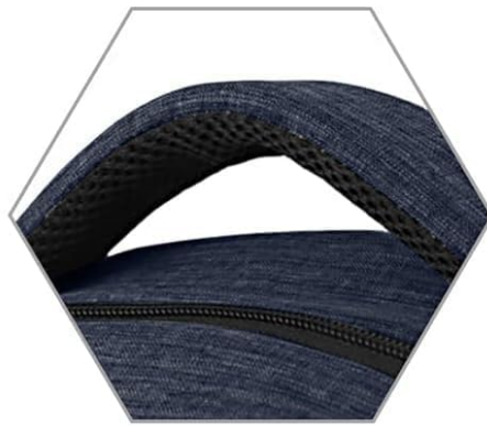
Foam Padded Top Handle