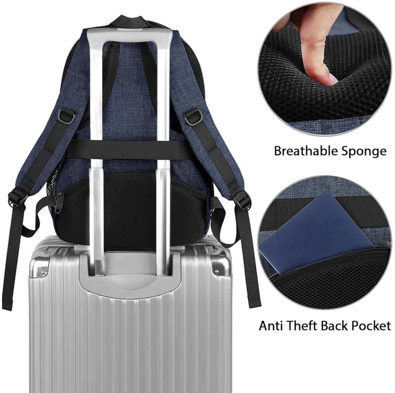
Image: The MATEIN backpack securely fastened to the handle of a rolling suitcase using its integrated trolley sleeve.

Luggage strap fixes to the rolling luggage, secure your backpack in place and convenient.