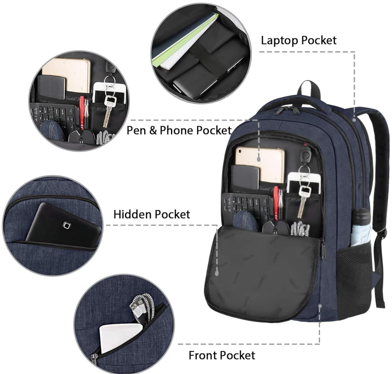
Image: An exploded view illustrating the various storage compartments, including laptop sleeve, main section, and front organizer pockets.