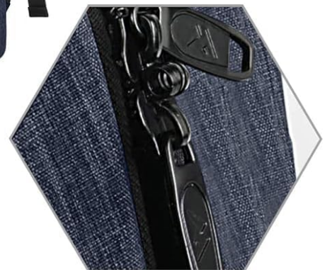
2-Way Dual Zippers

Image: A close-up of the backpack's material demonstrating its water-resistant properties with water droplets beading on the surface.