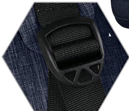
Adjustable Shoulder Straps