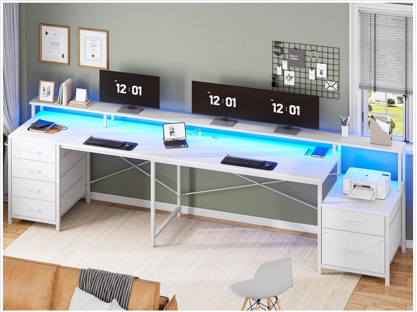
Figure 5: Full Size Monitor Stand for Ergonomic Posture. The elevated monitor shelf promotes a healthier sitting position, reducing neck and back strain.