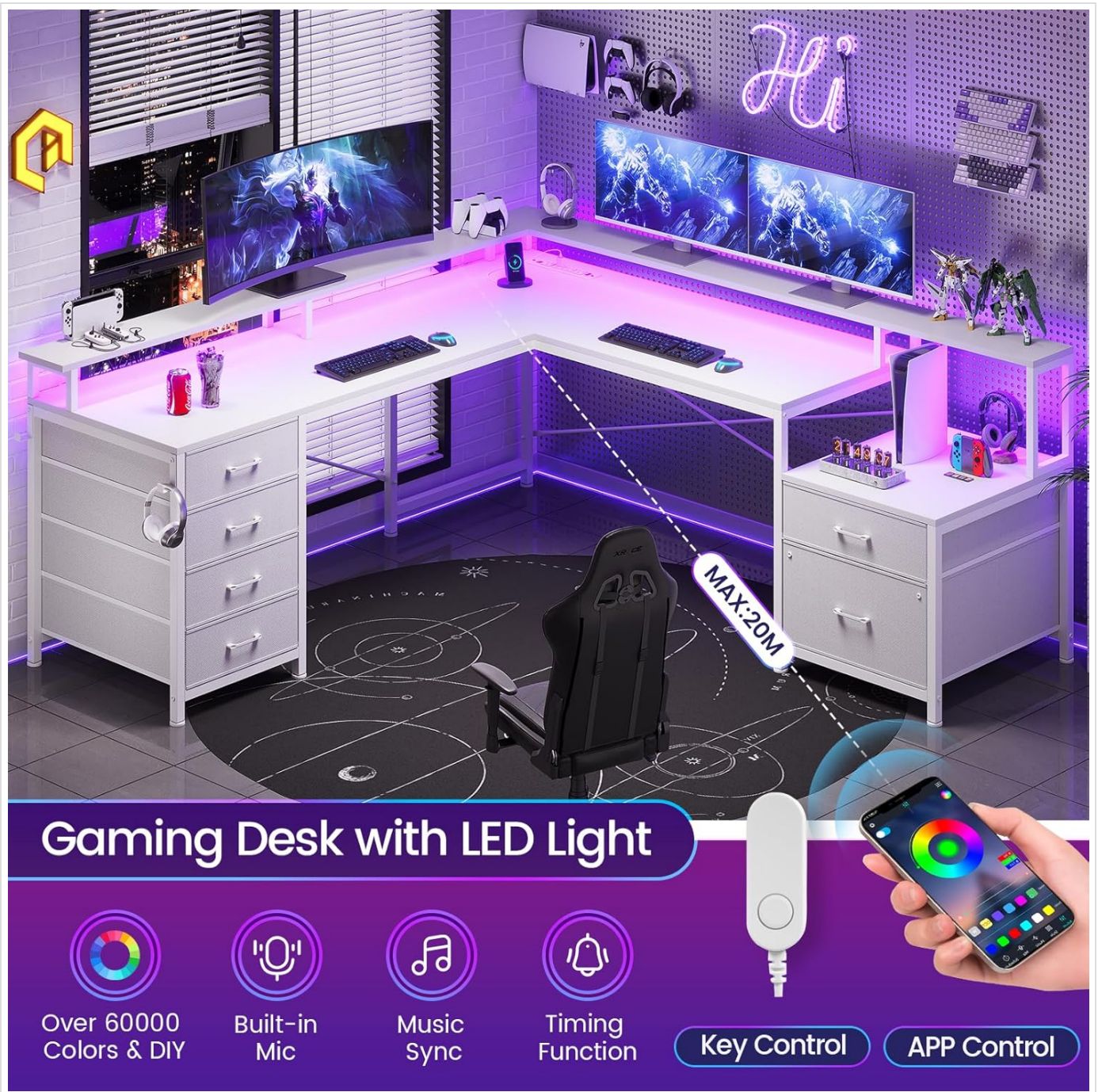
Figure 4: Gaming Desk with LED Light Features. The LED strip offers extensive customization via both physical and app controls, including music synchronization.