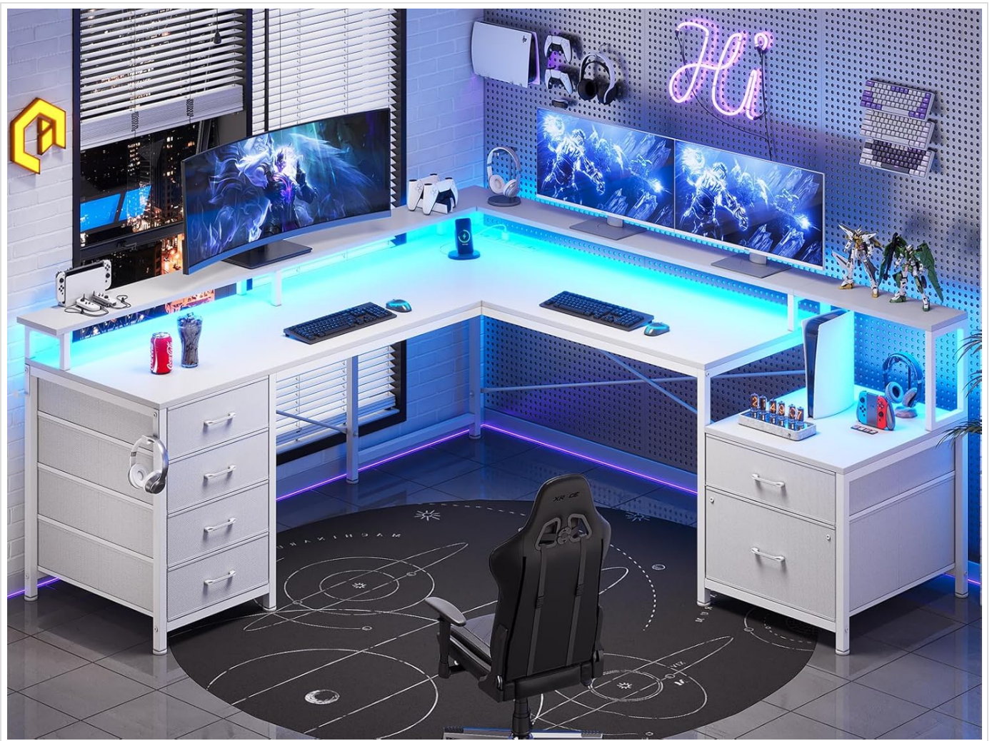
Figure 2: Assembled SEDETA L Shaped Desk in a gaming setup, showcasing its spacious design and integrated LED lights.