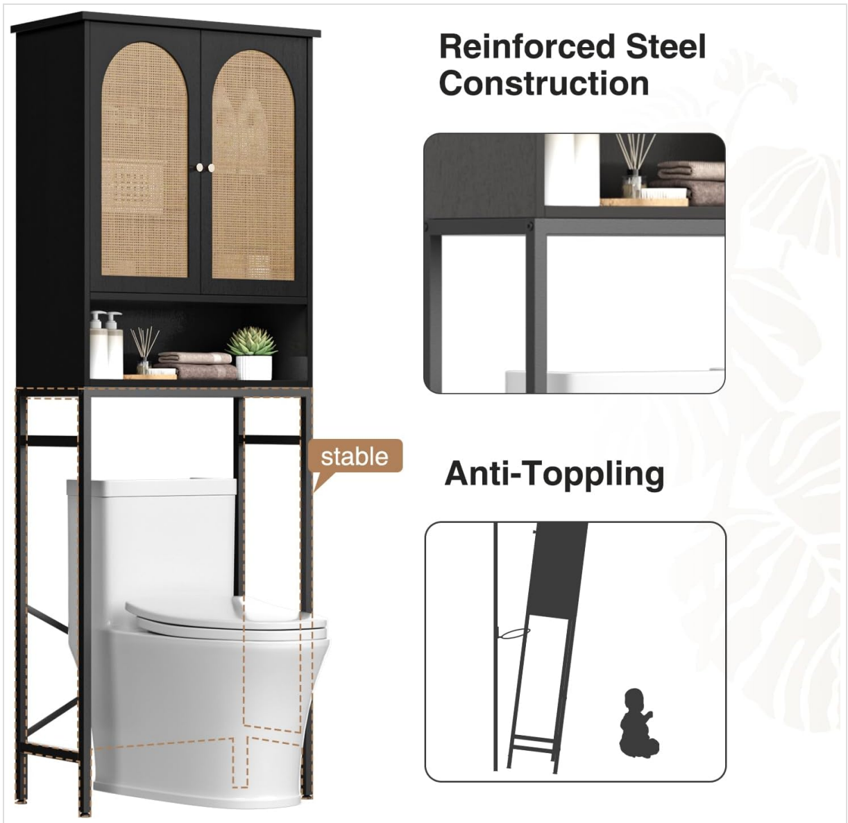
Image: Visual representation of the reinforced steel construction and the anti-toppling safety feature, emphasizing the cabinet's stability and user safety.