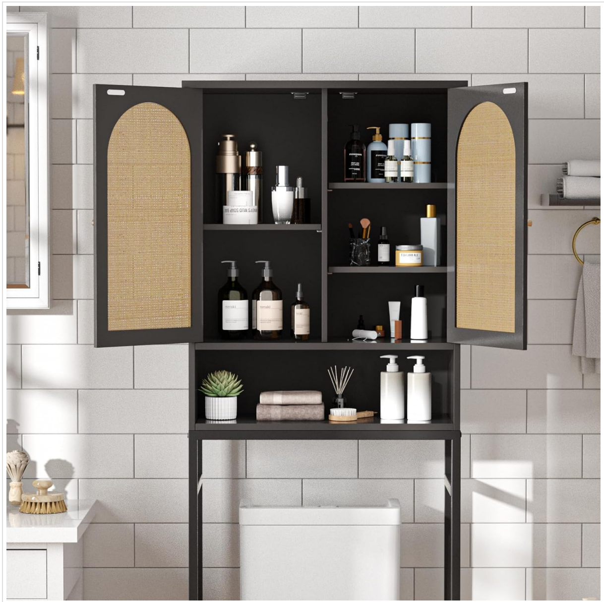
Image: The interior of the cabinet, demonstrating how the adjustable shelves can be utilized to store different sized items like toiletries and towels.