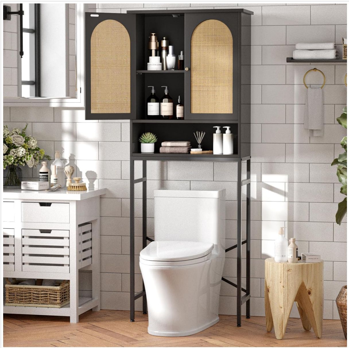
Image: The Rattan Toilet Storage Cabinet positioned over a toilet, showcasing its space-saving design and aesthetic integration into a bathroom setting.