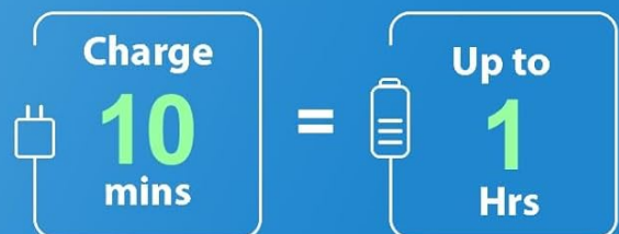
Image: Diagram illustrating the battery life and charging capabilities of the hadbleng Q28S earbuds and their 800mAh charging case, including Type-C fast charging.