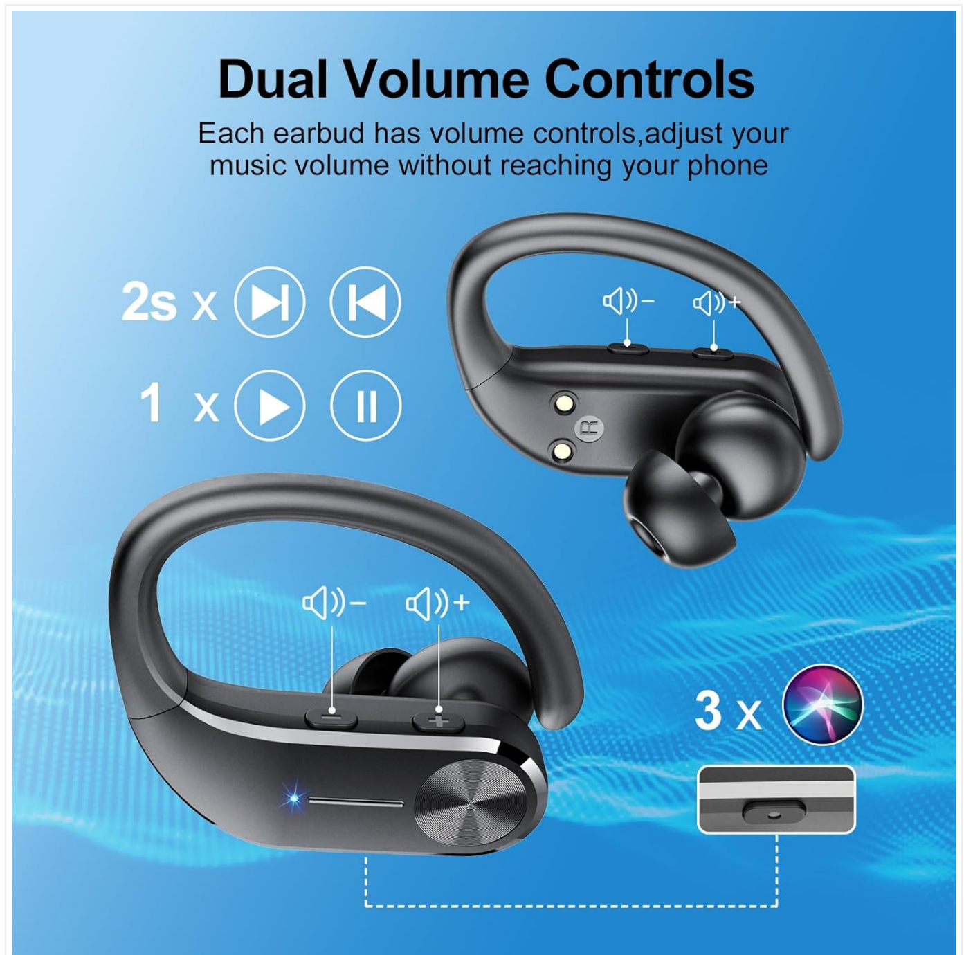
Image: Illustration detailing the one-button controls for music playback (play/pause, next/previous track) and call management (answer/end, reject call, voice assistant activation) on the Q28S earbuds.

The built-in microphone with ENC noise cancellation helps ensure clear communication during calls.