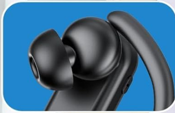
Ergonomically Designed Earbud