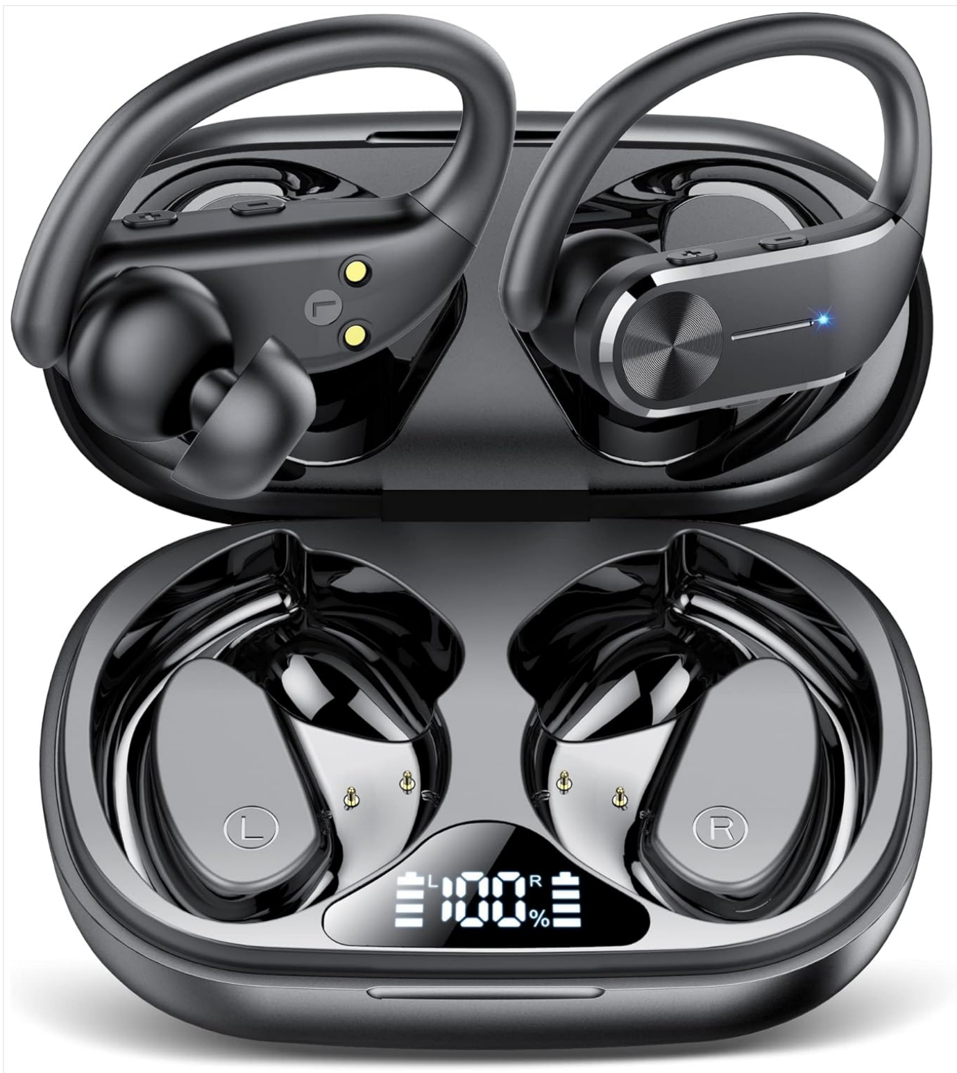
Image: hadbleng Q28S Wireless Bluetooth Earbuds shown open in their charging case, displaying the LED battery indicator.