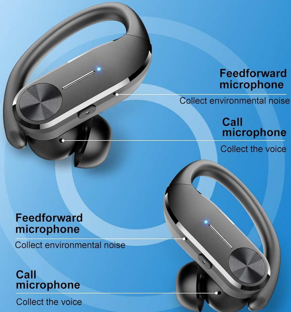
Image: Diagram highlighting the 4-microphone system on each Q28S earbud, with feedforward microphones collecting environmental noise and call microphones collecting the user's voice for high-definition calls.