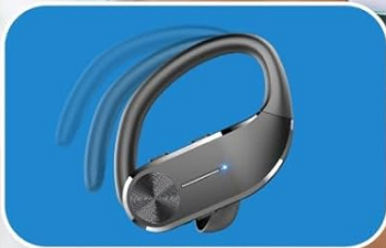
Flexible Ear hooks