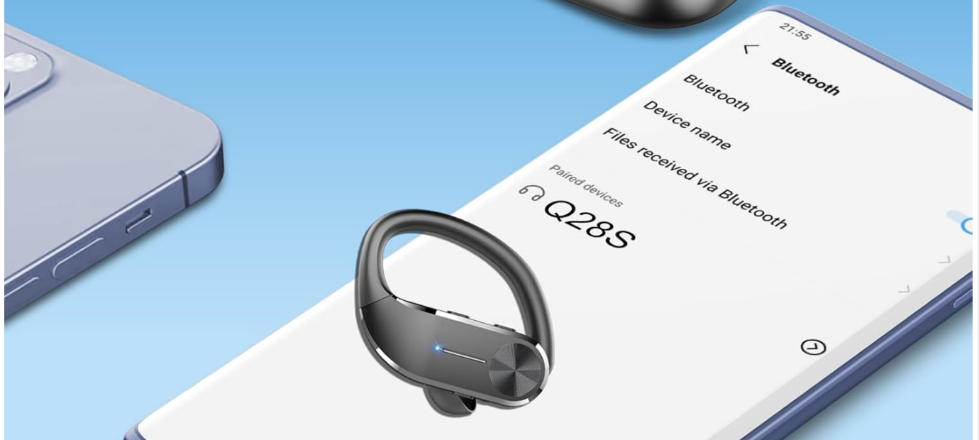
Image: Visual guide demonstrating the one-step auto-pairing feature of the Q28S earbuds. Opening the case powers them on and connects them, while closing the case disconnects and powers them off.

Your browser does not support the video tag.