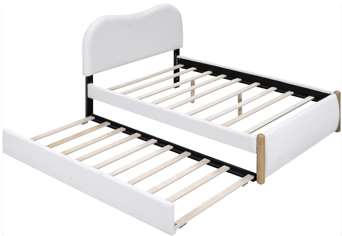
Image: Illustrative view of various bed frame components, including upholstered sections and wooden parts.