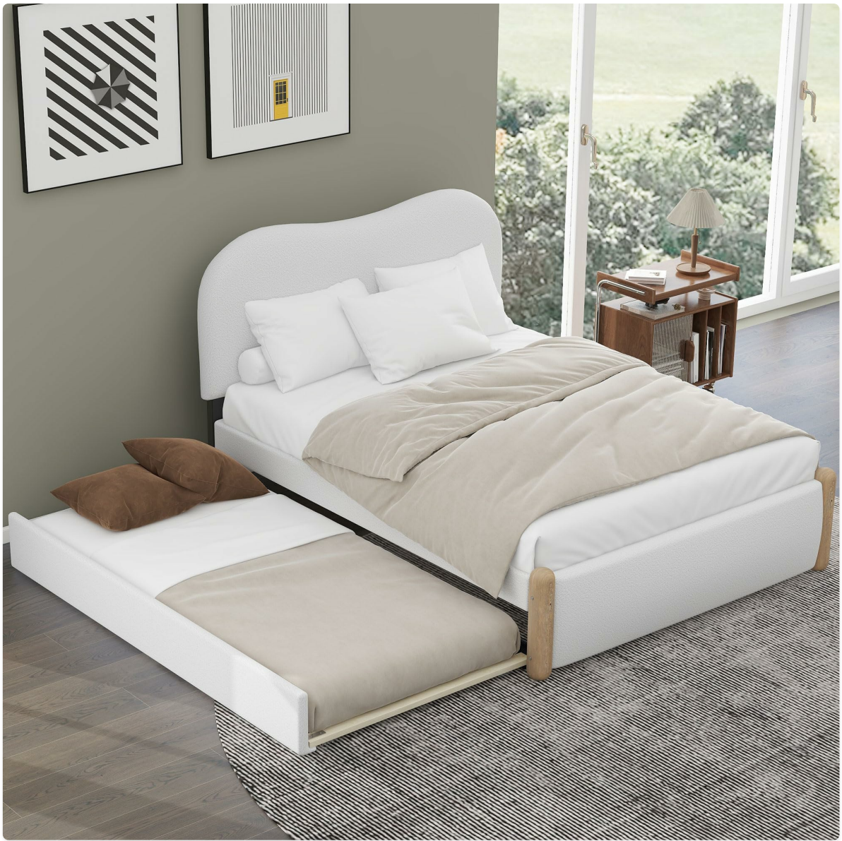
Image: Overall view of the Mirightone Full Bed Frame with Trundle, showcasing its design and functionality.