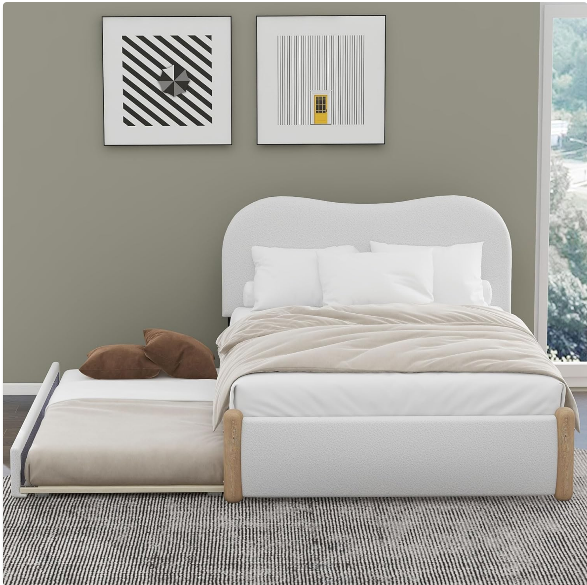
Image: The Mirightone Full Bed Frame with the trundle bed fully extended, ready for use.