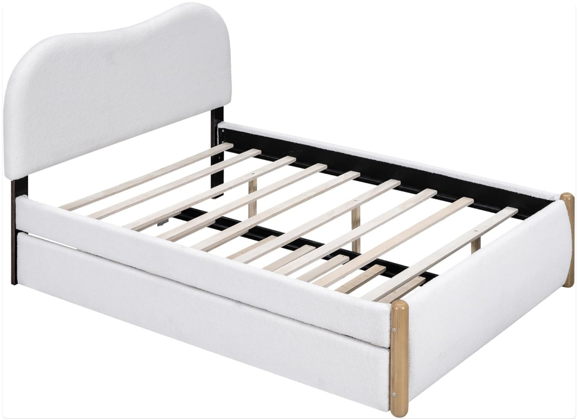
Image: The main bed frame with wooden slats properly installed, ready for a mattress.