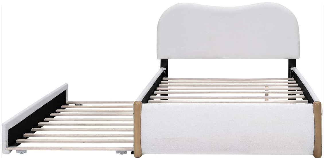
Image: Side view of the main bed frame with the trundle bed partially extended, showing its structure.