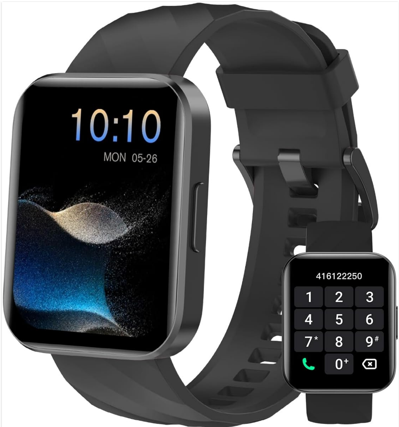
Image: The Dakofied Smart Watch in black, alongside its charging cable and user manual.