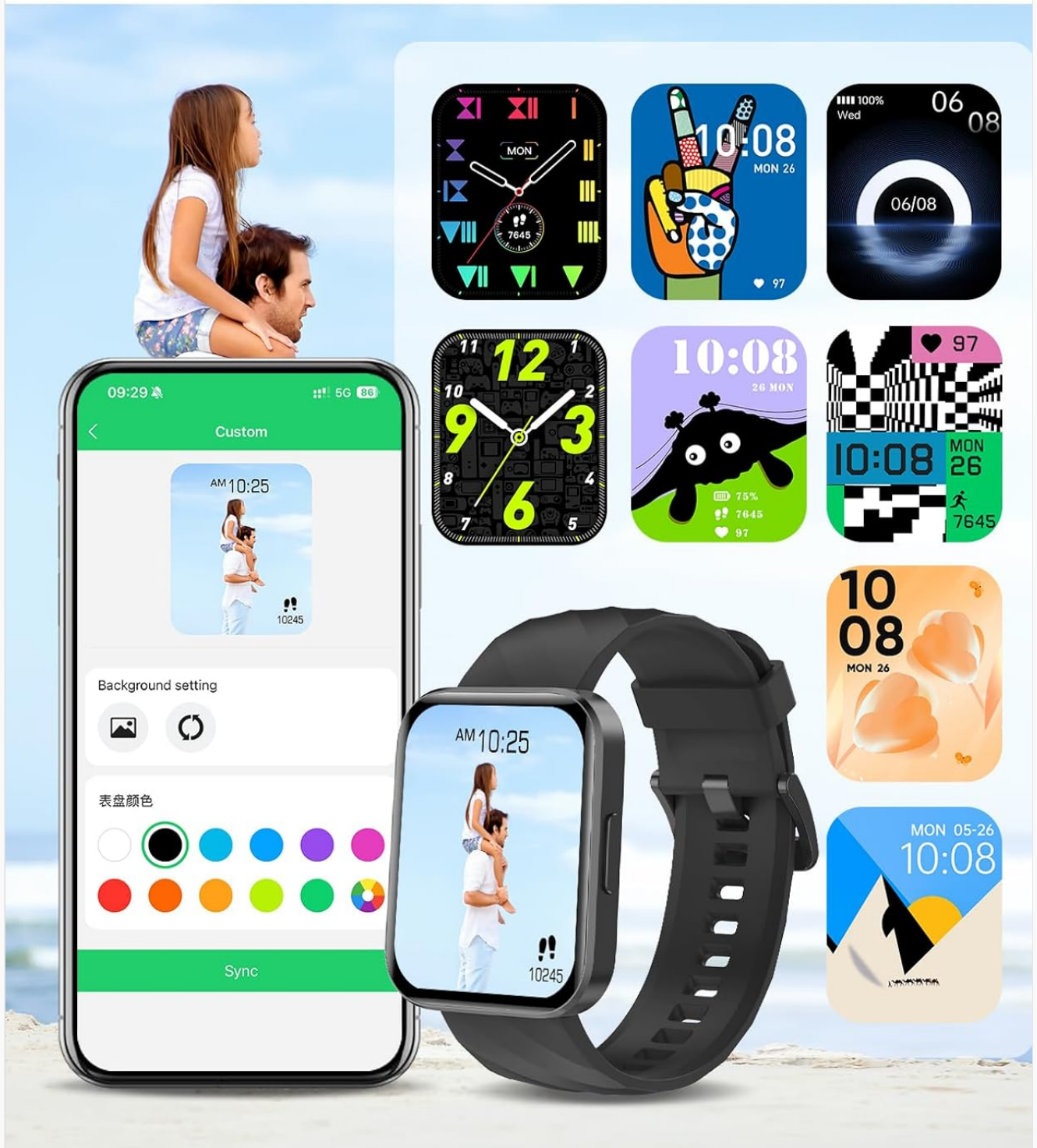
Image: A collection of diverse watch faces, including custom photo options, displayed on the smart watch and its companion app.