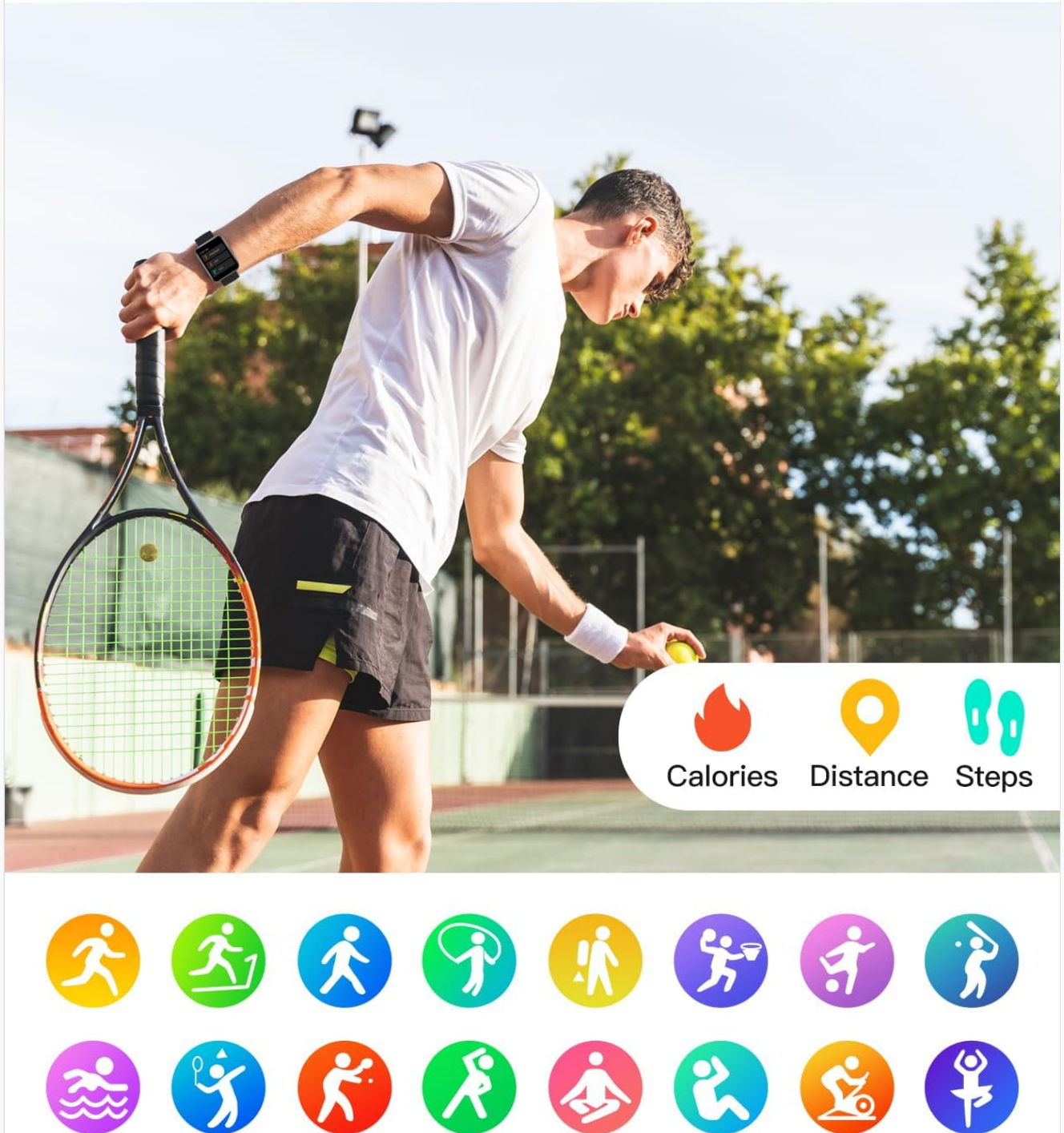
Image: A person engaged in tennis, with the watch displaying activity metrics and various sport mode icons.