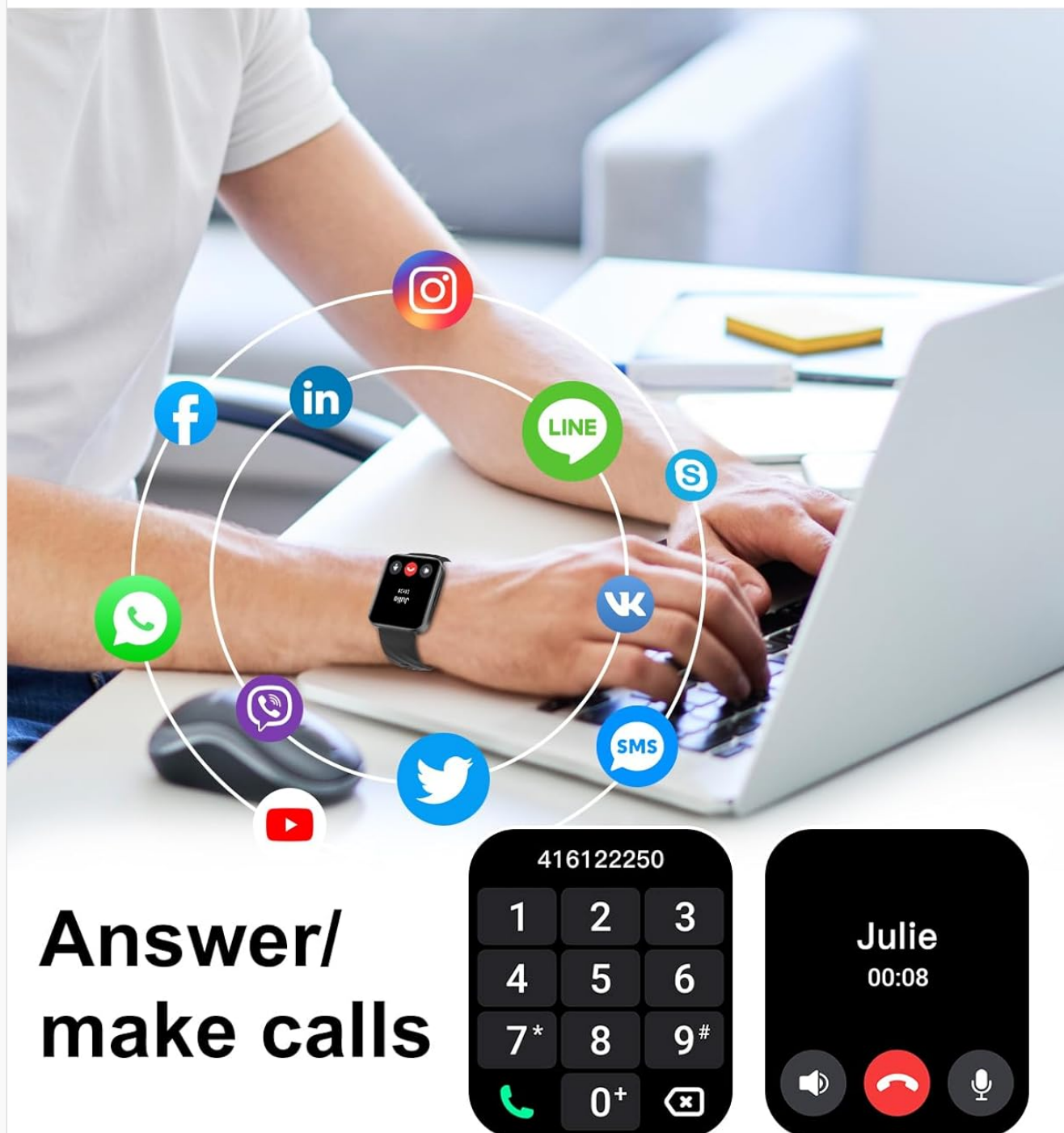
Image: The smart watch screen showing a call interface and various app notification icons.