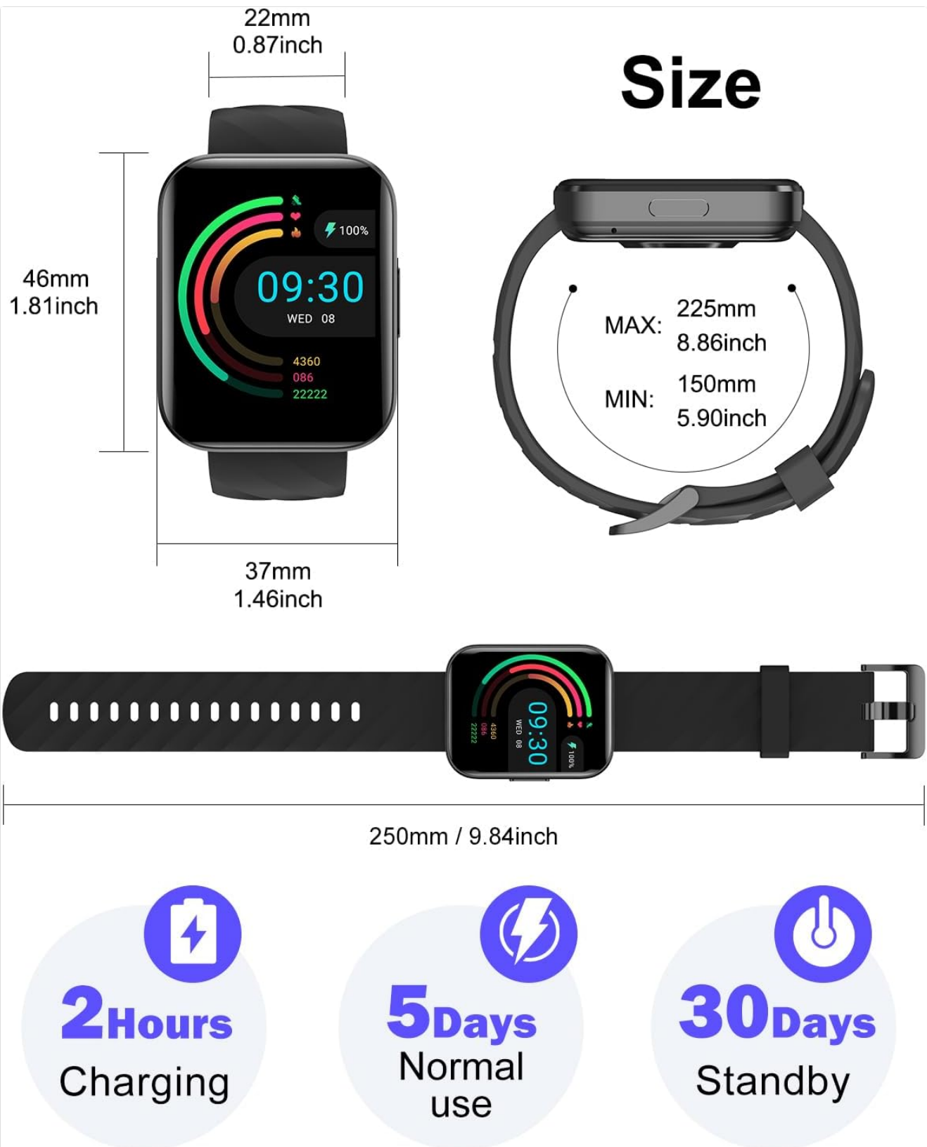
Image: Visual representation of the smart watch dimensions and battery performance (2 hours charging, 5 days normal use, 30 days standby).