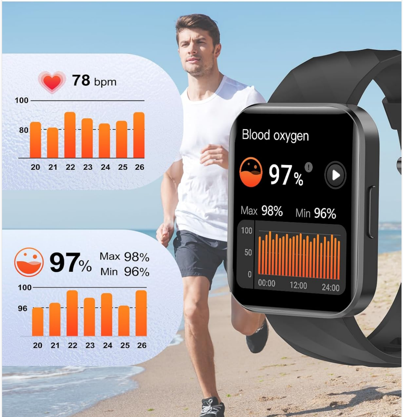
Image: The smart watch screen showing real-time heart rate (78 bpm) and blood oxygen (97%) readings with historical data graphs.