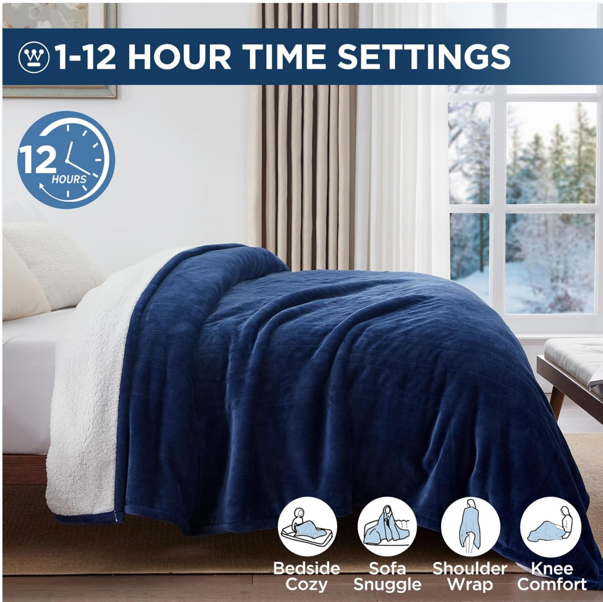
Image: The electric blanket is suitable for various uses, including on a bed, sofa, or as a personal wrap.