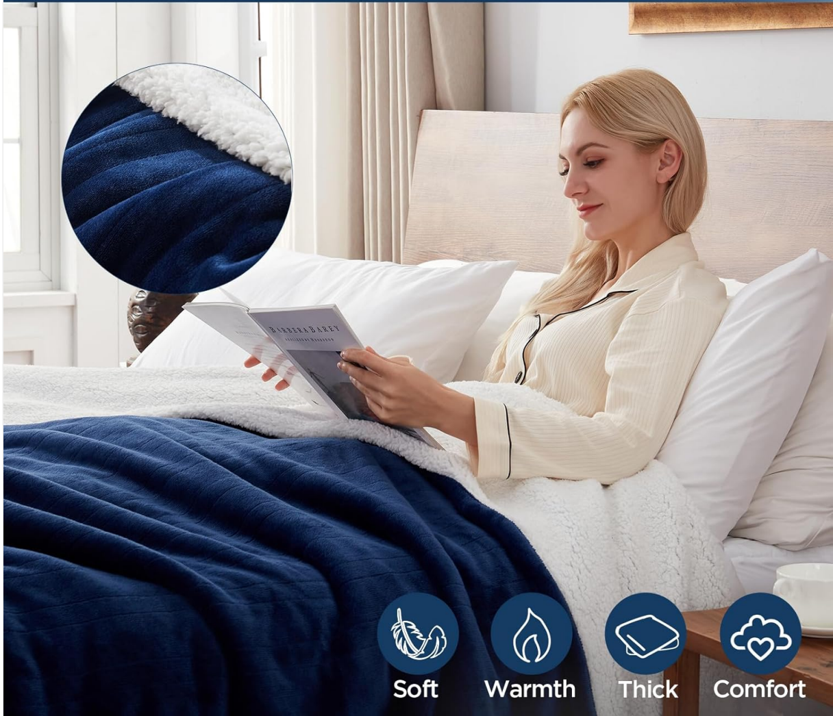
Image: The Westinghouse Electric Blanket features a soft flannel side and a cozy sherpa side, providing comfort and warmth.