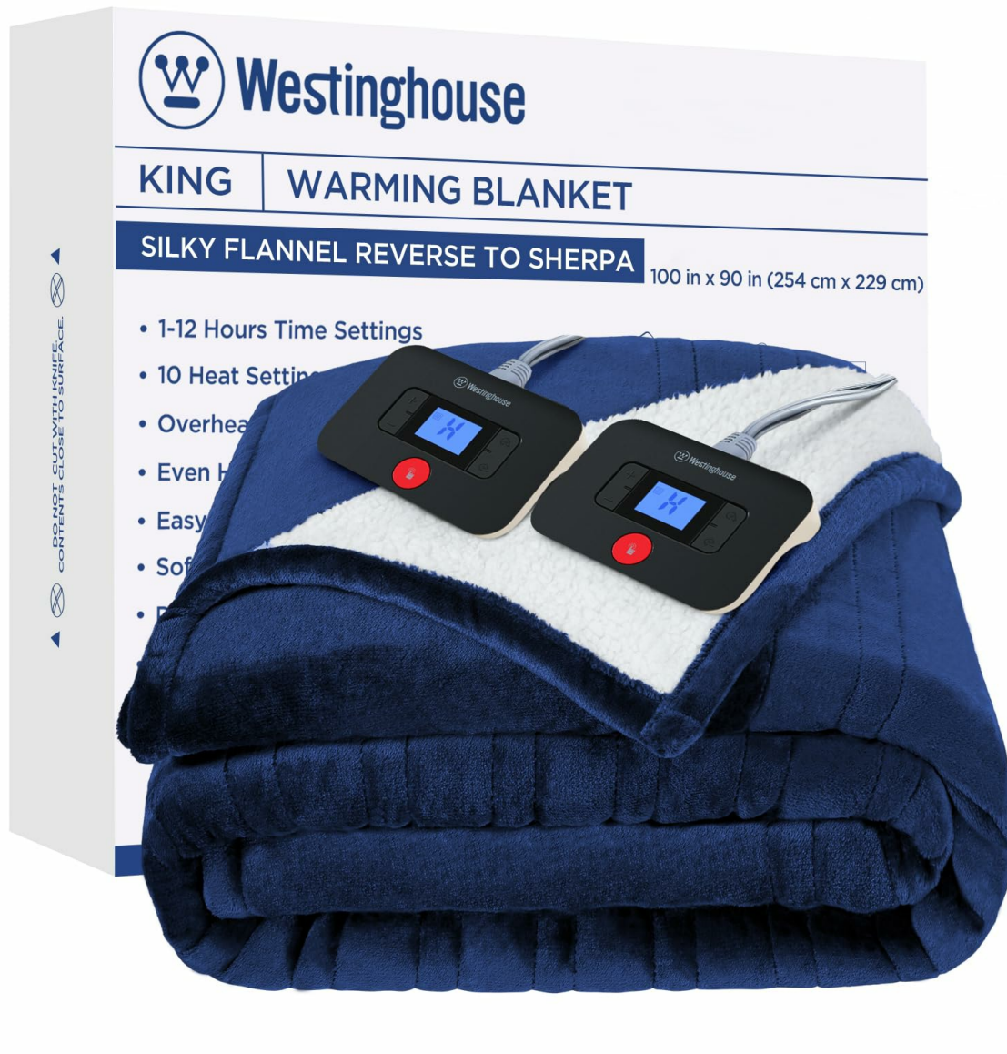
Image: The Westinghouse Electric Blanket King size, ready for use on a bed.