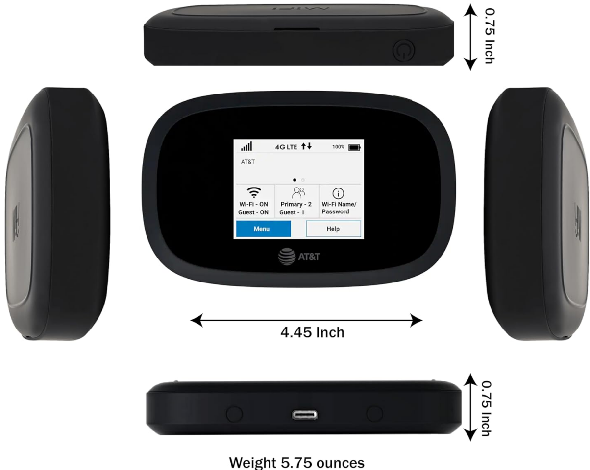
Image: Dimensions of the MiFi 8000 device.