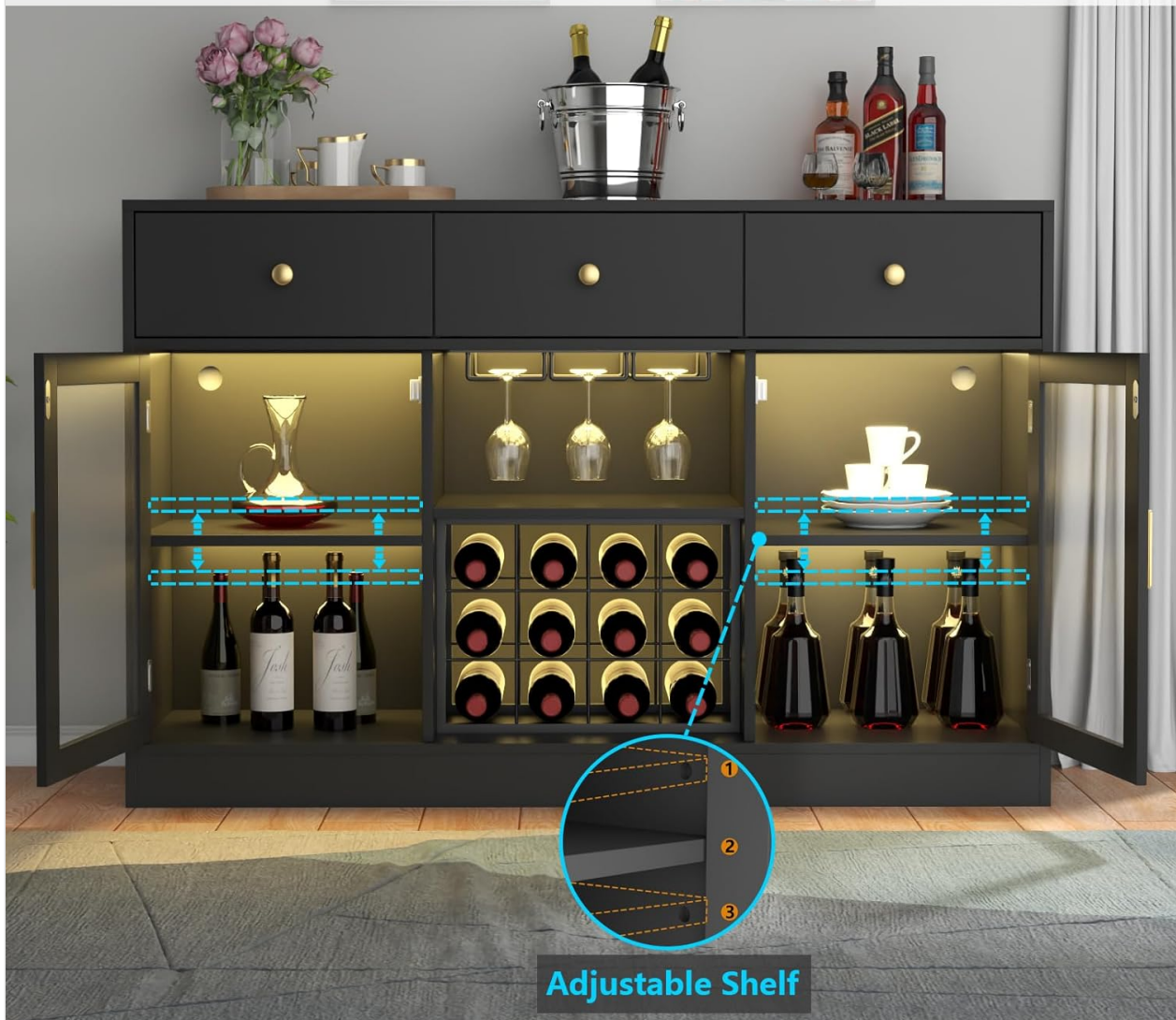
Image: The Auromie Wine Bar Cabinet showcasing its built-in colorful RGB LED lights.

Adjust the height or remove according to your needs