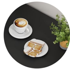
Storage Top Area