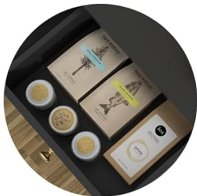
3 Storage Drawers