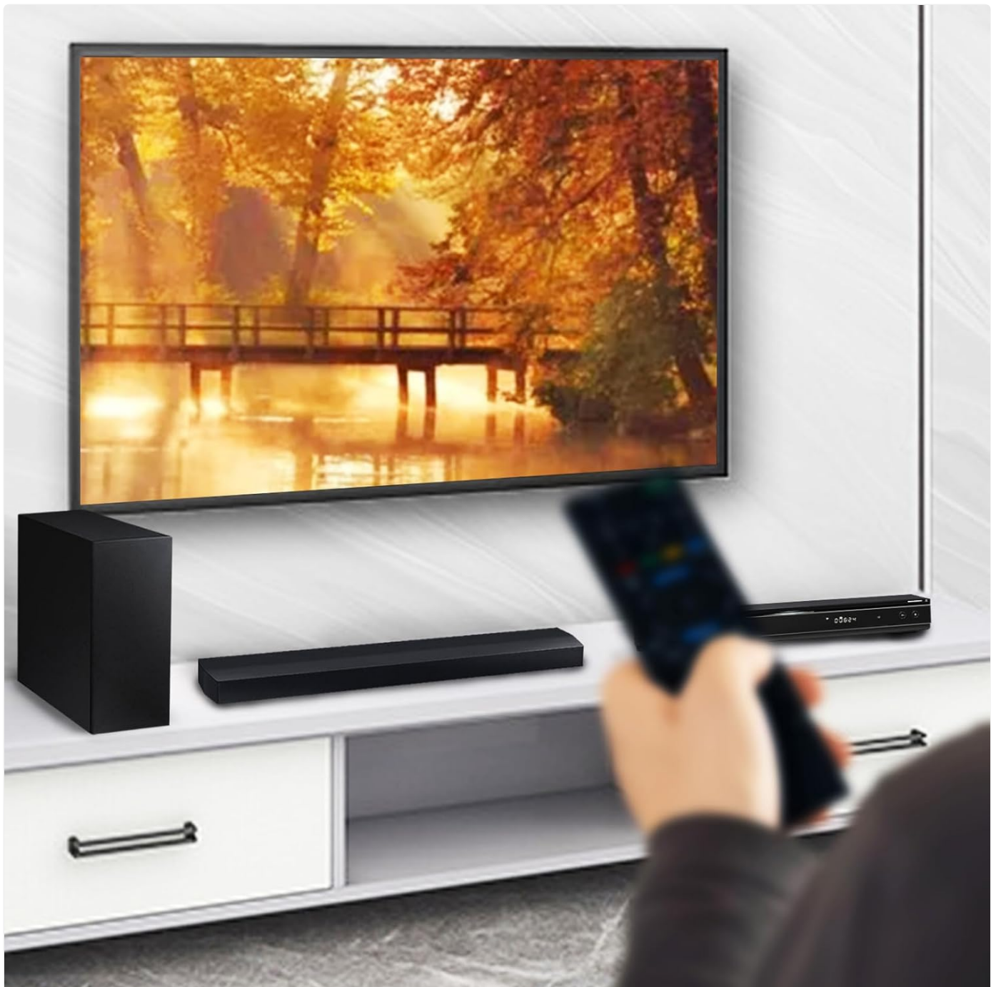
Figure 3: A person holding the remote control, pointing it towards a television setup, demonstrating typical usage. This illustrates the remote's intended application in a home entertainment environment.

Examples of voice commands include: "Open Netflix," "Search for action movies," "Change to channel 5," "What's the weather?"