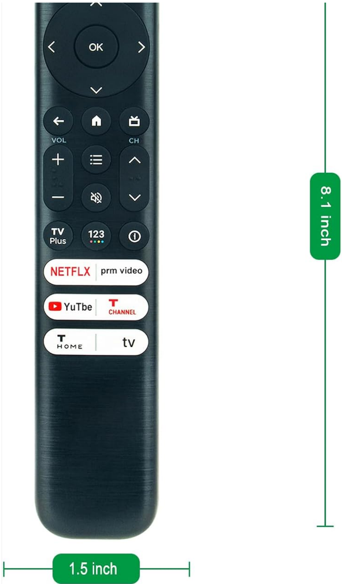
Figure 4: The ECONTROLLY remote control shown with its approximate dimensions (8.1 inches length, 1.5 inches width) indicated by