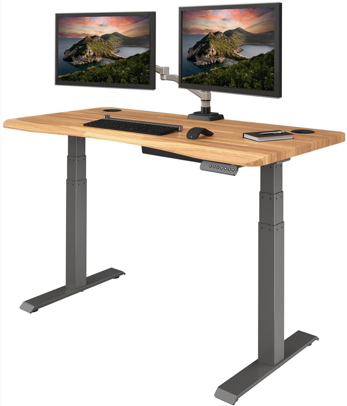
Image: The Vari Ergo 54x26 Electric Standing Desk, featuring a butcher block top and slate-colored legs, set up with dual monitors, keyboard, and mouse.