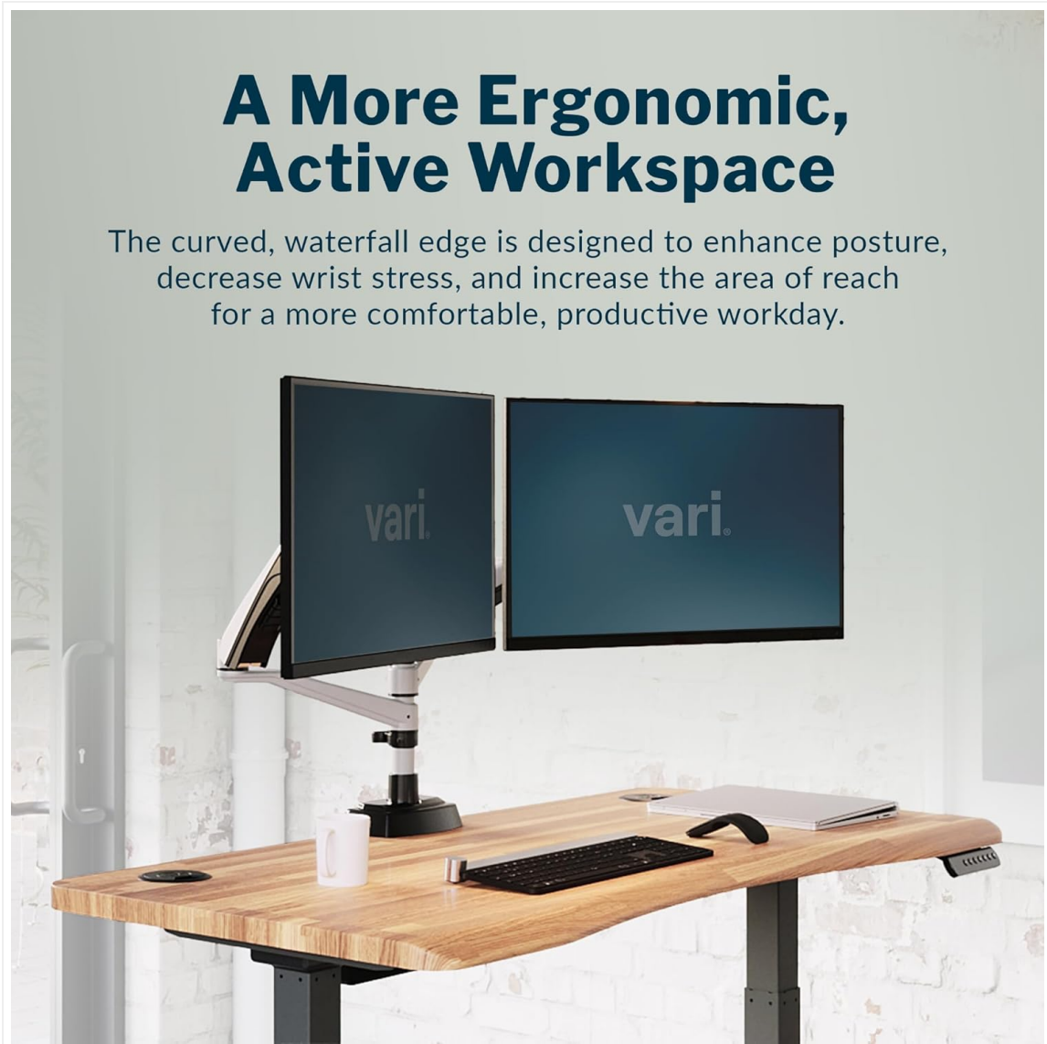
Image: The Vari Ergo desk showcasing its curved, waterfall edge, designed for enhanced comfort and reduced wrist stress.