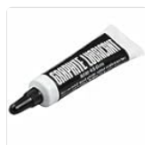
Image: A small tube of graphite lubricant, recommended for maintaining lock mechanisms.