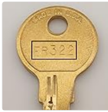
Image: A close-up of a key blade showing a stamped code, such as "FR322". Your key will have a similar code. Common locations to find your lock code include: