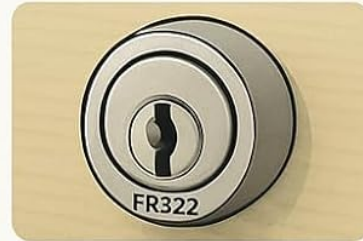
On the Lock Face