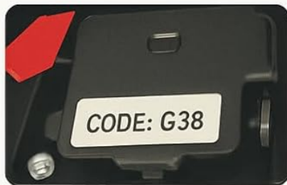
On a Label Inside/ Behind the Lock