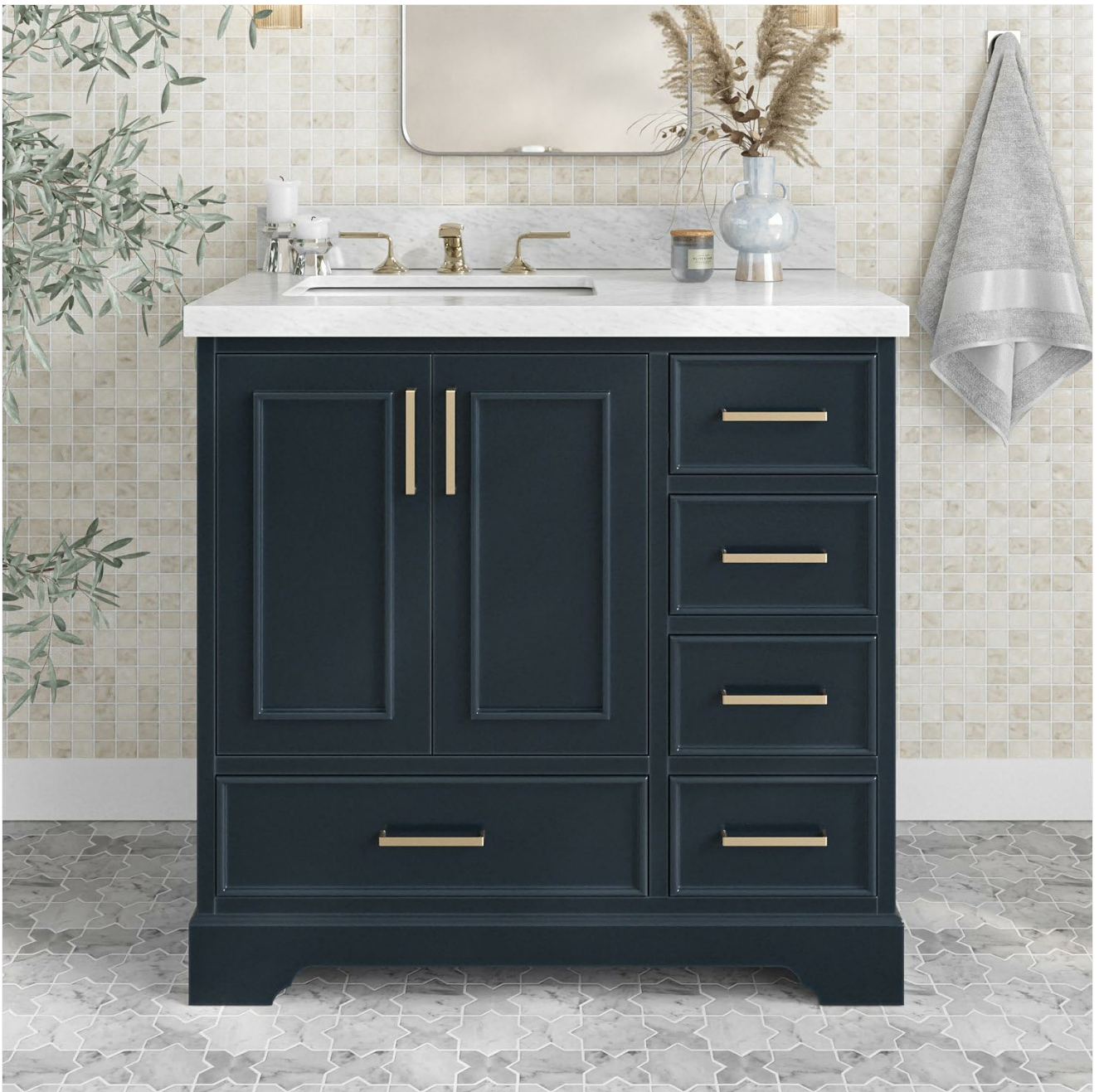
Image: The ARIEL Stafford 36-inch Bathroom Vanity in Midnight Blue with a white marble countertop and gold-toned hardware.