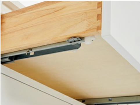
Soft-Closing Doors and Drawers