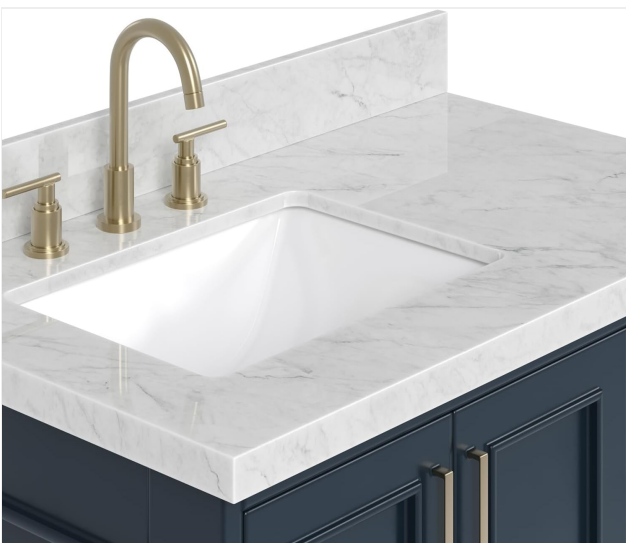
Italian Carrara Marble Countertop