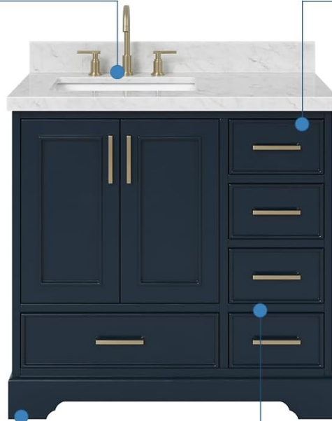
Image: An illustration highlighting the easy installation features of the vanity, including pre-drilled faucet holes, pre-assembled cabinet, hidden leveling feet, and an open back for plumbing.

Easy access in back for plumbing installation