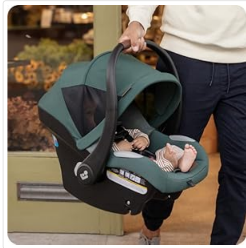
Figure 5.1: The ergonomic handle facilitates comfortable carrying.