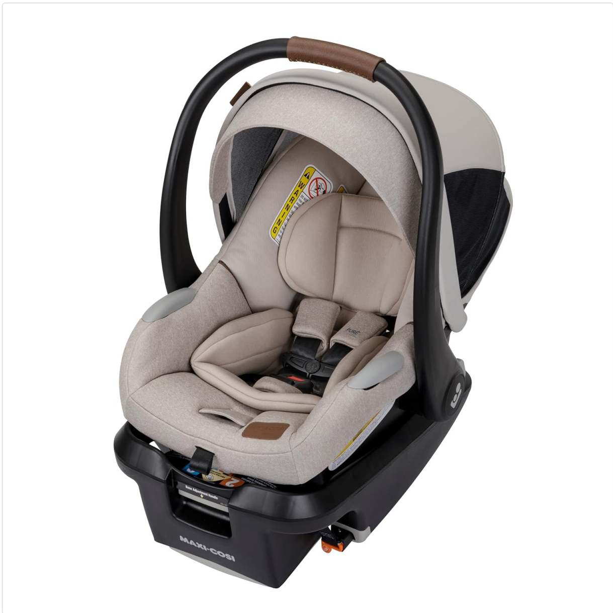
Figure 2.1: Maxi-Cosi Mico Luxe+ Infant Car Seat with its base.