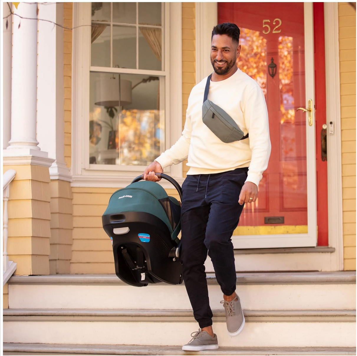
Figure 4.1: Plush cushioning and removable infant inserts for support.