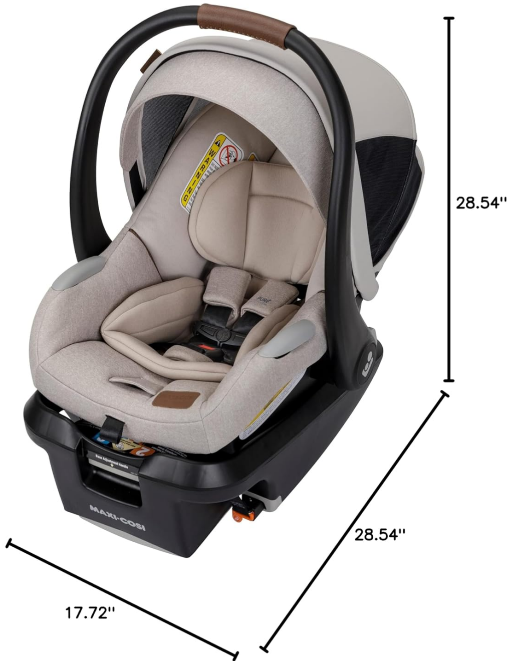
Figure 8.1: Product dimensions of the Mico Luxe+ Infant Car Seat.