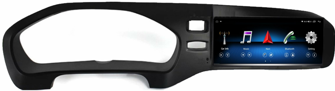
Image 2.1: Compatibility check. The system is compatible with vehicles that have the globe button (left, indicated by green checkmark) and not compatible with vehicles missing this button (right, indicated by red cross). The bottom image shows the system installed in a compatible Volvo V40 dashboard.