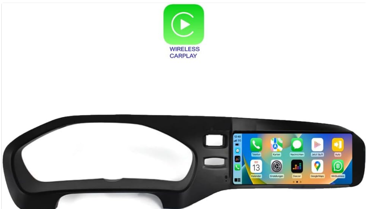
Image 5.1: Wireless CarPlay interface displaying common apps like Phone, Maps, Messages, and Music.

The unit features integrated Wireless CarPlay and Android Auto functionality, eliminating the need for additional adapters. Connect your compatible smartphone wirelessly to access navigation, music, messages, and more directly on the 8.8-inch display.