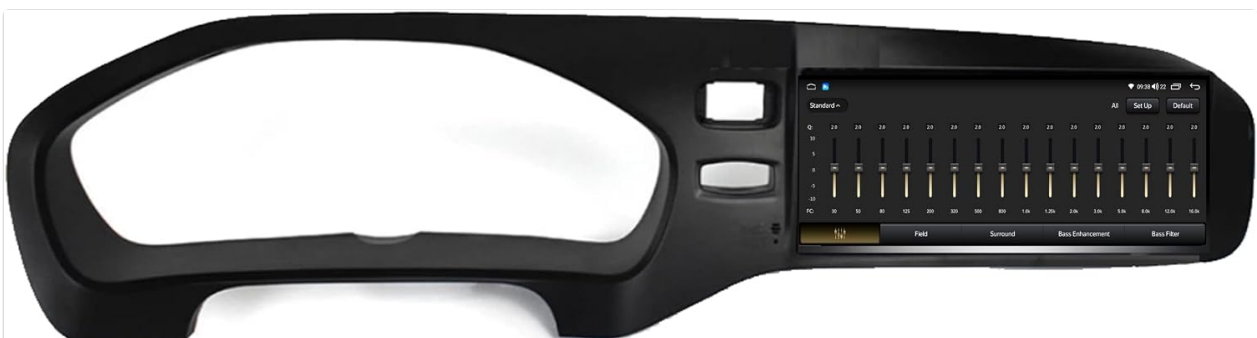
Image 5.3: Audio equalizer settings, allowing fine-tuning of sound output.

Customize your audio experience using the built-in equalizer. Adjust frequency bands, field, surround, bass enhancement, and bass filter settings to your preference.