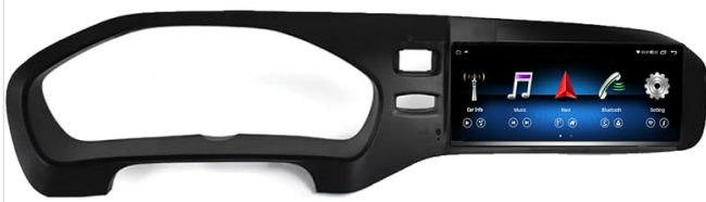
Android Multimedia System