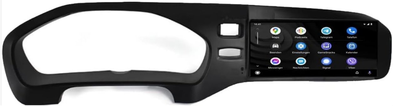
Image 5.2: Android Auto interface showing various applications such as Maps, Podcasts, and Messenger.