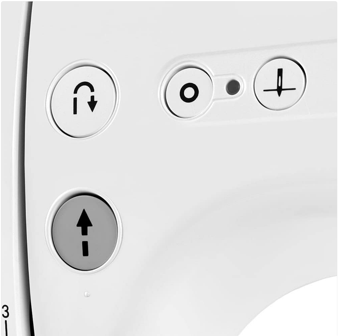
Image: A close-up of the machine's control buttons, including the needle up/down, reverse, and tie-off stitch buttons.