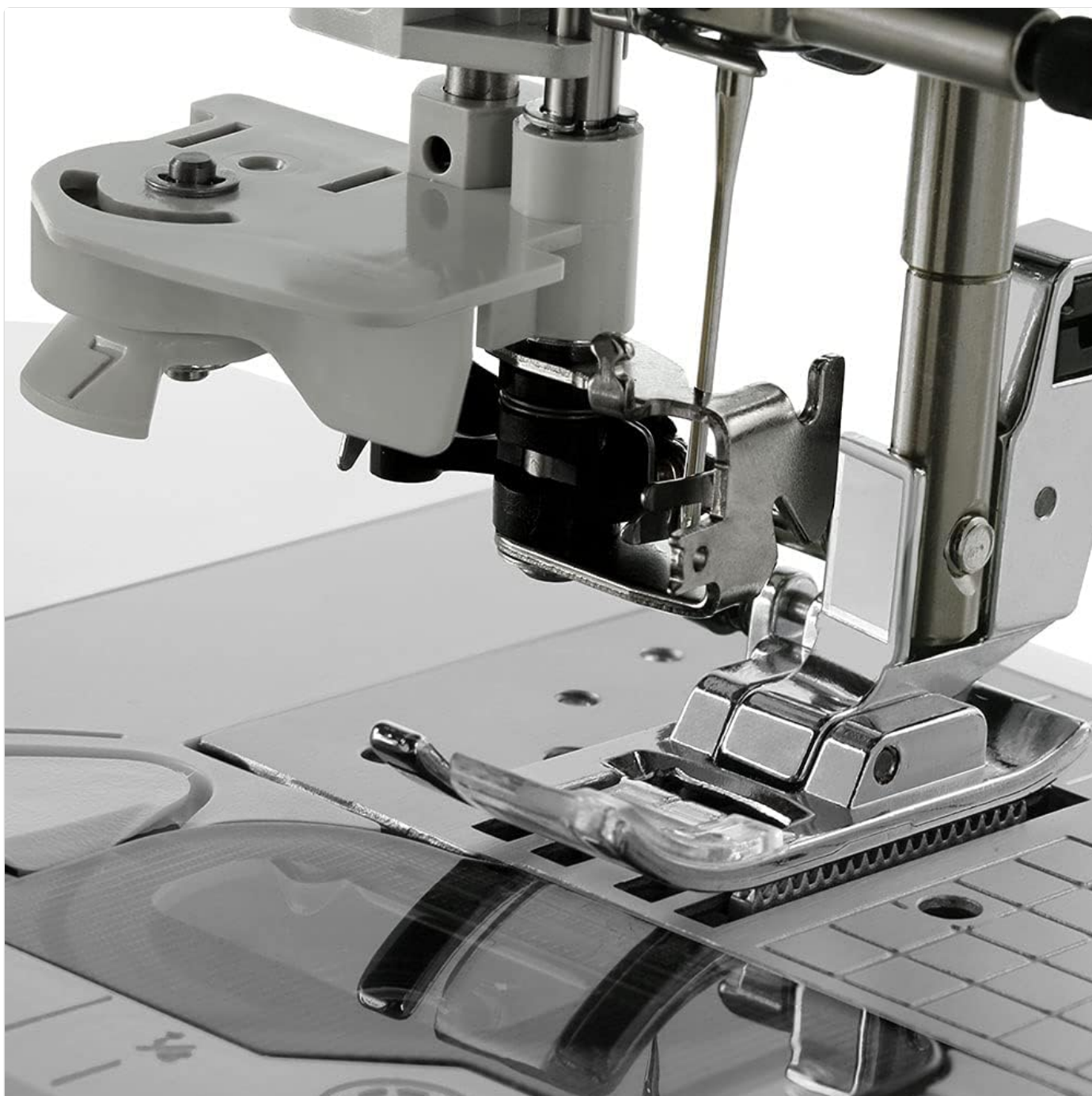
Image: A detailed view of the needle, presser foot, and threading path, illuminated by the LED light.