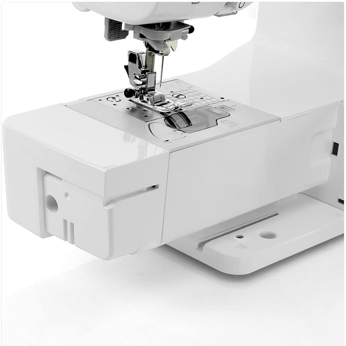
Image: The sewing machine with its accessory storage box detached, revealing the free arm for circular sewing.