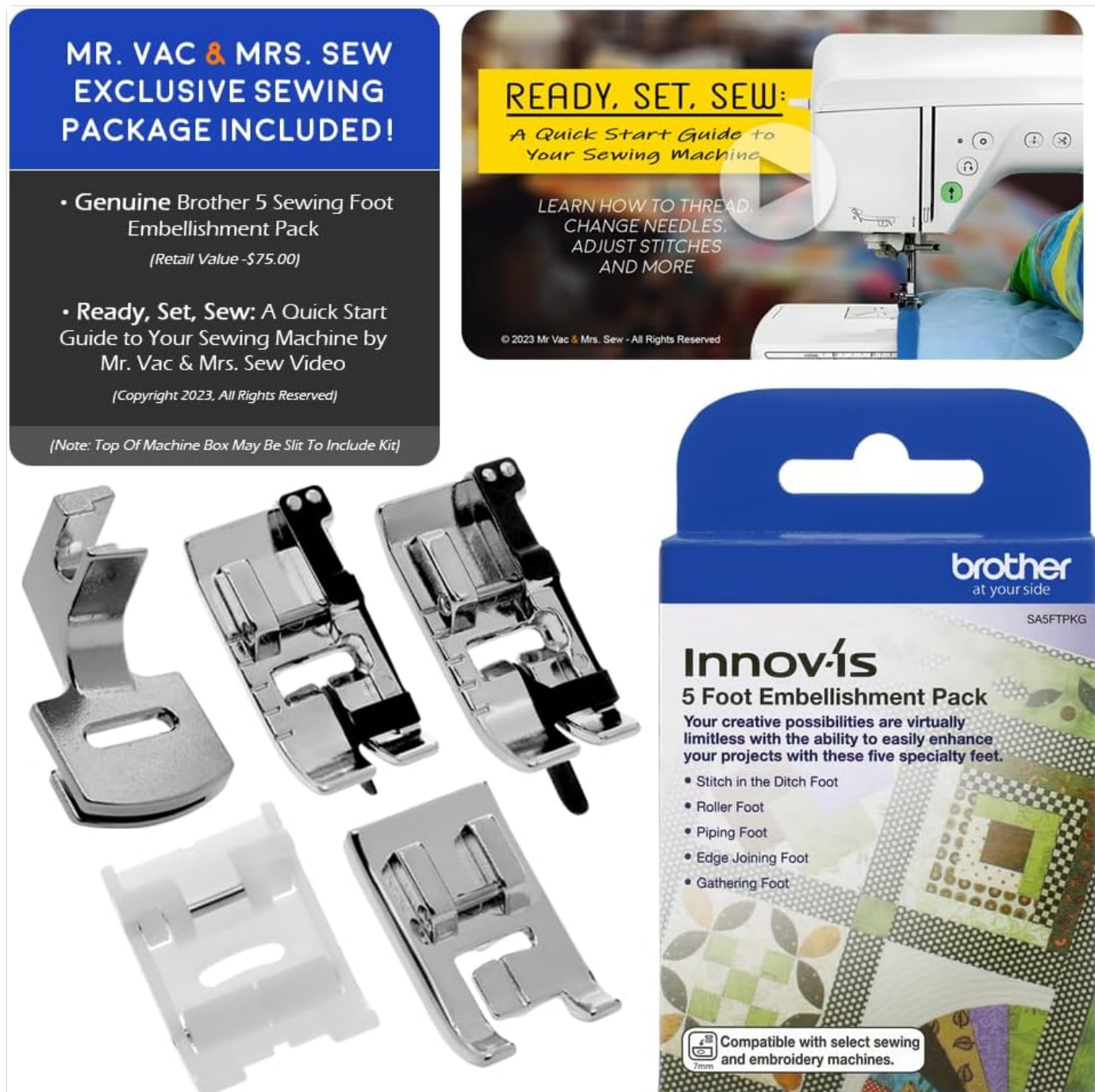
Image: A close-up view of the included Brother 5 Foot Embellishment Pack and the "Ready, Set, Sew" video guide.

Your Brother Innov-is NS80E comes with a comprehensive set of accessories to get you started: