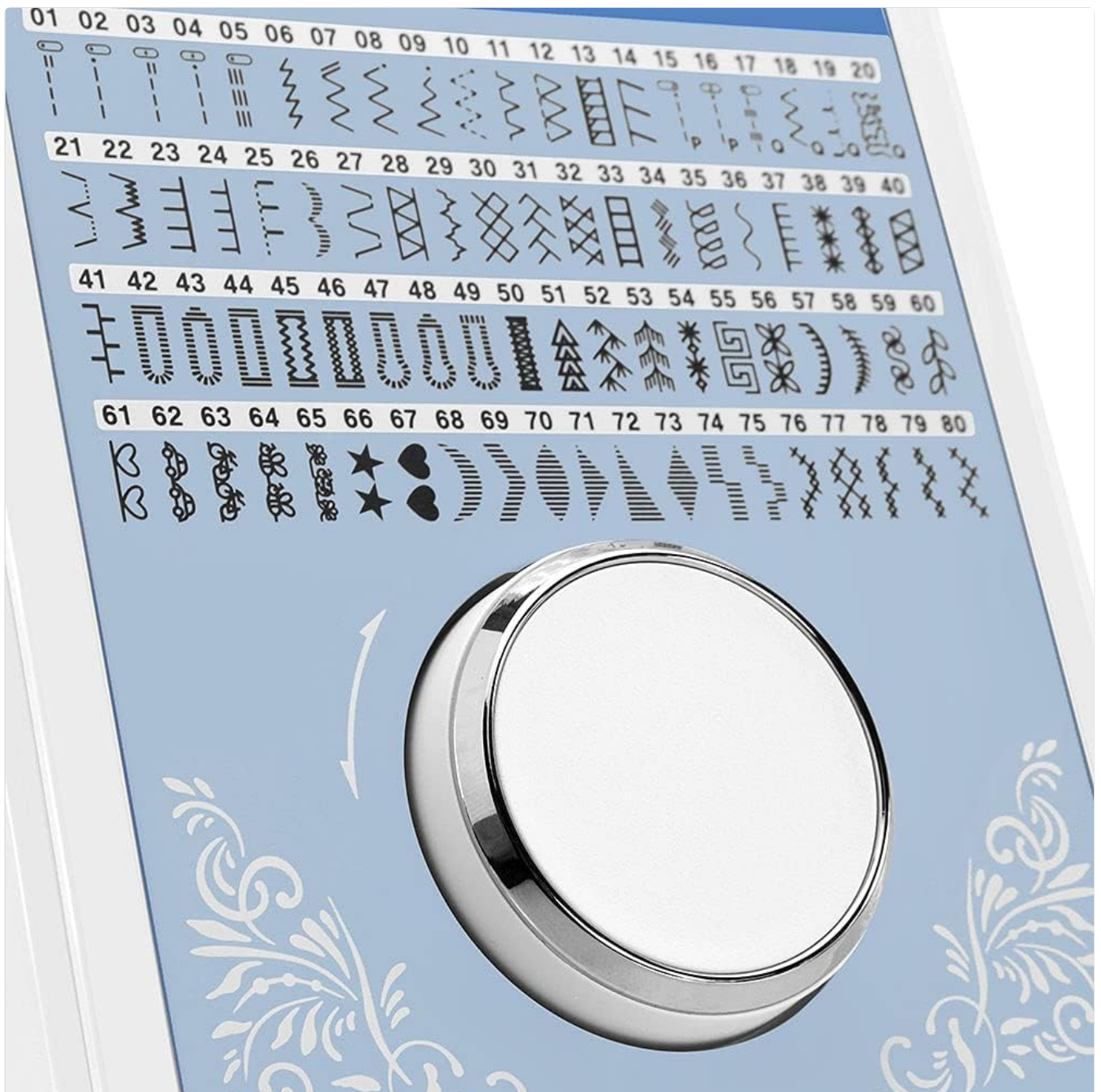
Image: The stitch selection dial with a portion of the stitch pattern plate visible, illustrating the variety of available stitches.