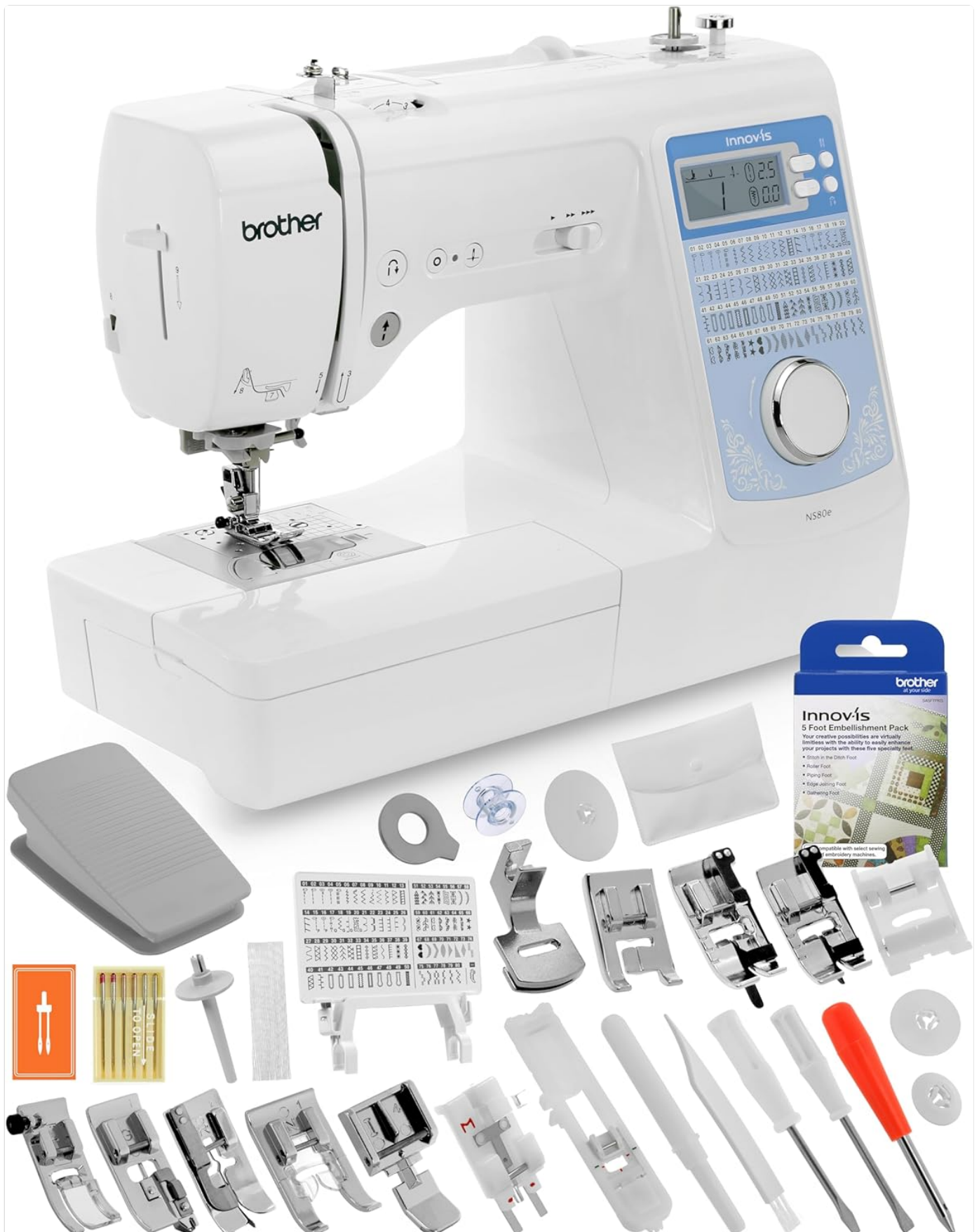
Image: The Brother Innov-is NS80E sewing machine displayed with its comprehensive starter package, including various presser feet, bobbins, and tools.