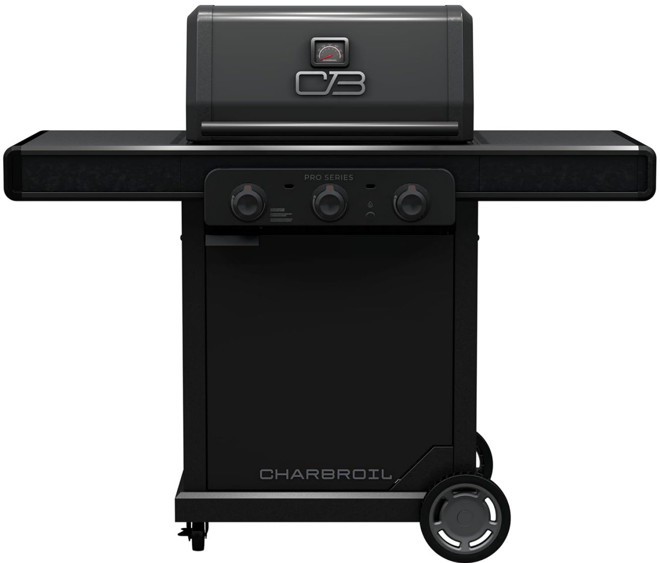
Front view of the Char-Broil Pro Series 3-Burner Gas Grill and Griddle Cabinet.