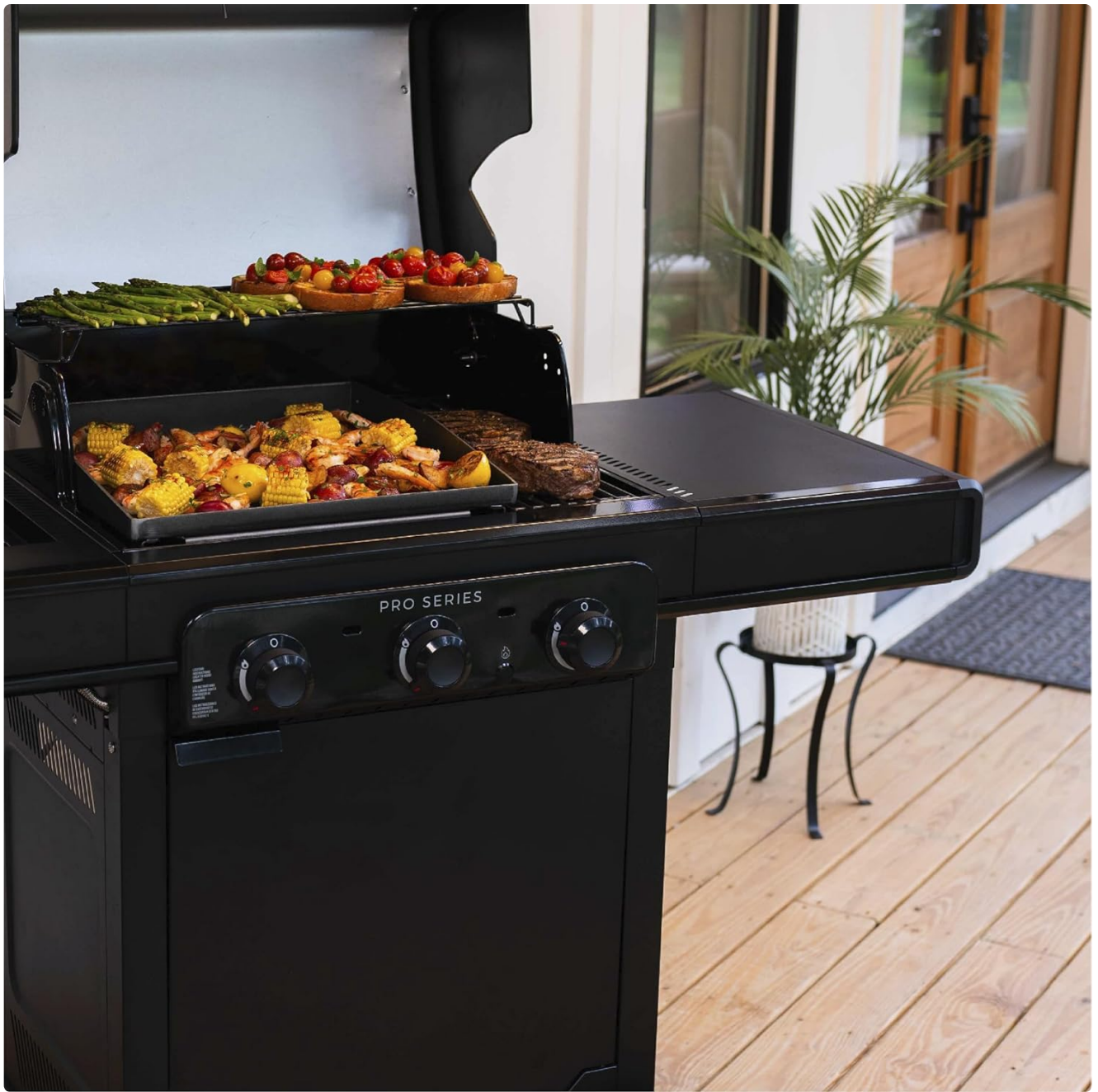
The modular system allows for simultaneous grilling and griddling.