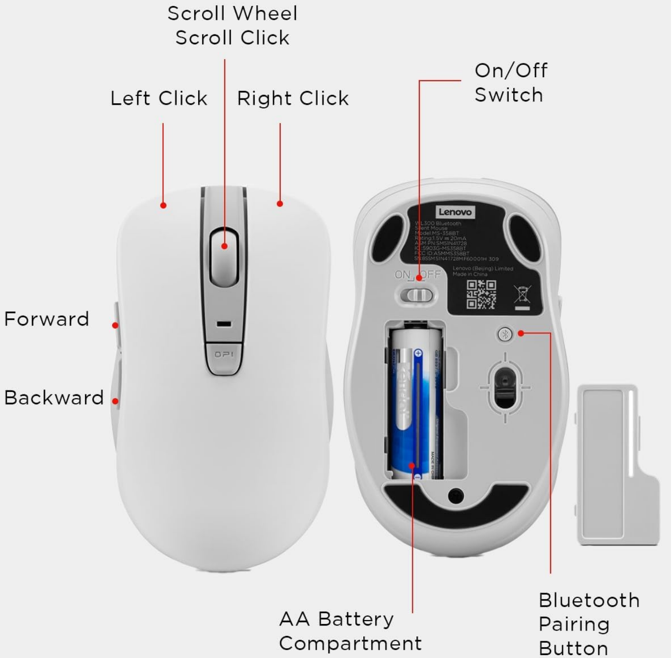
Image: Detailed view of the Lenovo WL300 mouse, labeling the Left Click, Right Click, Scroll Wheel, Scroll Click, Forward, Backward buttons, On/Off Switch, AA Battery Compartment, and Bluetooth Pairing Button.