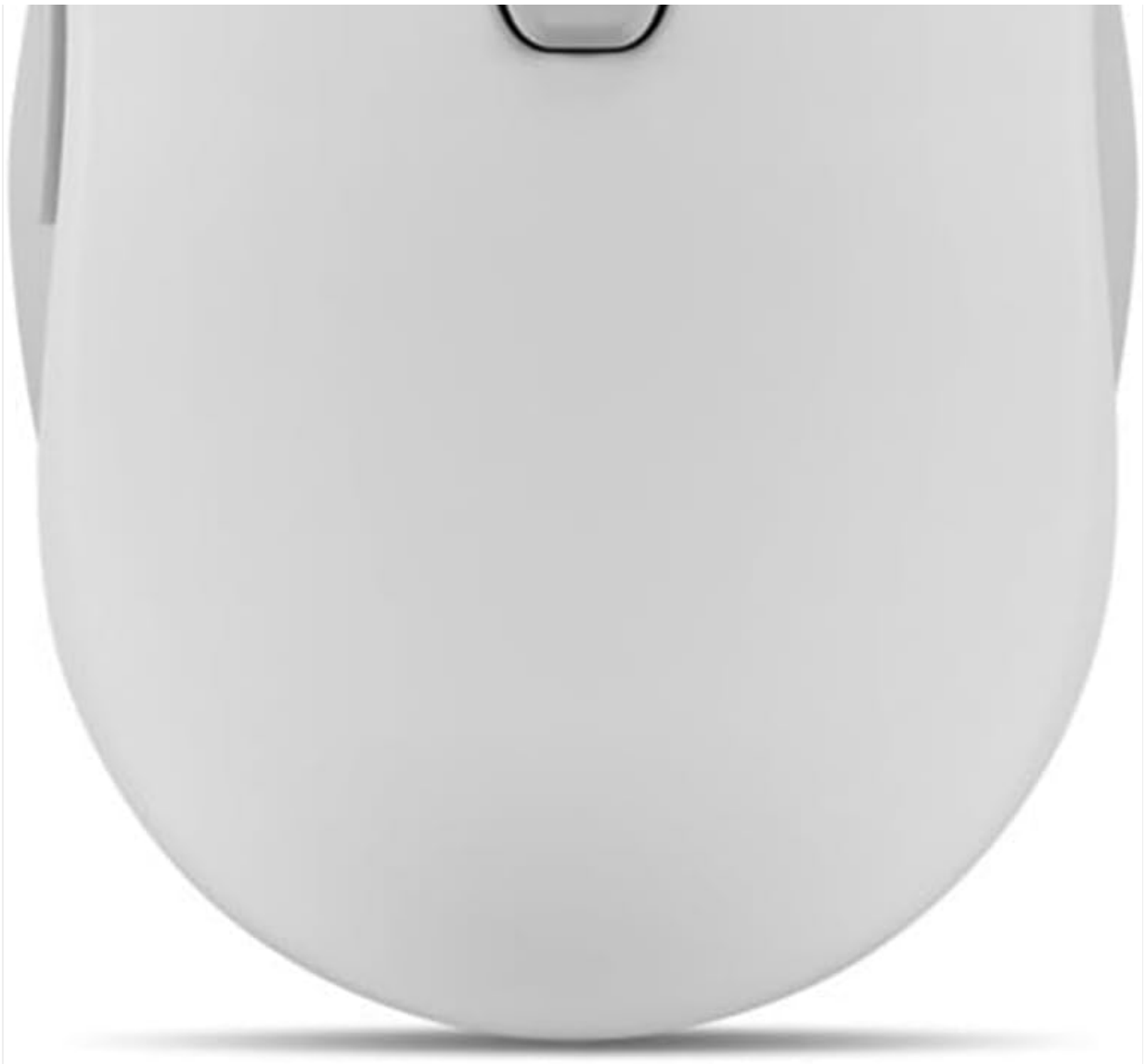
Image: Top view of the Lenovo WL300 Bluetooth Silent Mouse in white.