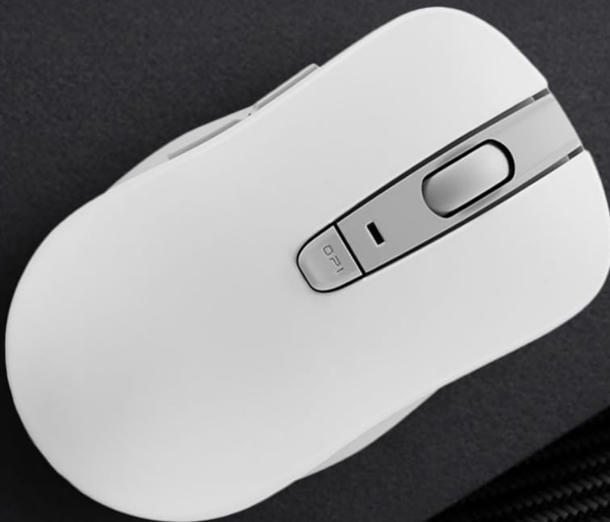
Image: The Lenovo WL300 mouse demonstrating its compatibility with multiple surfaces such as resin, leather, fabric, wood, and paper.