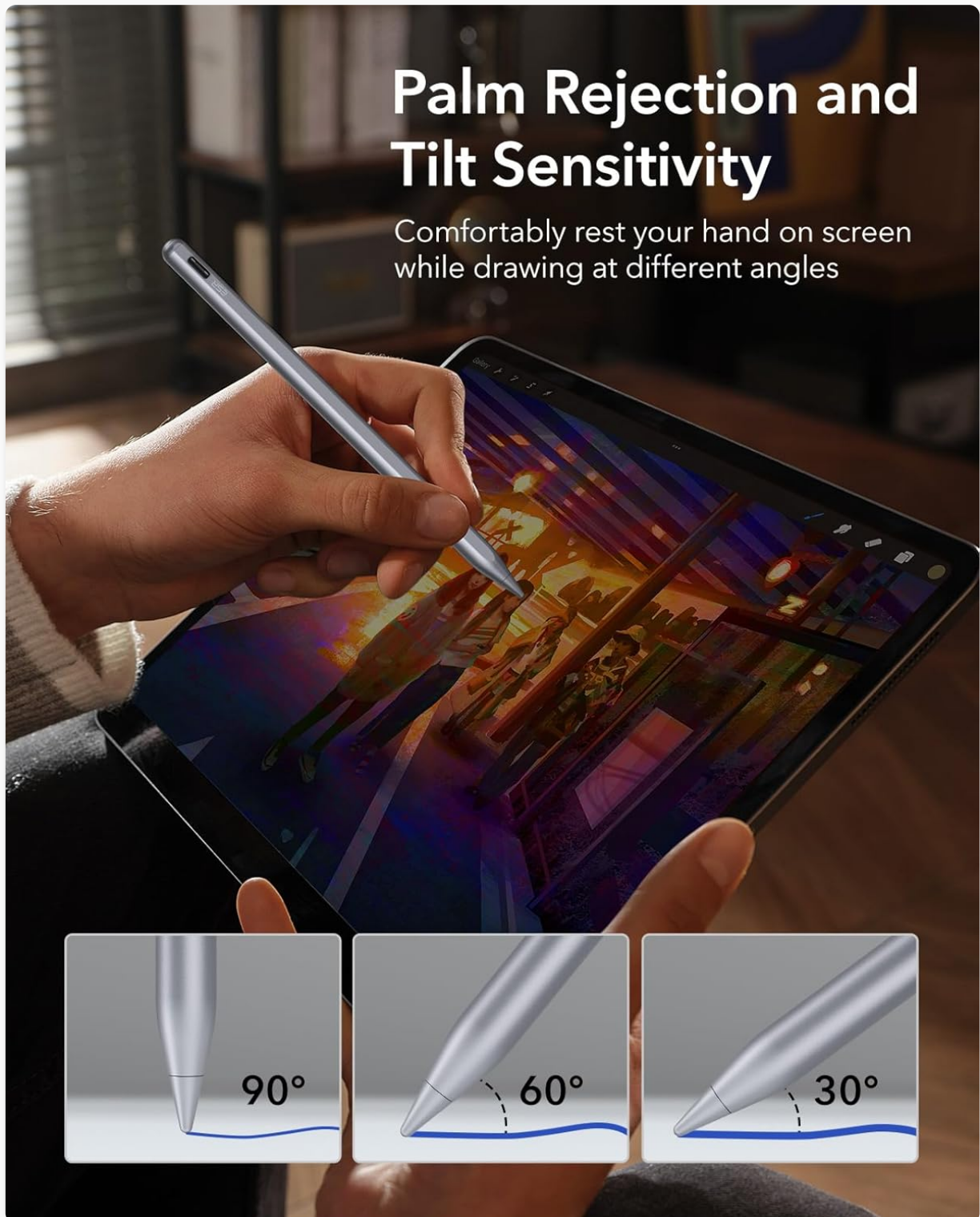
Image: A user demonstrating palm rejection and tilt sensitivity with the ESR Digital Pencil Pro on an iPad, showing different line thicknesses based on pen angle.