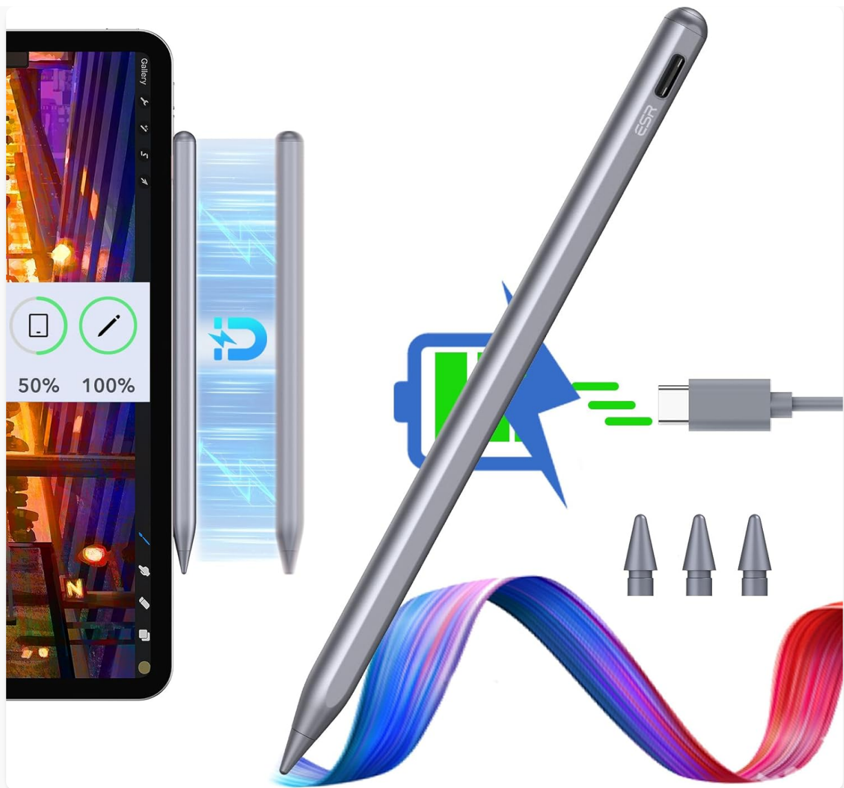
Image: The ESR Digital Pencil Pro, showcasing its magnetic attachment to an iPad, USB-C charging, and included replacement tips.