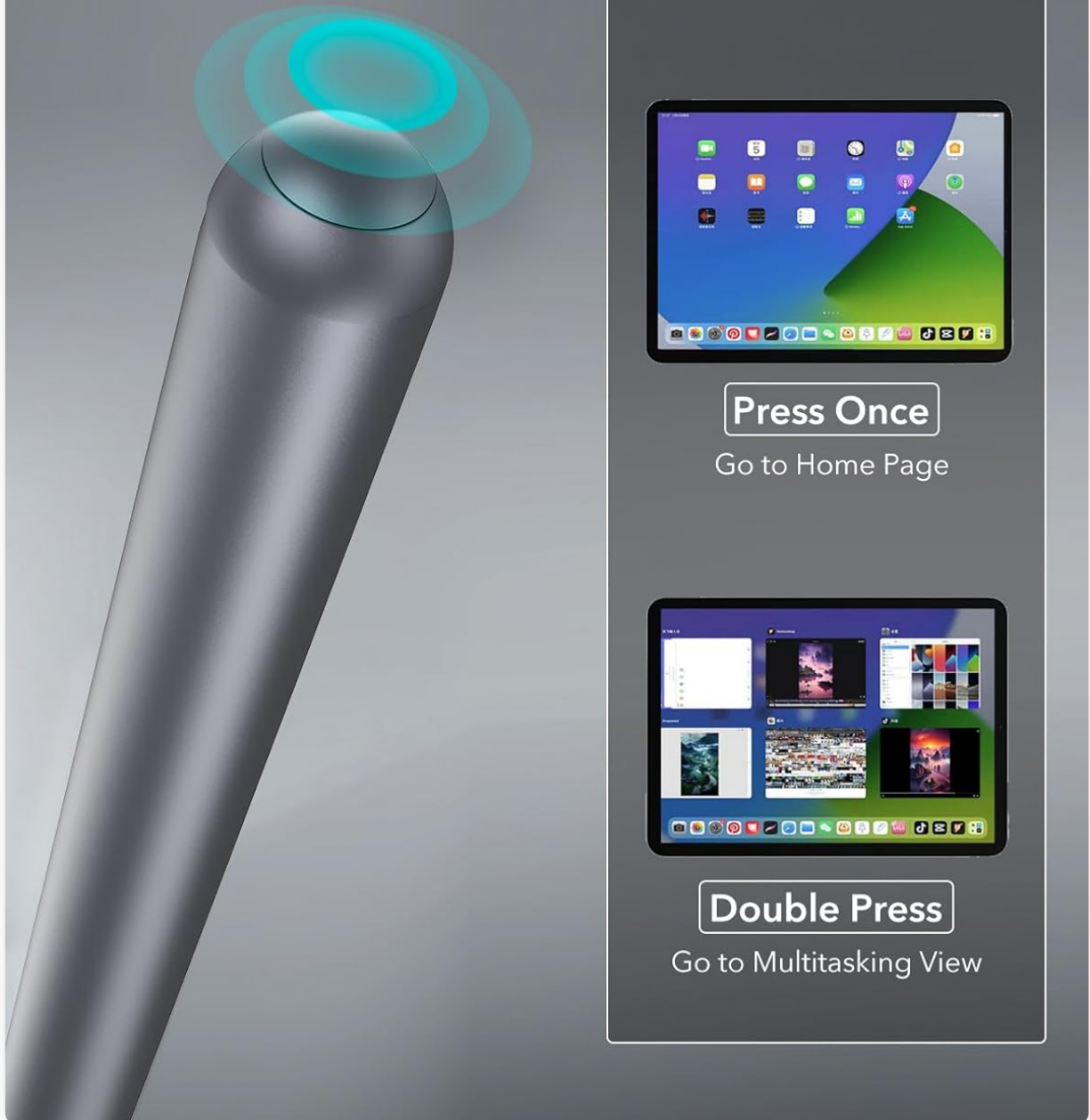
Image: Visual guide to the shortcut button on the ESR Digital Pencil Pro, illustrating its single-press and double-press functions for iPad navigation.