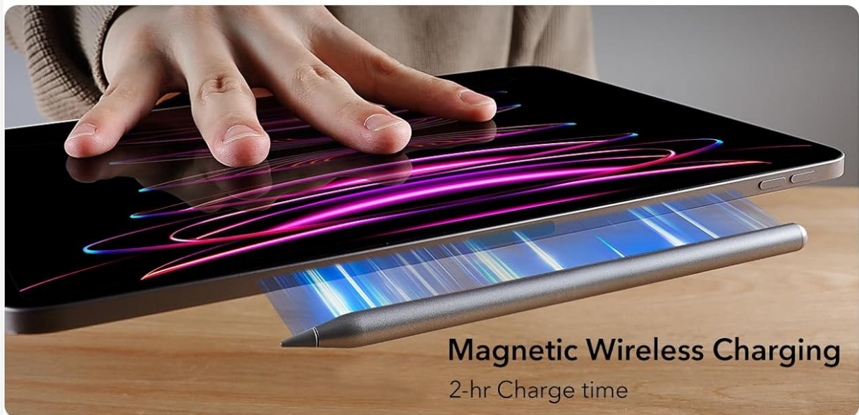
Magnetic Wireless Charging 2-hr Charge time