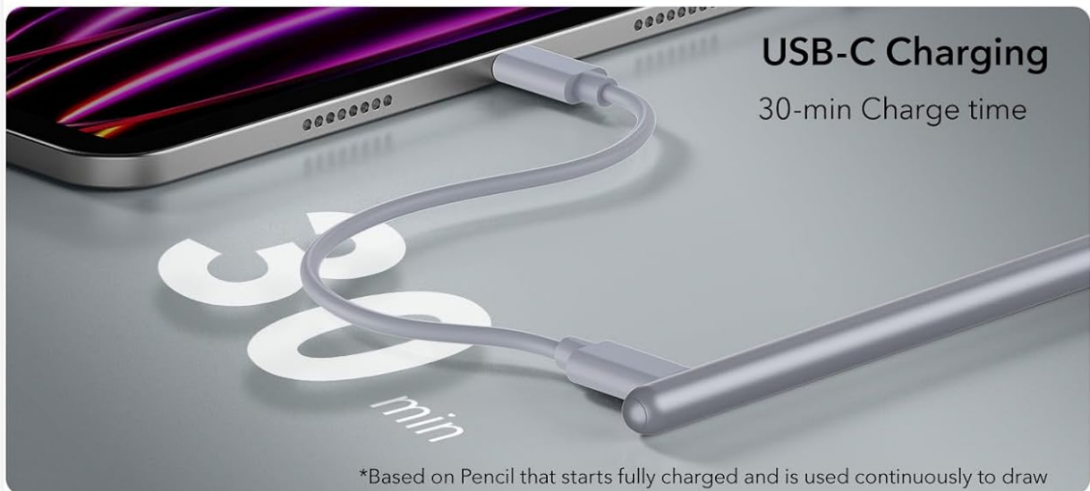
USB-C Charging 30-min Charge time

*Based on Pencil that starts fully charged and is used continuously to draw