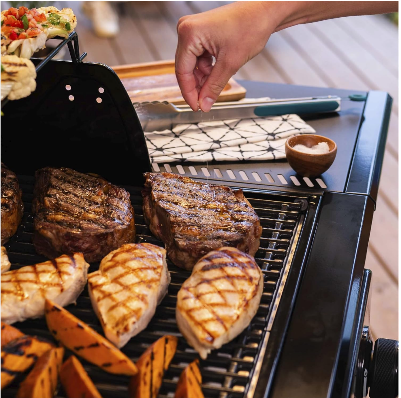
Figure 5: Grilling various meats on the primary cooking surface, showcasing the even heat distribution.