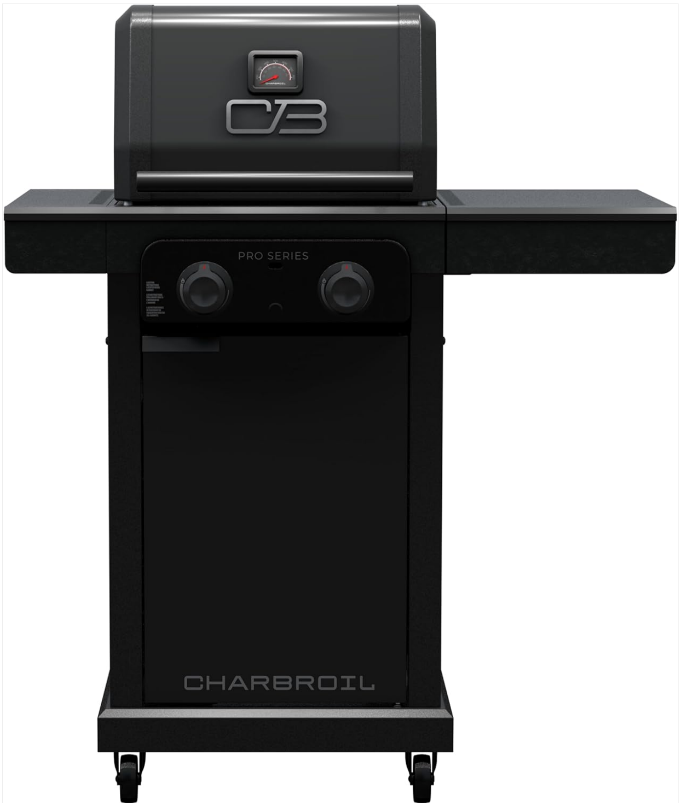
Figure 1: Front view of the Char-Broil Pro Series 2-Burner Gas Grill and Griddle.