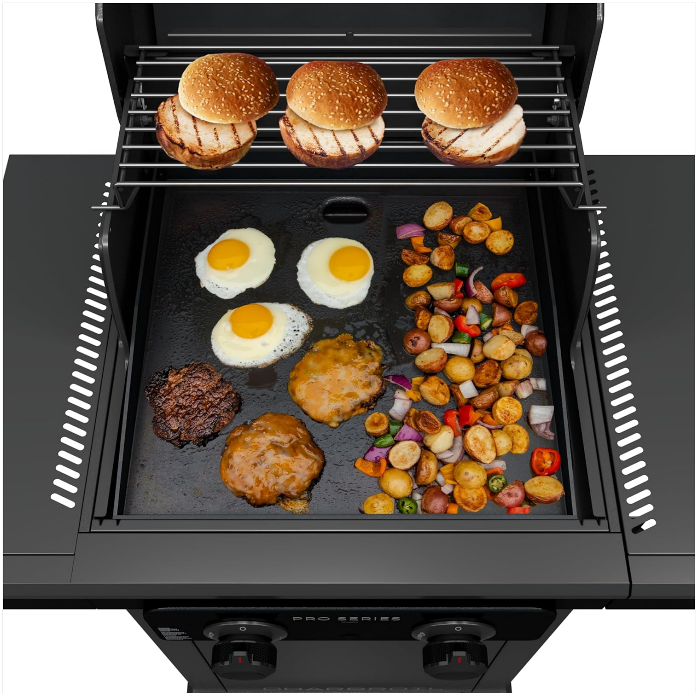
Figure 4: The griddle top in use, demonstrating its versatility for breakfast items.