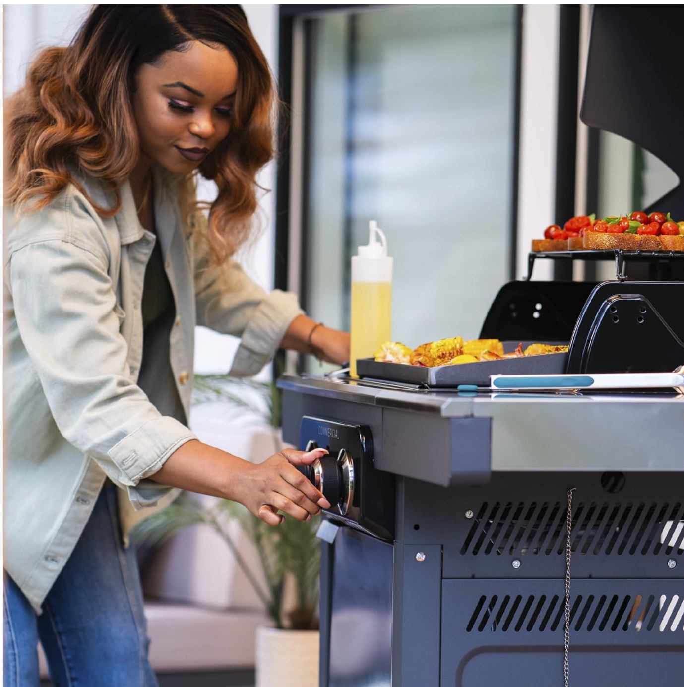
Figure 3: Adjusting the burner control knob for precise temperature control.

7. Close the lid to preheat the grill. The grill can reach 500°F in under 10 minutes.