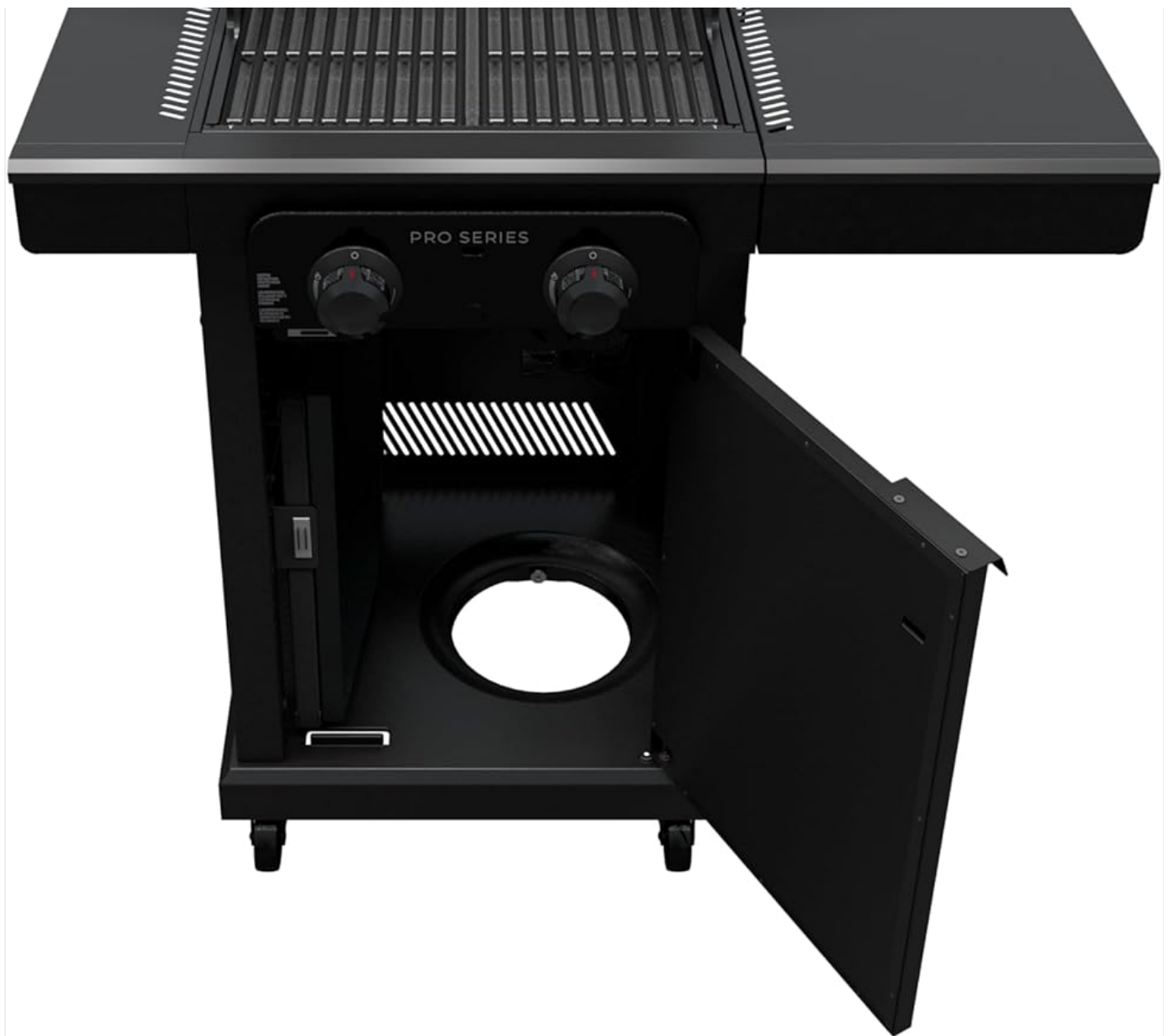
Figure 2: Side view of the grill, showing the cabinet and folding side shelf.