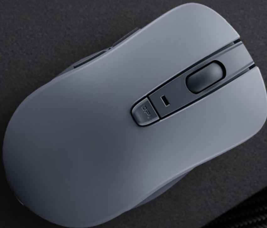
Image: Visual representation of the mouse's compatibility with multiple surfaces, including resin, leather, fabric, wood, and paper.