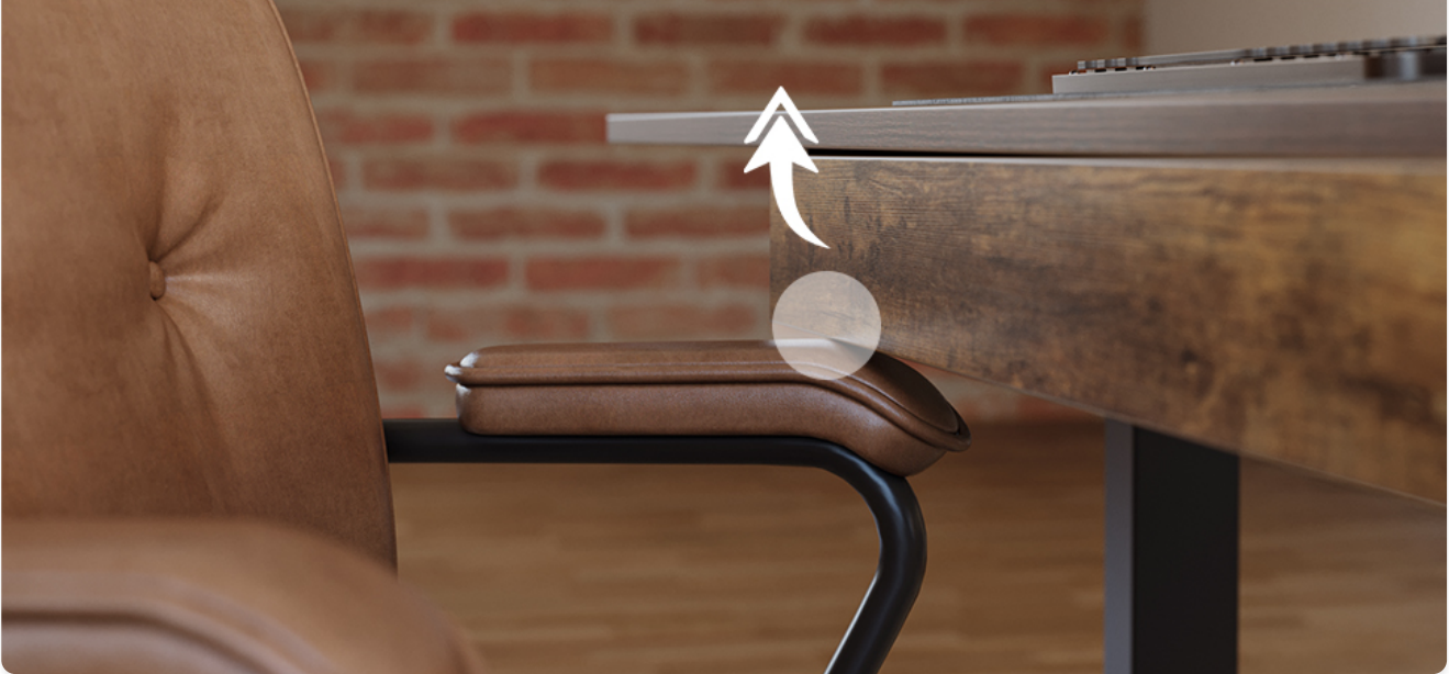
Figure 5: Auto-sensing anti-collision system protects your desk and surroundings.

Auto-sensing anti-collision system protects your desk