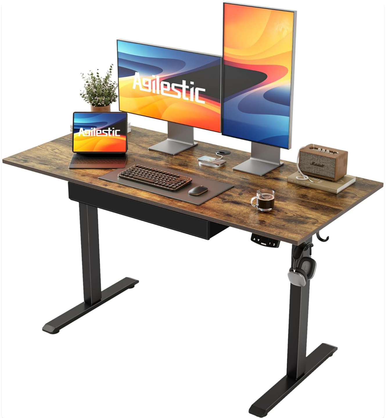
Figure 1: Agilestic Electric Standing Desk in a typical office setup.