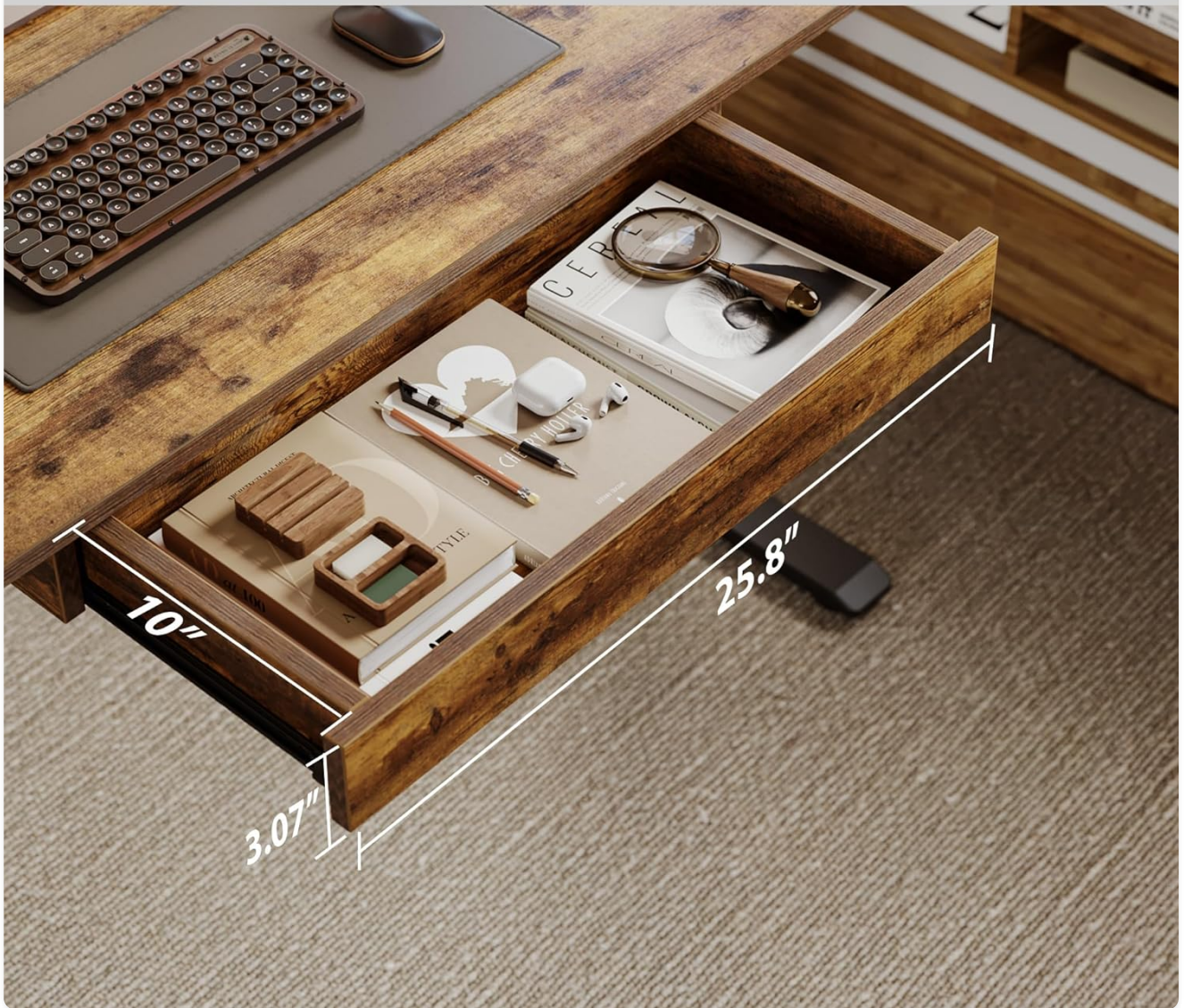
Figure 2: Detailed view of the classic wooden drawer, providing ample storage space.

Classic drawer design simply your work environment with spacious space