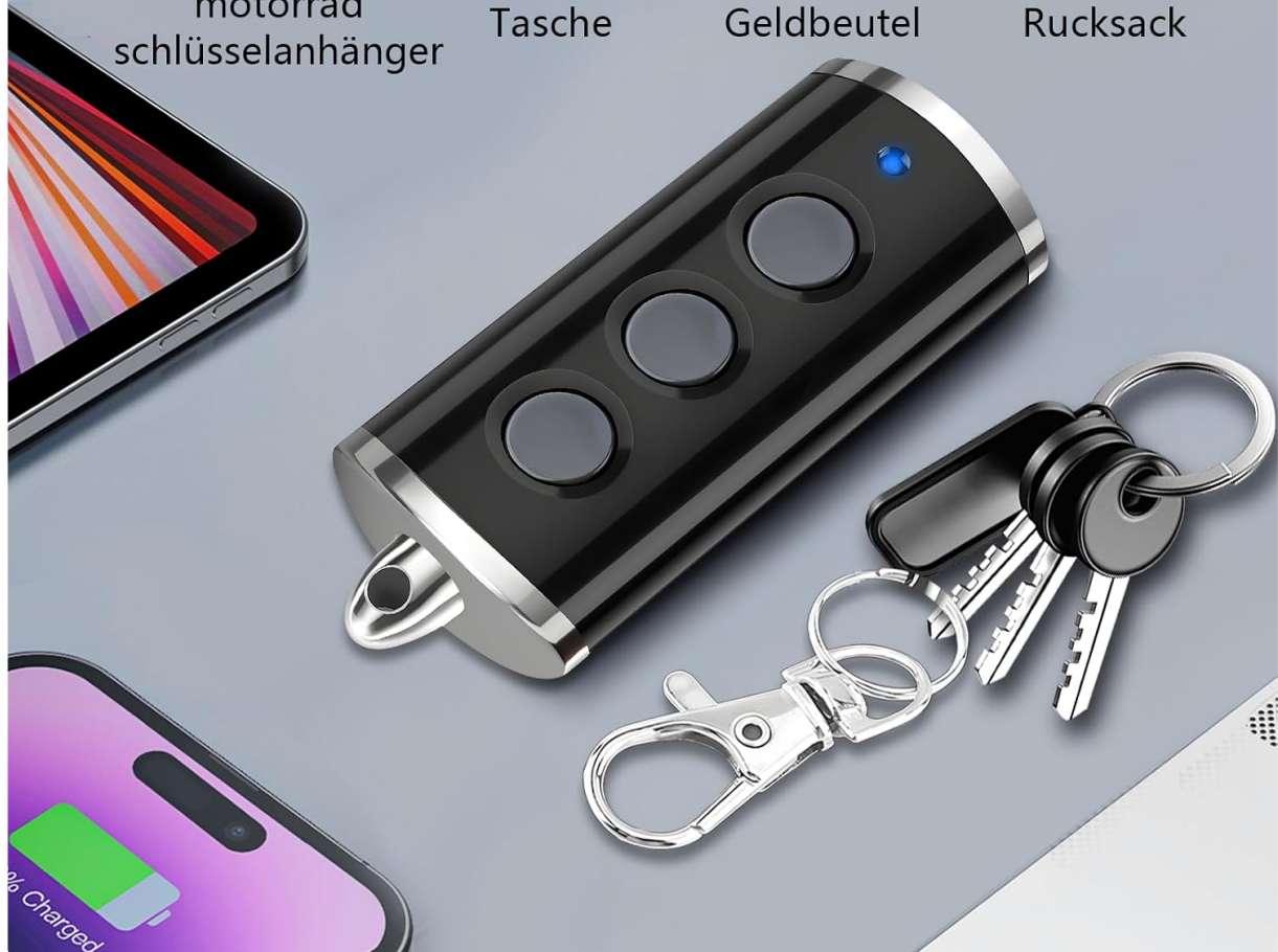
Image 4.1: Compact design of the remote control, suitable for keychains.