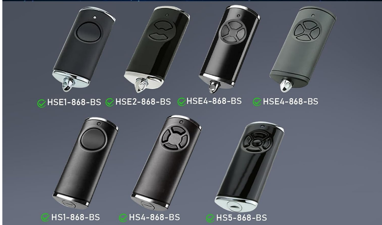
Image 2.1: Visual guide to compatible Hormann BS series remote controls.

HS1-868-BS, HS4-868-BS, HS5-868-BS, HSS4-868-BS, HSE1-868-BS, HSE2-868-BS, HSE4-868-BS, HSP4-868-BS, HSD2-868-BS