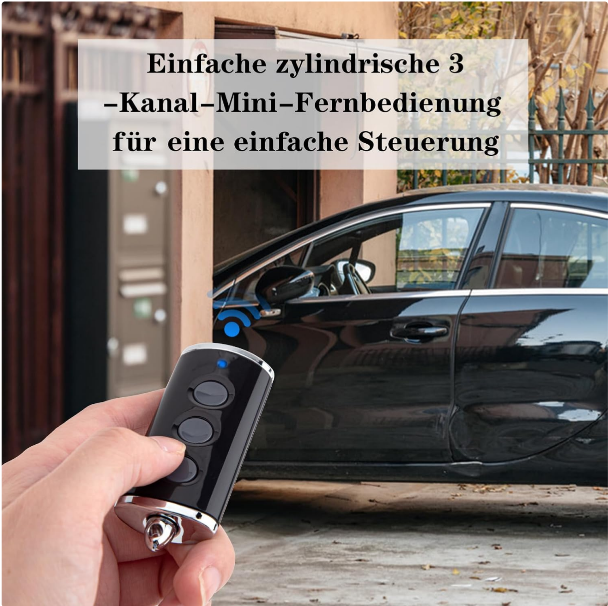
Image 6.1: Demonstrating the remote control in use with a garage door.