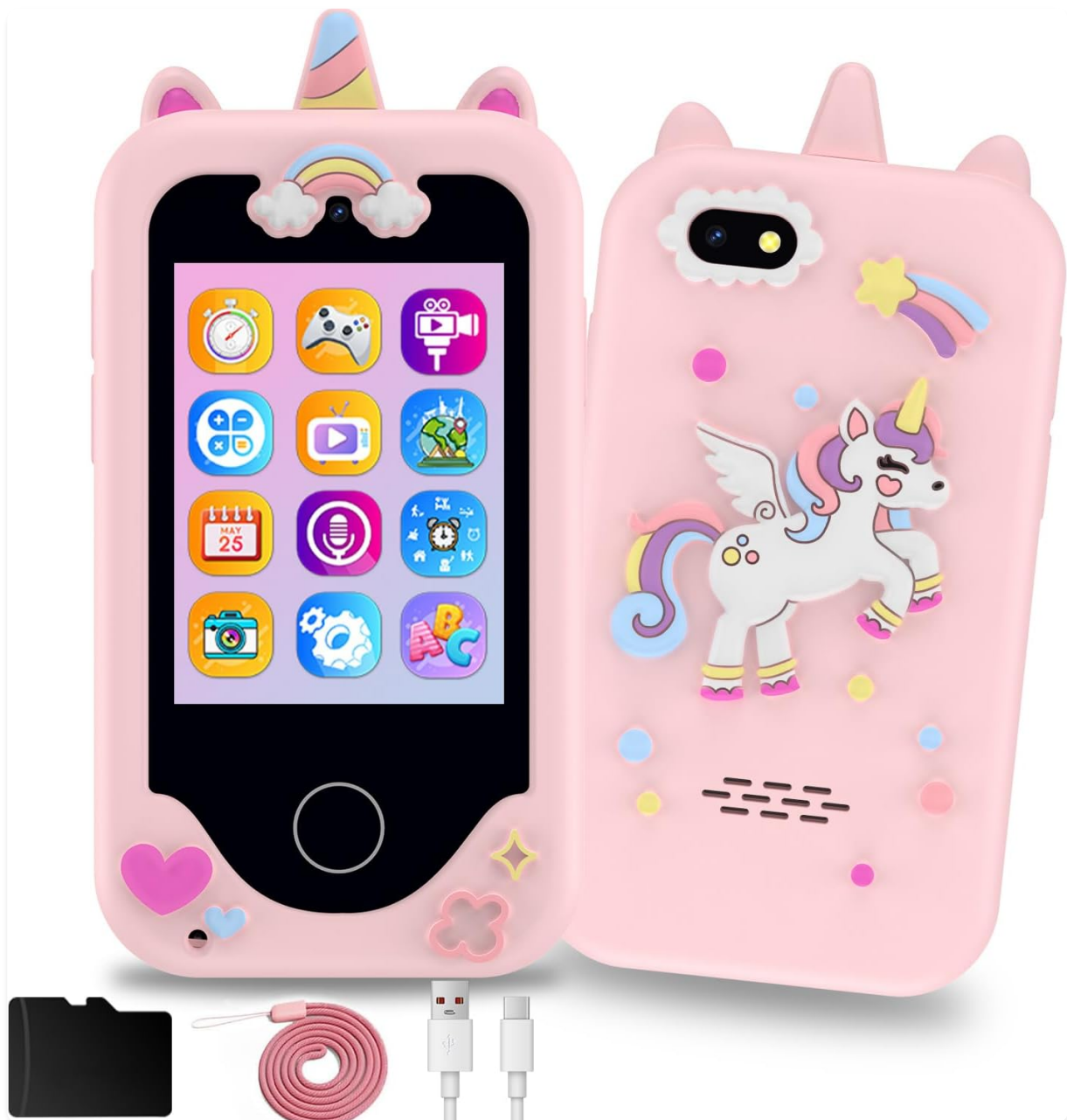
Image: KAKTIN Kids Phone with its unicorn case, charging cable, lanyard, and micro SD card.