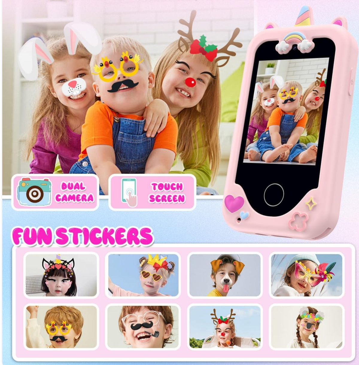
Image: Children interacting with the phone's camera feature, applying creative stickers to their photos.

FRONT AND REAR CAMERAS, SUPPORT FOR SELFIES