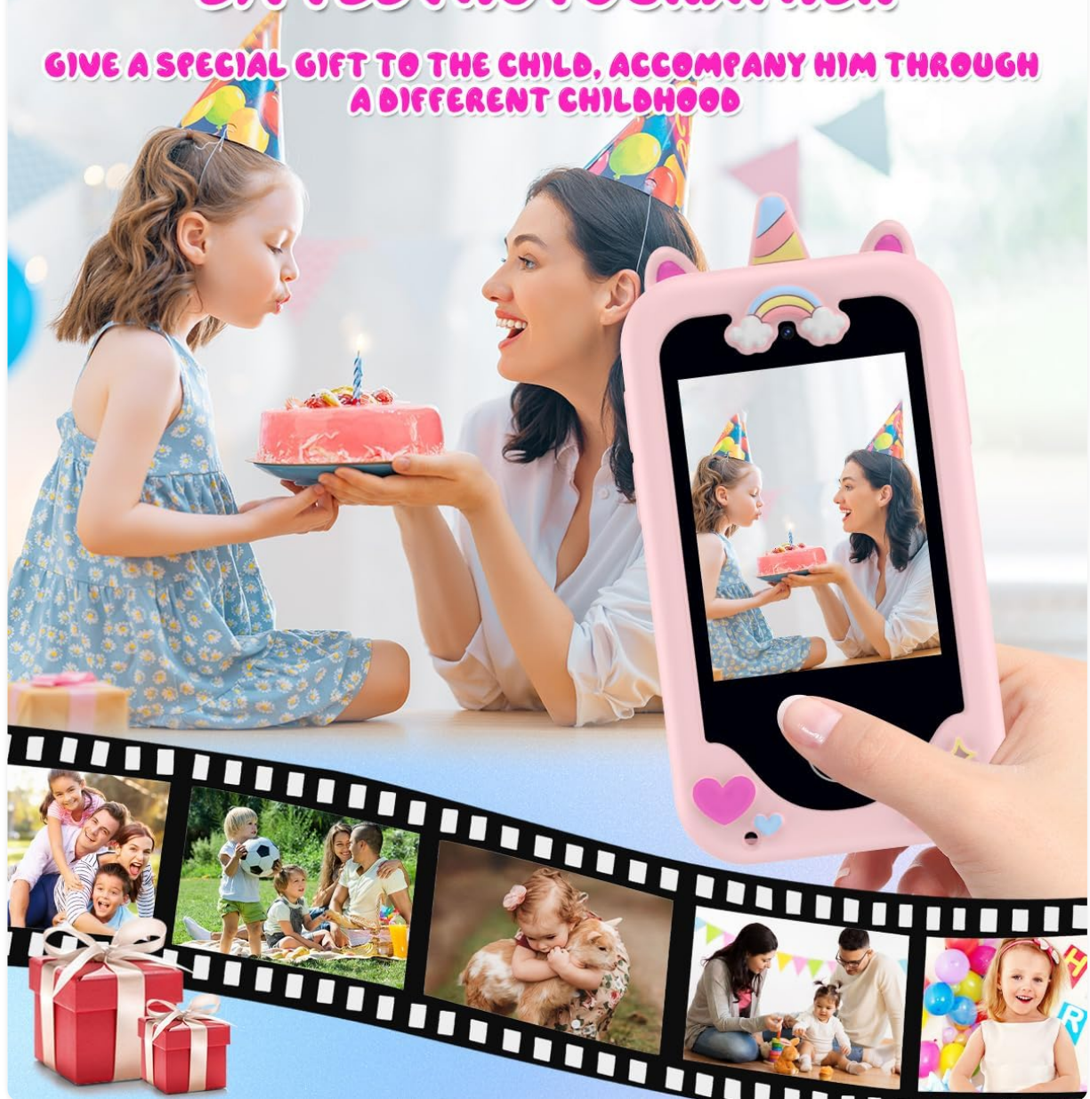
Image: A young girl capturing a moment using the KAKTIN Kids Phone's camera.

GIVE A SPECIAL GIFT TO THE CHILD, ACCOMPANY HIM THROUGH A DIFFERENT CHILDHOOD