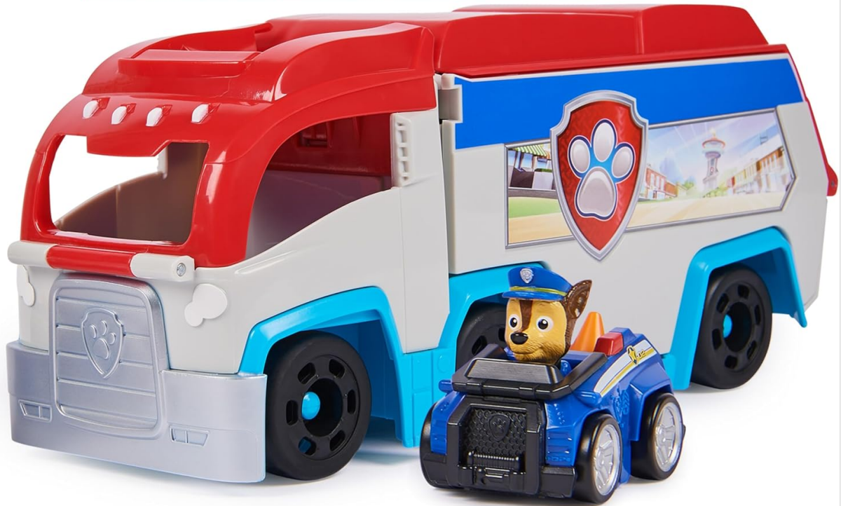
Image: The Paw Patrol Pup Squad Patroller Team Vehicle and included Chase Pup Squad Racer, shown in its original packaging.