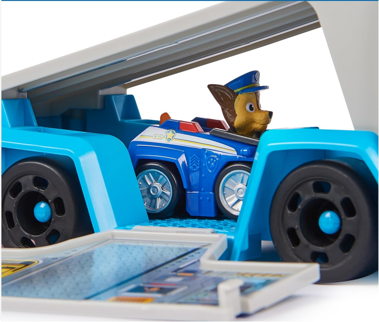
Image: The internal storage bay of the Patroller, showing space for a Pup Squad Racer.