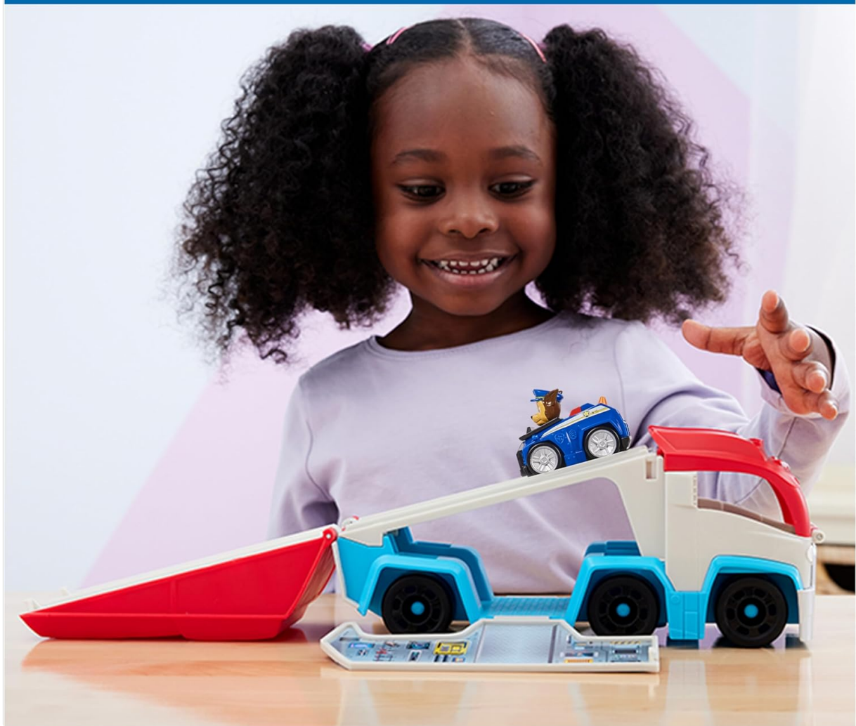
Image: A child demonstrating the launch ramp feature, with the Chase Pup Squad Racer descending.