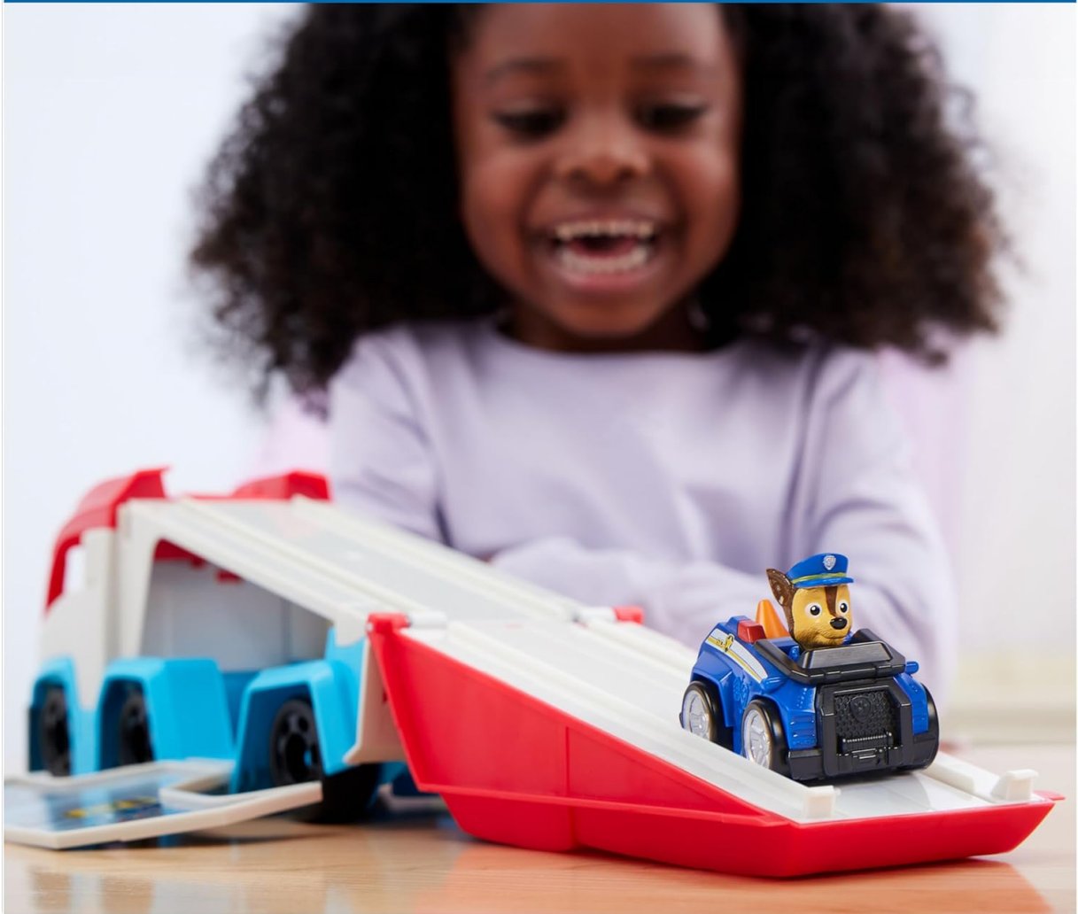
Image: A close-up of the Chase Pup Squad Racer being launched down the Patroller's ramp.