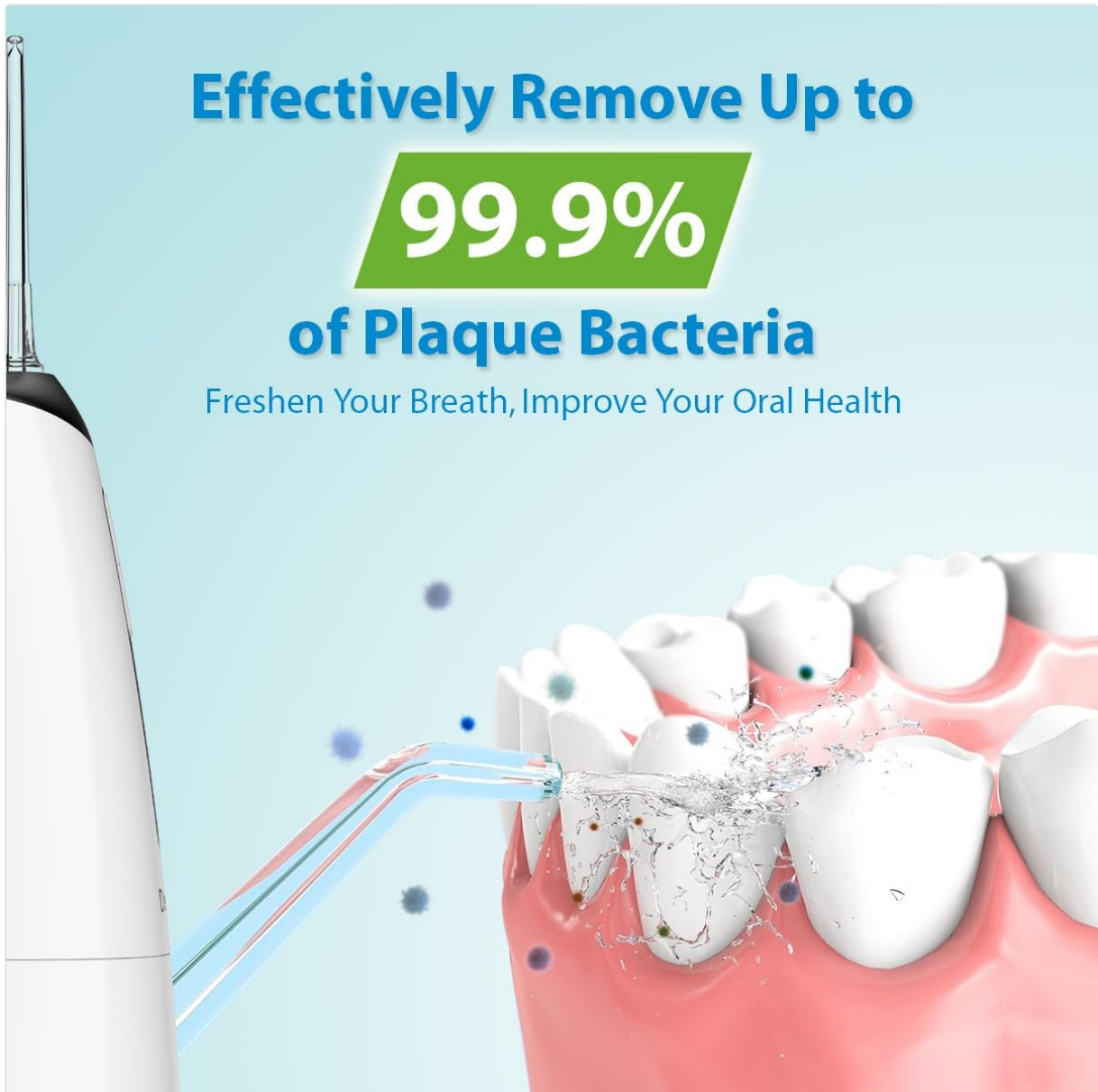
Image: Front view of the DentJet FC5240 Oral Irrigator.

The DentJet FC5240 features a compact, cordless design with a 300ml water reservoir and multiple pressure modes for personalized cleaning.