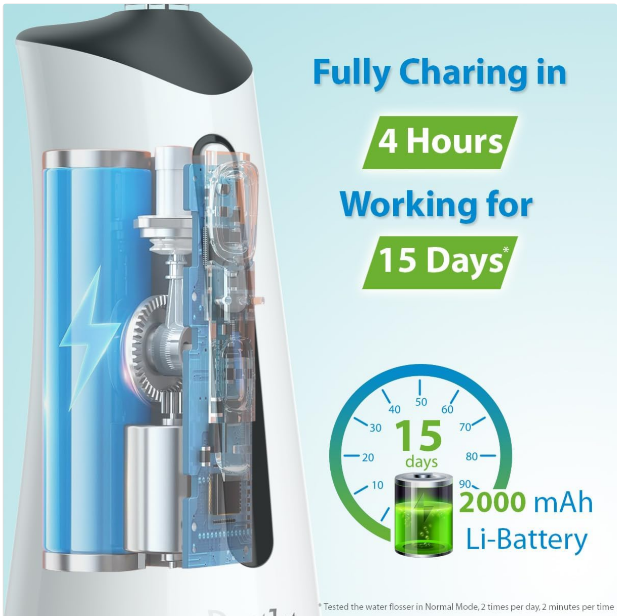
Image: Charging time and battery life details.