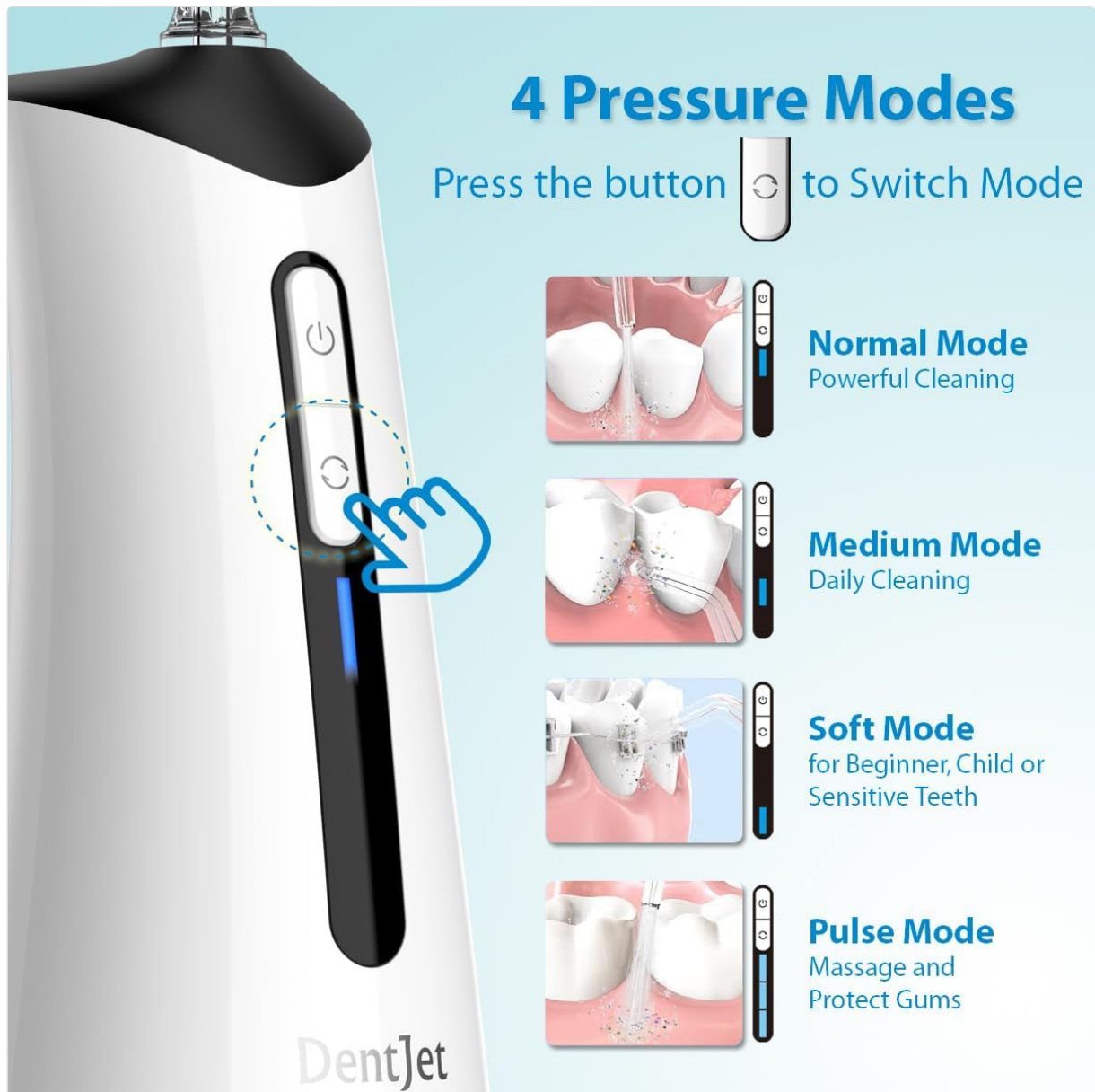
Image: Four distinct pressure modes for varied cleaning needs.