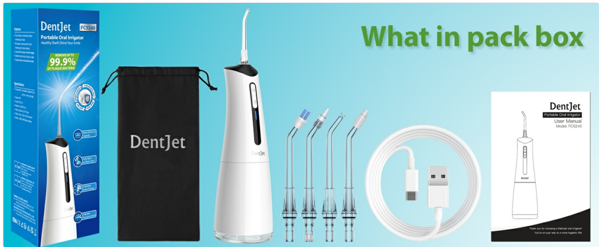
Image: Contents of the DentJet FC5240 package.