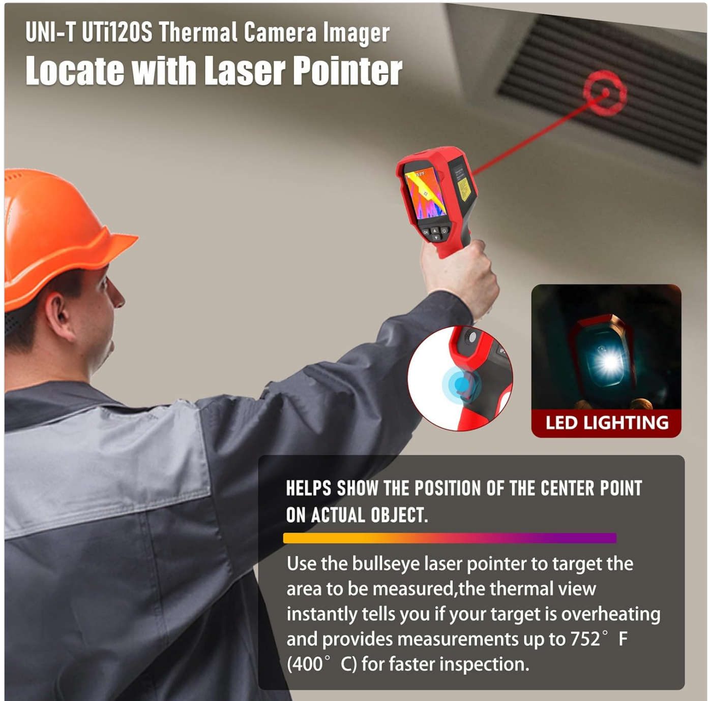
Figure 5.4: Shows the UNI-T UTi120S in use, demonstrating how the laser pointer helps target specific areas for thermal measurement and the LED light illuminates the inspection zone.