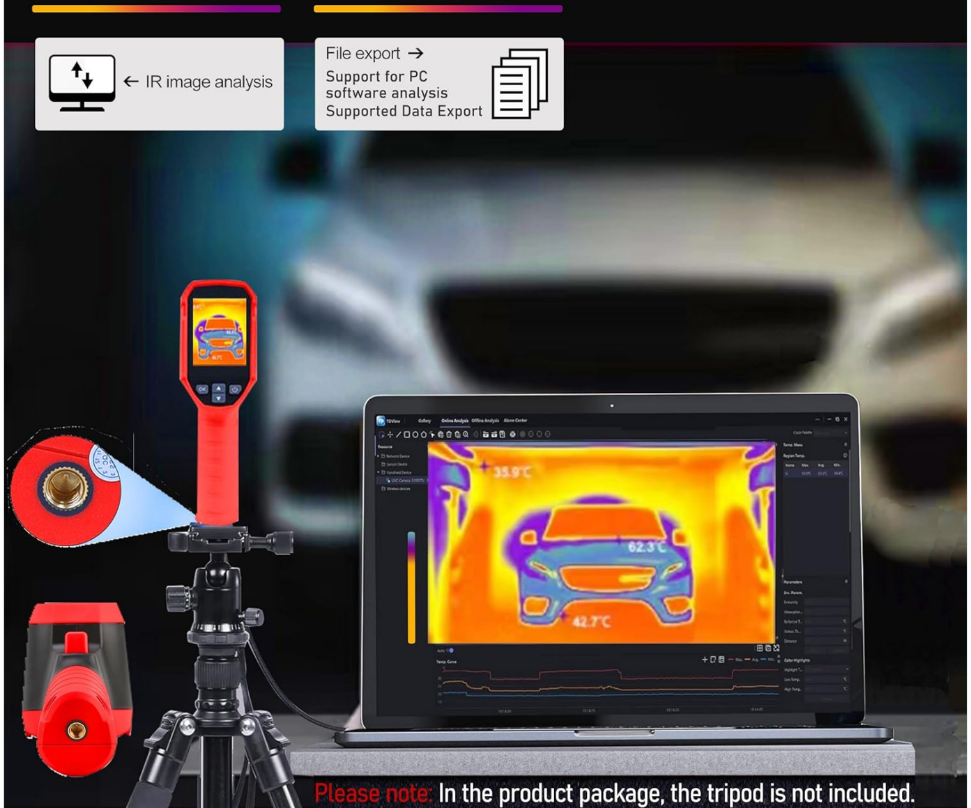
Figure 6.1: Illustrates the UNI-T UTi120S connected to a laptop for PC analysis, showing real-time temperature measurement and data export capabilities. It also highlights the 1/4" screw hole for tripod mounting (tripod not included).

Real-time temperature measurement / Mounts on a Tripod for a Stable View