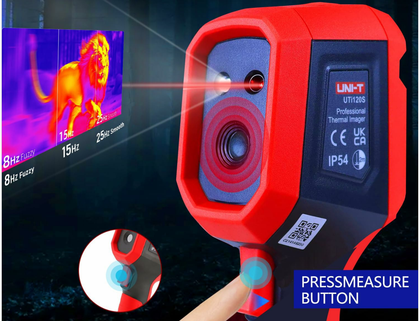
Figure 5.6: Highlights the 25Hz fast image frequency of the UTi120S, demonstrating the smooth and clear thermal imaging experience compared to lower refresh rates, which aids in accurately locating targets.

Crisp and smooth 25Hz refresh rate, experience unprecedented smoothness, allowing you to accurately and easily see and locate your target.