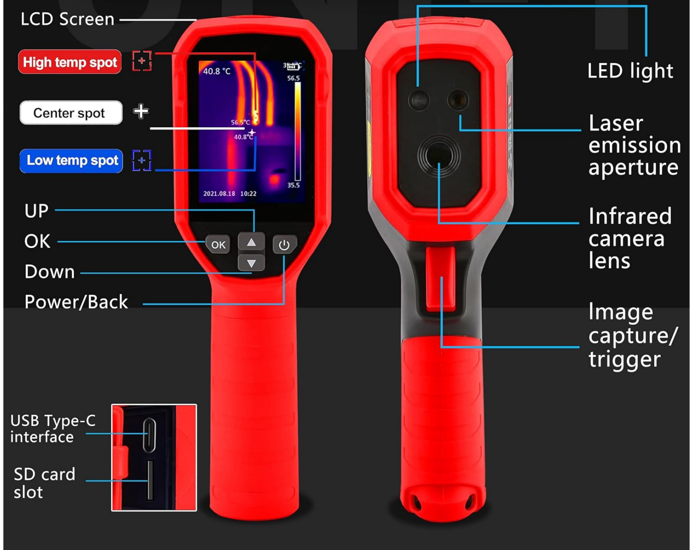
Figure 3.1: Front and Rear View of the UTI120S Instrument Panel, highlighting the LCD screen, control buttons, LED light, laser emission aperture, infrared camera lens, image capture trigger, USB Type-C interface, and SD card slot.