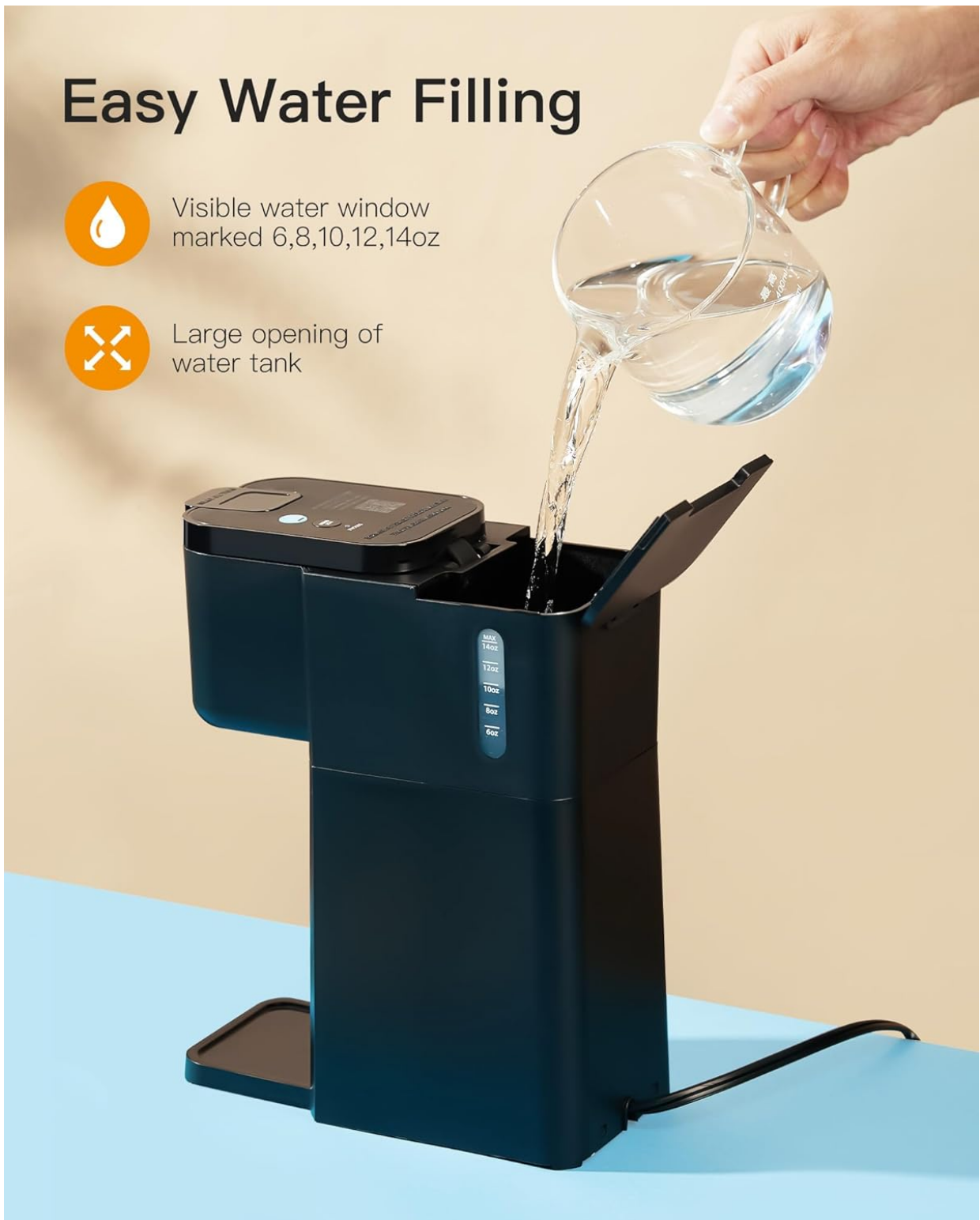
Image 4.1: The water reservoir features clear markings for 6, 8, 10, 12, and 14 oz, and a large opening for easy filling.