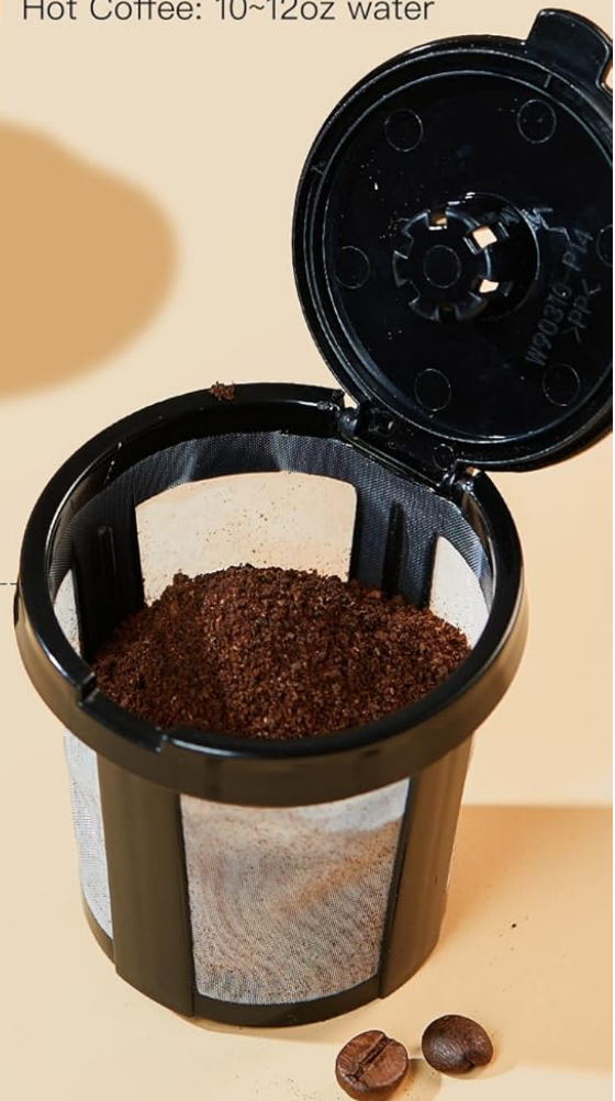
Image 5.2: The coffee maker supports both K-pods and ground coffee, utilizing deep extraction technology for rich flavor.