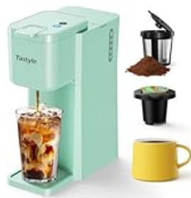
Image 3.1: Overview of the coffee maker's features, including rapid brewing, optimal temperature, water shortage reminder, descaling reminder, and one-button operation.

Familiarize yourself with the components of your Tastyle Mini Coffee Maker.