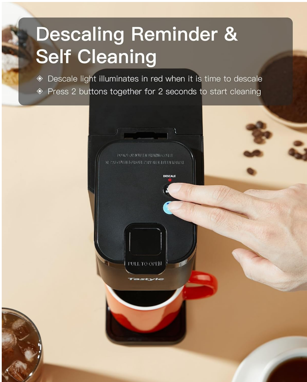
Image 6.1: The descaling indicator light and the two buttons used to initiate the self-cleaning cycle.