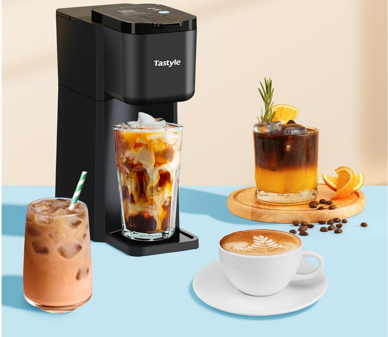
Image 1.1: The Tastyle Mini Single Serve Coffee Maker, showcasing its ability to prepare both hot and iced coffee beverages.