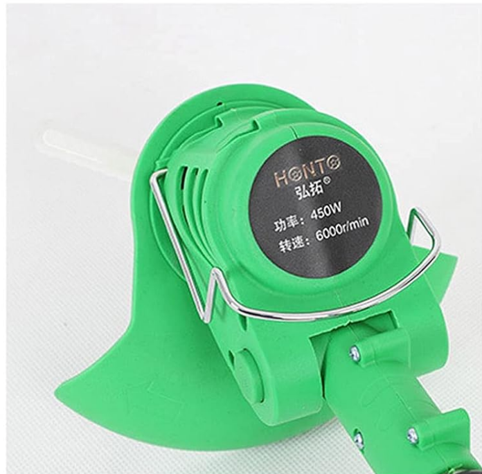
Figure 3: Protective Baffle Installation

Low noise head, high power low noise head, waterproof and easy to clean.