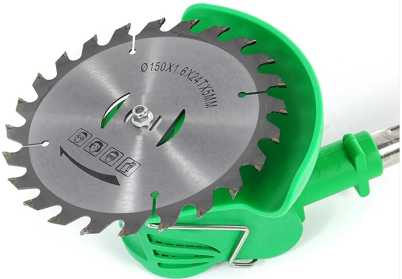
Figure 1: General Safety Warnings

Sharp blade, protective baffle, effectively prevent grass spatter when mowing.