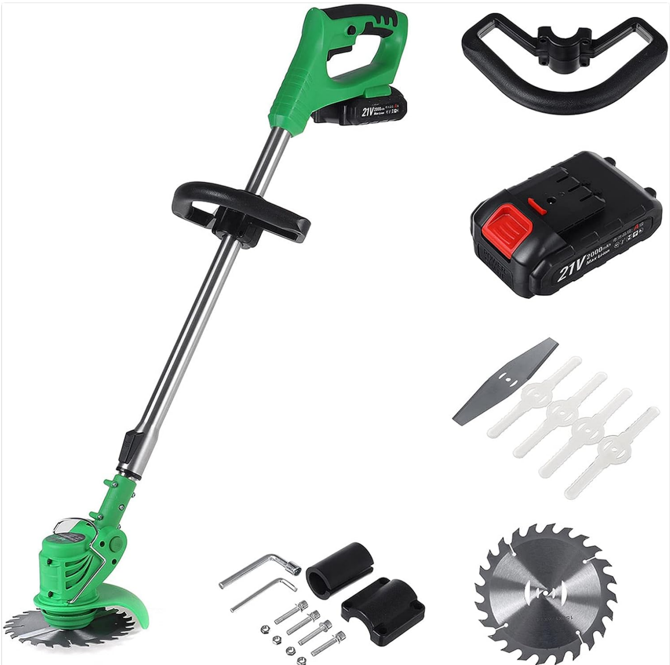
Figure 2: All Included Components