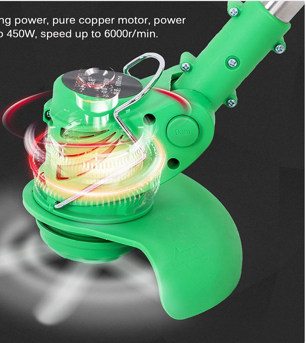
Figure 7: Trimmer in Use

Strong power, pure copper motor, power up to 450W, speed up to 6000r/min.