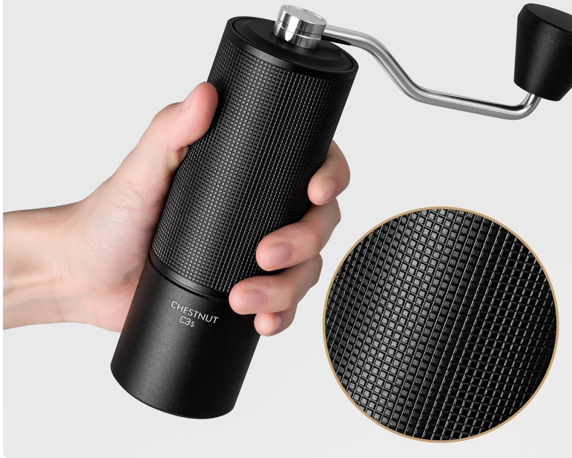
Figure 4: The textured anti-slip design on the grinder body for secure handling.