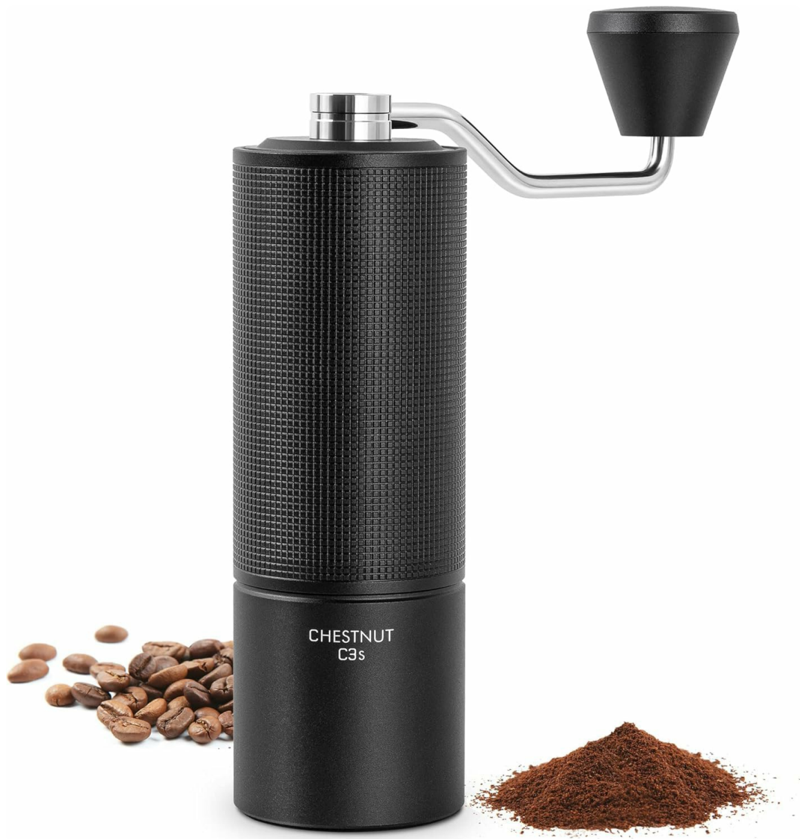
Figure 1: The TIMEMORE Chestnut C3S Manual Coffee Grinder in Black.