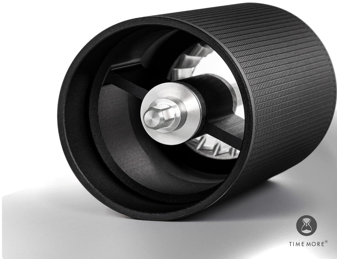
Figure 3: The durable all-metal aluminum alloy body of the grinder.

ALUMINUM ALLOY BODY BUILT FOR PRECISE GRINDING AND LONGER LASTING