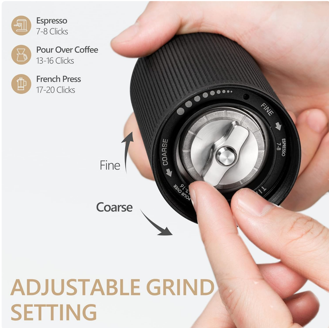
Figure 5: The adjustable grind setting dial at the bottom of the grinder, showing fine and coarse indicators.