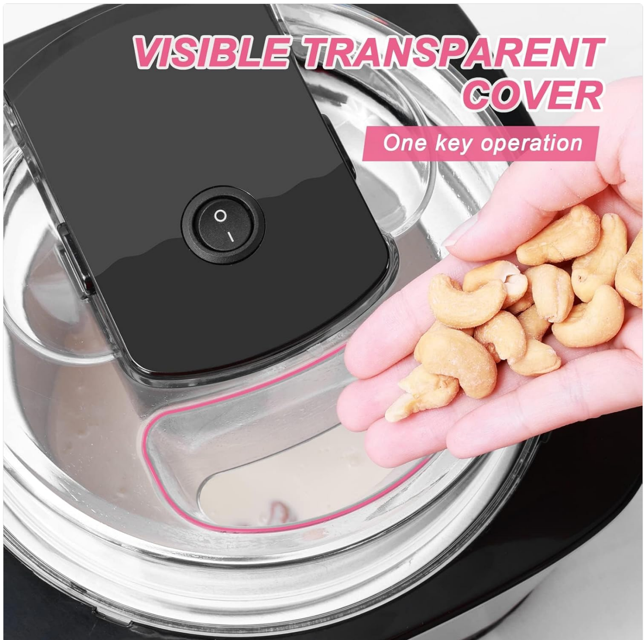
Image: Close-up view of the transparent lid with an opening, highlighting the 'one key operation' button and the ability to add ingredients like cashews during churning.