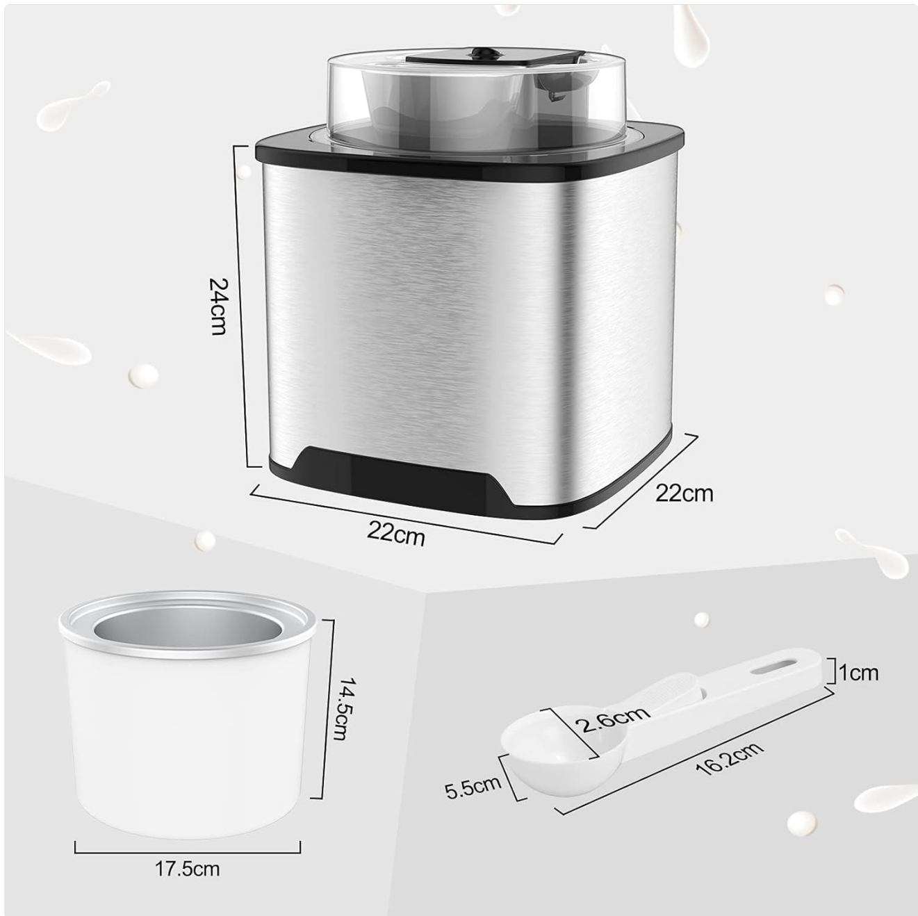
Image: A visual representation of the ice cream machine's dimensions (22cm x 22cm x 24cm) and the inner bowl (17.5cm diameter, 14.5cm height), along with the scoop dimensions.