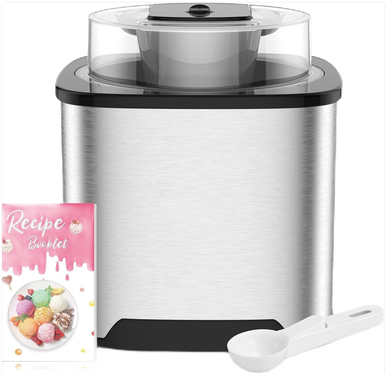
Image: The Vpock Direct Ice Cream Machine, featuring its sleek stainless steel exterior, accompanied by a recipe booklet and an ice cream scoop.