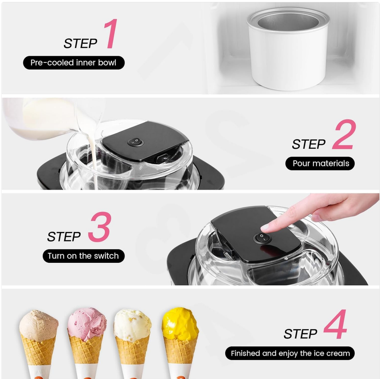
Image: A visual guide showing the four main steps: 1. Pre-cooled inner bowl, 2. Pouring ingredients, 3. Turning on the switch, and 4. Finished ice cream ready to enjoy.