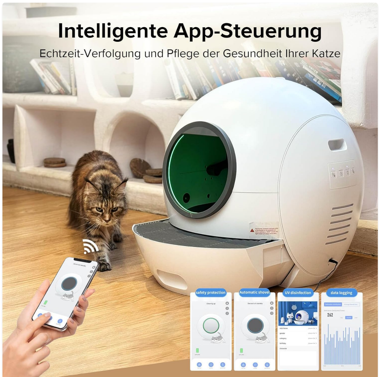
Figure 4.1: The mobile application provides comprehensive control and monitoring, including safety features, automatic cleaning, UV disinfection, and health data logging.