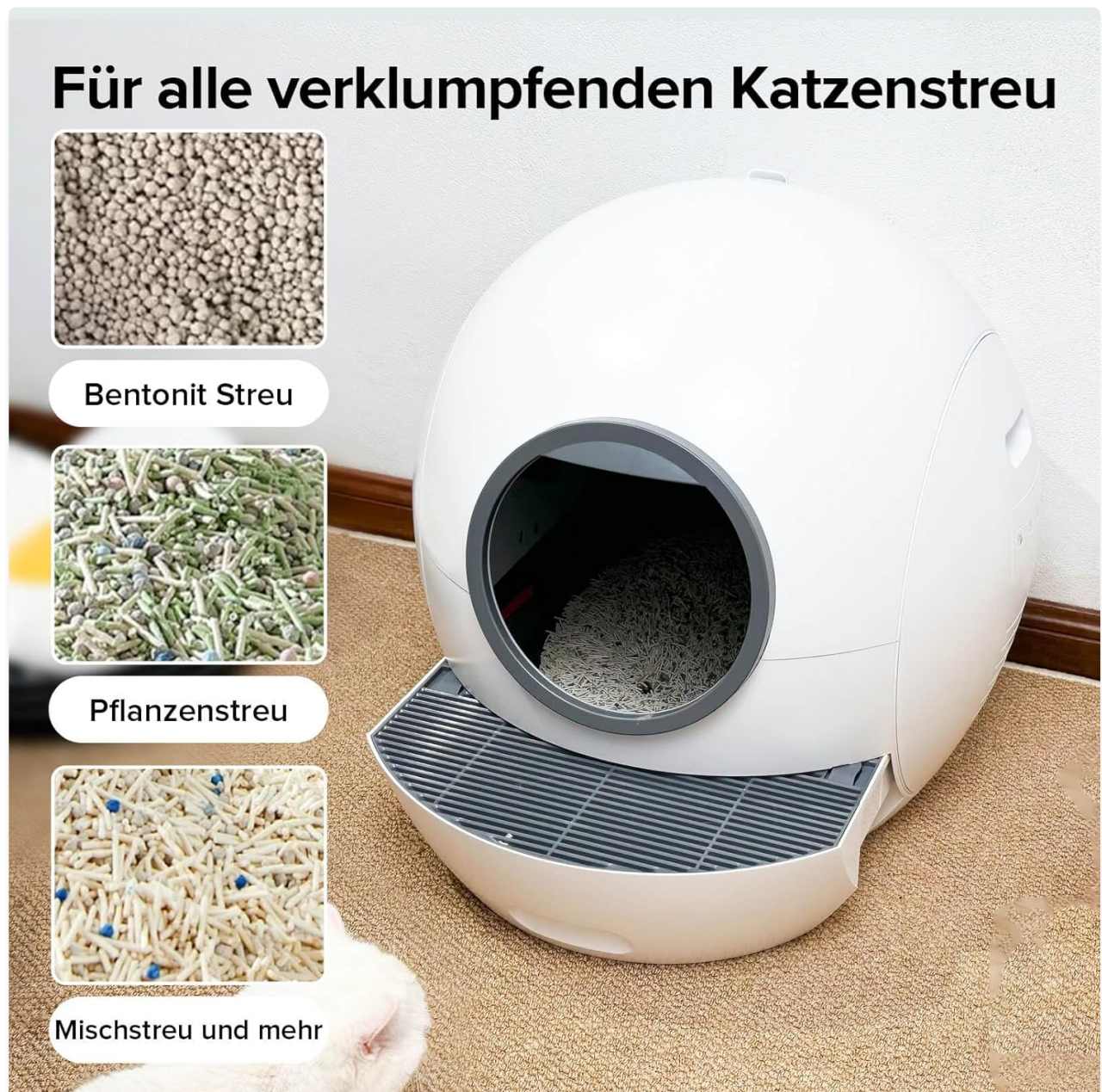
Figure 3.1: The Amicura litter box is designed to work effectively with various types of clumping cat litter, including bentonite, plant-based, and mixed varieties.