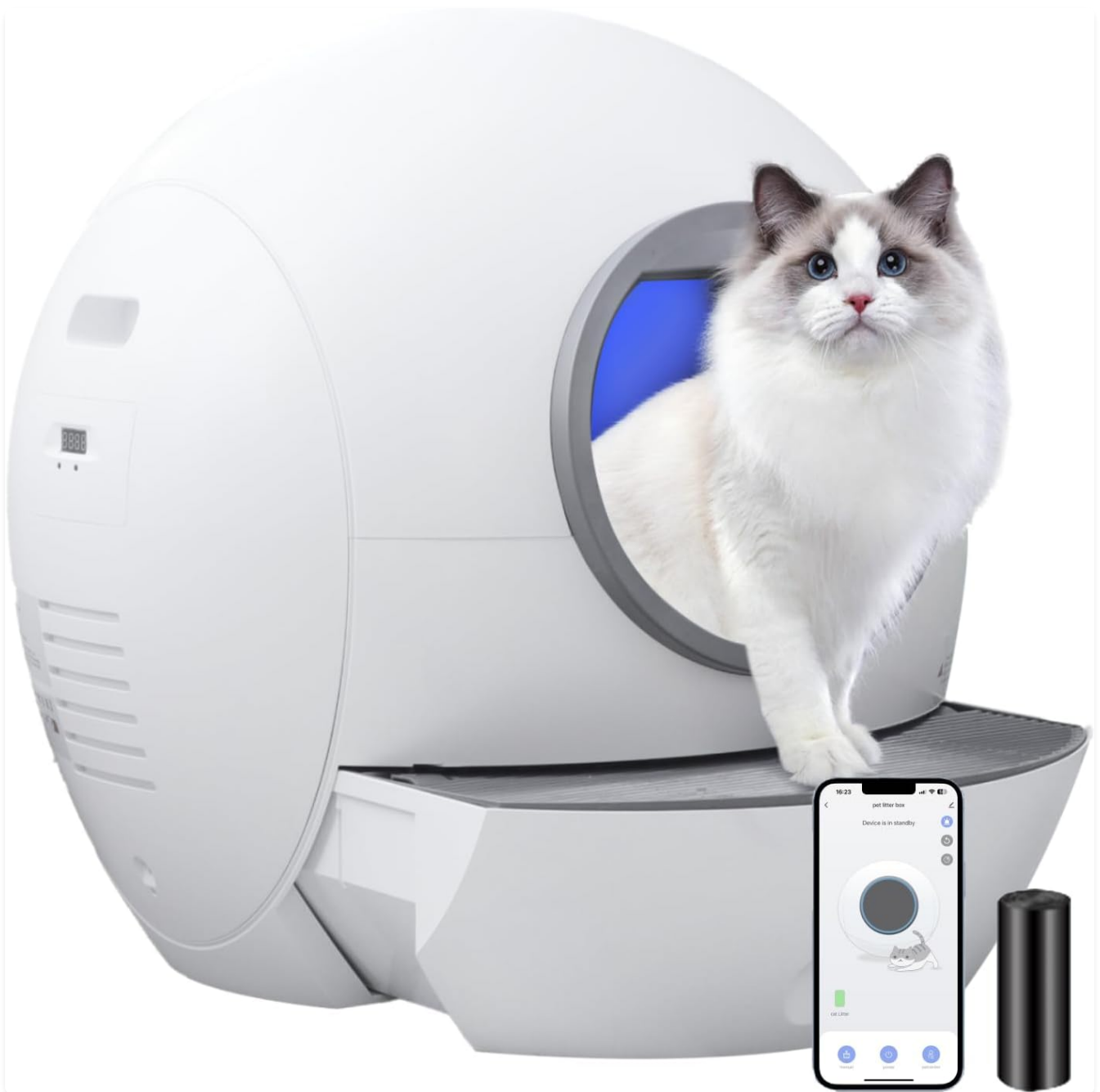
Figure 2.1: The Amicura Self-Cleaning Cat Litter Box, showcasing its sleek design, a cat comfortably using it, and the accompanying mobile application for smart control.