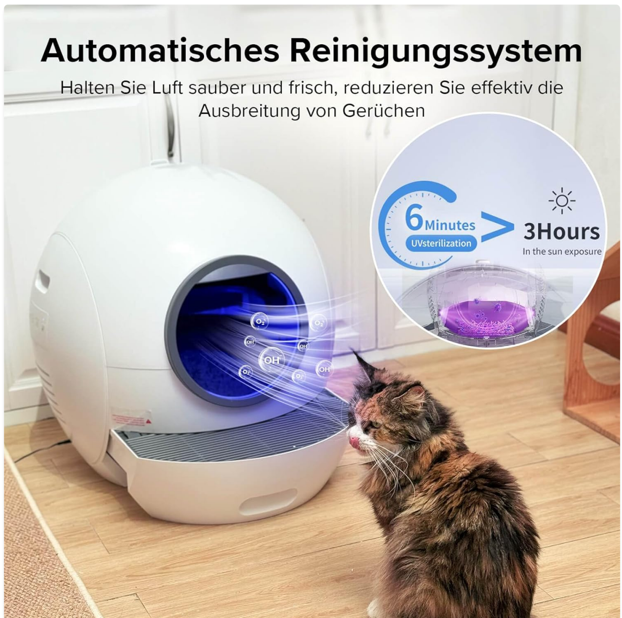
Figure 4.2: The automatic cleaning system includes a UV sterilization process that activates after waste removal, contributing to a fresh and hygienic environment.