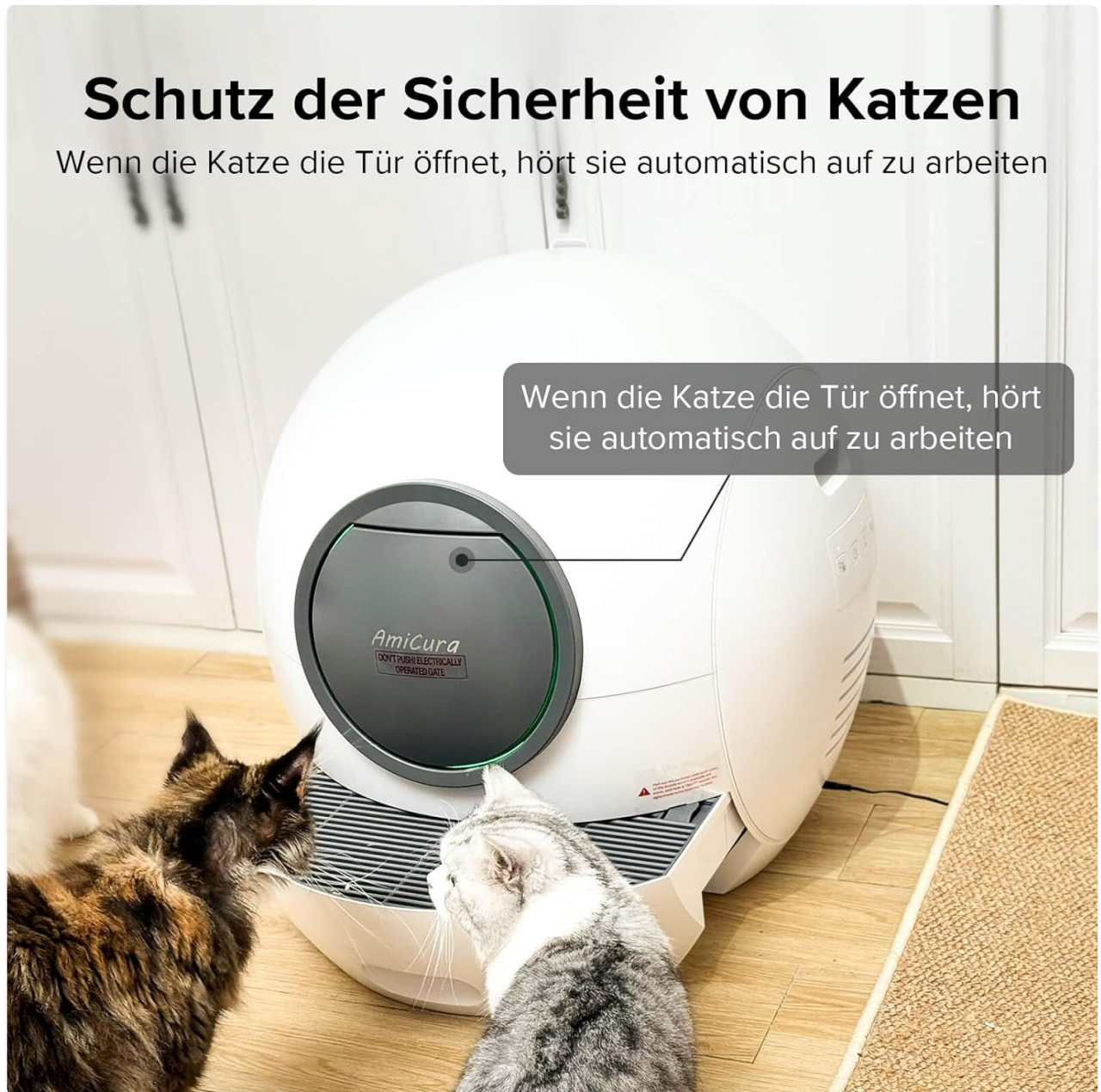
Figure 4.3: The litter box features advanced safety mechanisms, including sensors that automatically pause operation if a cat is detected near or inside the entrance.