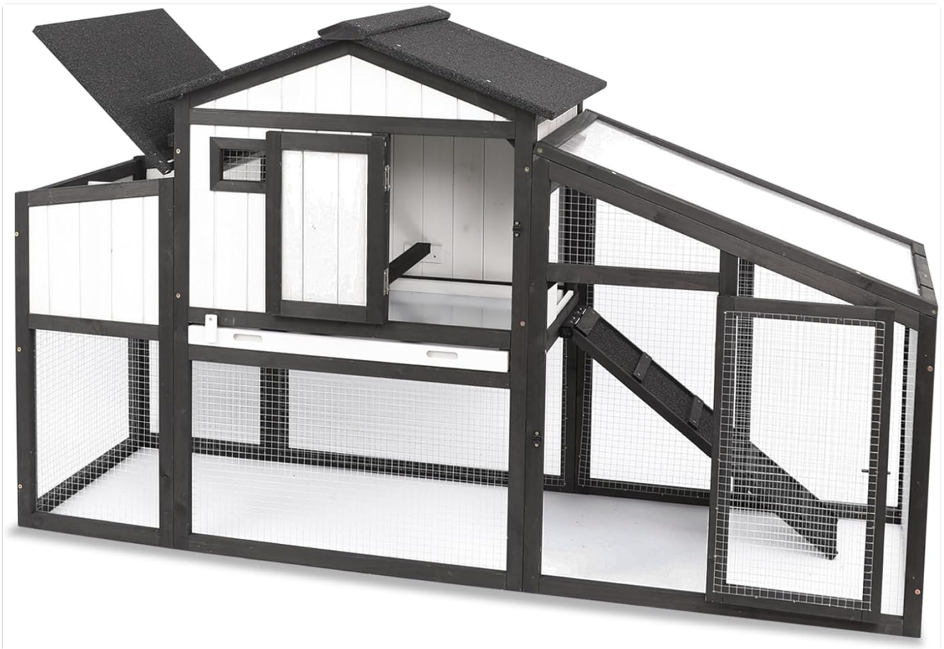
Image: Overview of the PetsCosset Wooden Chicken Coop, showcasing its two-story design and integrated run.