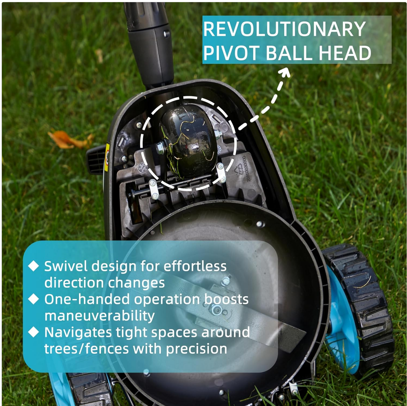
Figure 8: The pivoting front wheel enables superior maneuverability.

The mower's pivoting front wheel and one-hand steering capability allow for effortless control around tight corners and obstacles.