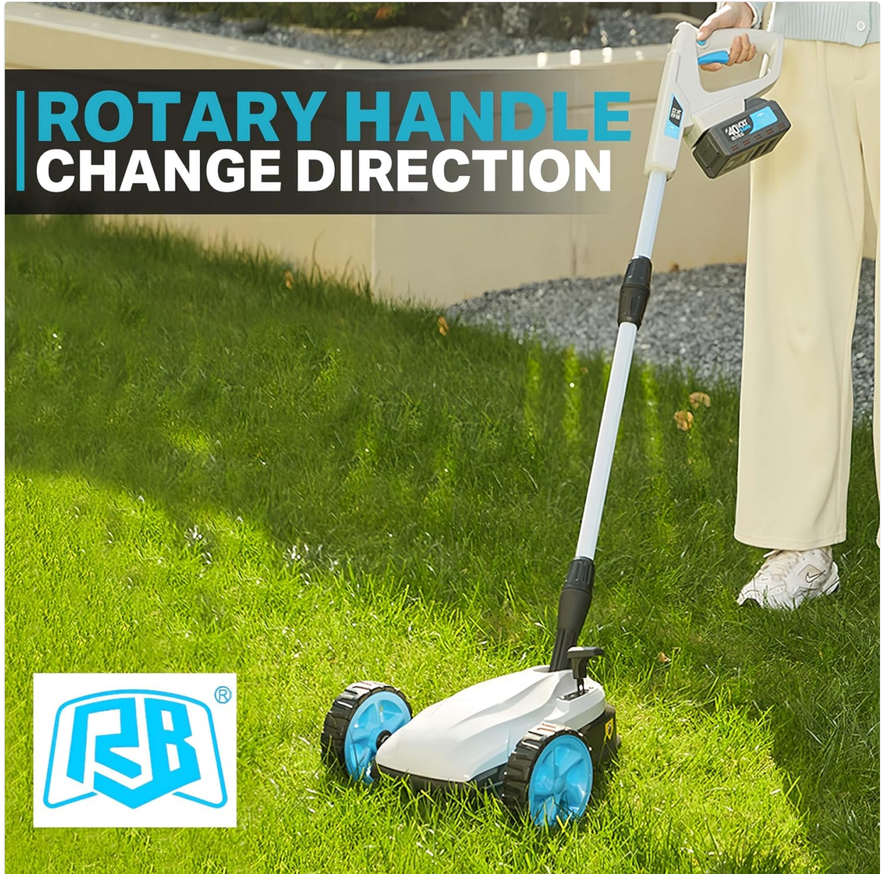
Figure 2: Handle joint assembly and overall labeled parts of the mower.