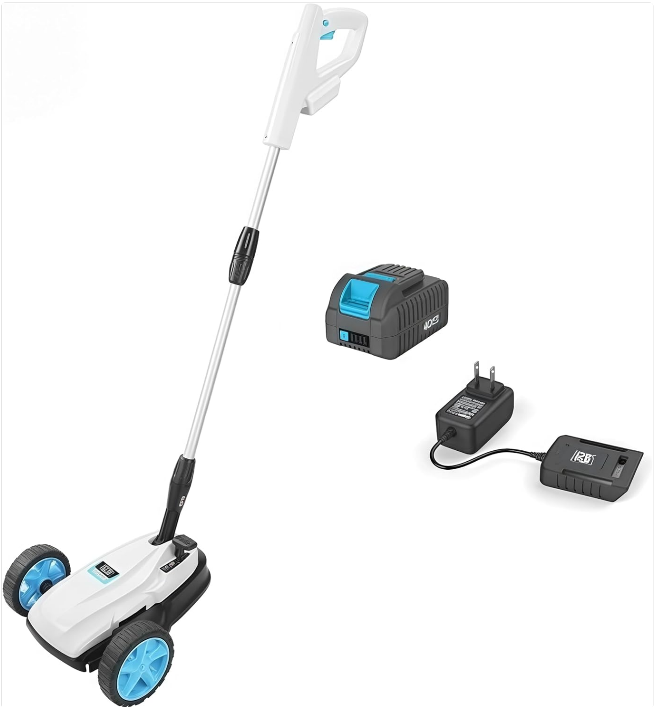
Figure 1: RB 9" Cordless Lawn Mower with 40V 2Ah Battery and Charger.