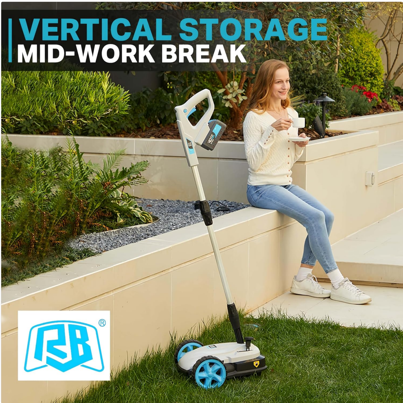
Figure 10: The mower's upright storage capability.