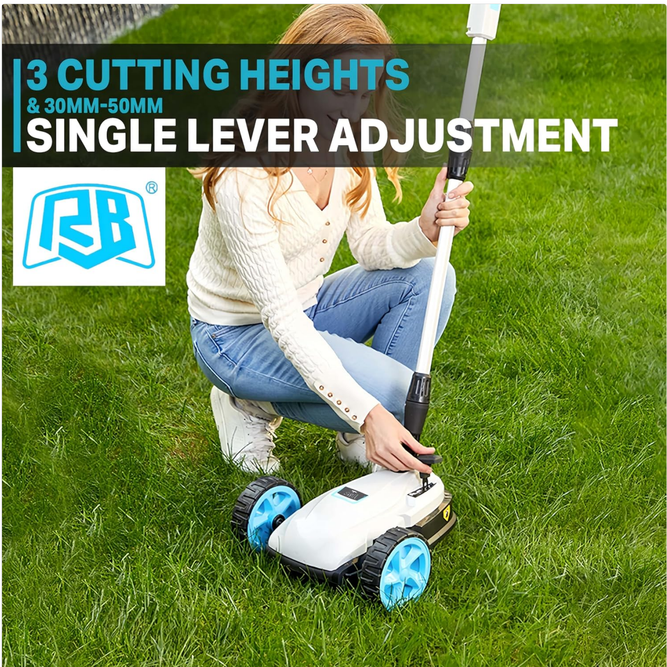
Figure 6: Adjusting the cutting height with the single lever.