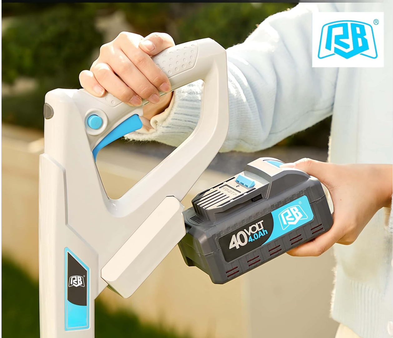
Figure 3: Proper battery insertion into the handle.