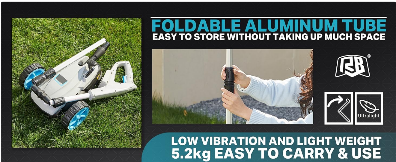
Figure 11: The detachable handle allows for easy and compact storage.