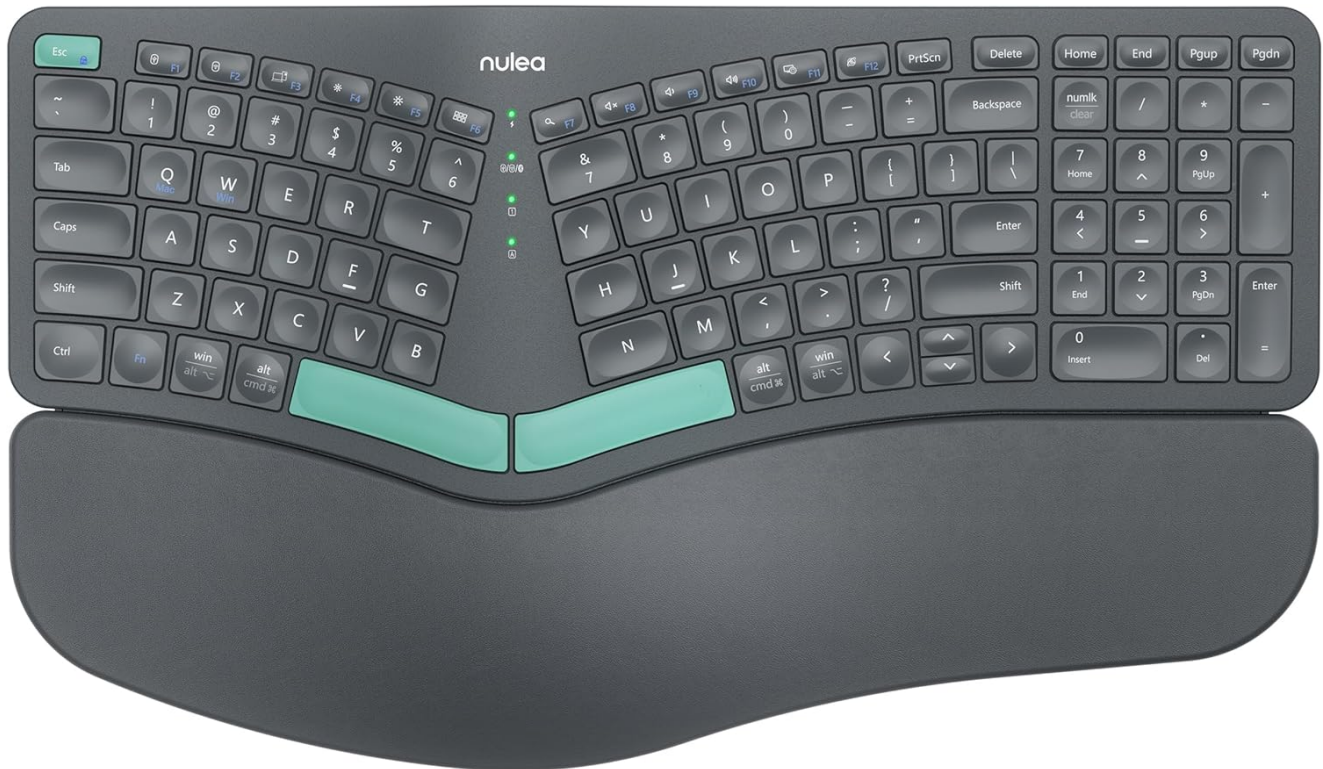
Figure 3.1: Top-down view of the Nulea RT05B keyboard, highlighting its ergonomic split design and integrated wrist rest.