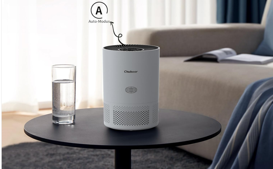
Figure 6: Diagram illustrating the Auto Mode functionality. The air purifier automatically adjusts fan speed (low, medium, high) based on detected air quality (good, moderate, poor).