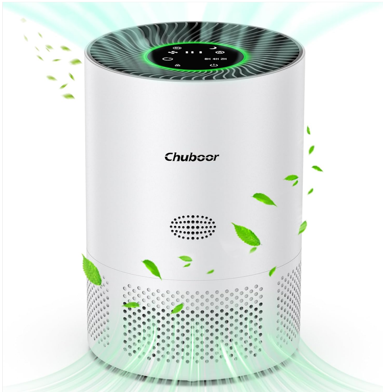
Figure 1: Front view of the Chuboor PJ01 Air Purifier, showing the main unit, air intake vents, and top control panel with air outlet. Green leaves illustrate air purification.

Familiarize yourself with the main parts of your Chuboor PJ01 Air Purifier.