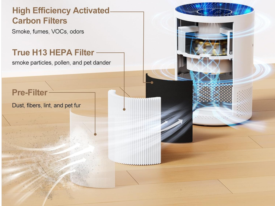
Figure 4: Diagram illustrating the three layers of the Chuboor PJ01 filter: Pre-Filter (for dust, fibers, lint, pet fur), High Efficiency Activated Carbon Filters (for smoke, fumes, VOCs, odors), and True H13 HEPA Filter (for smoke particles, pollen, pet dander, and particles >0.3 microns).