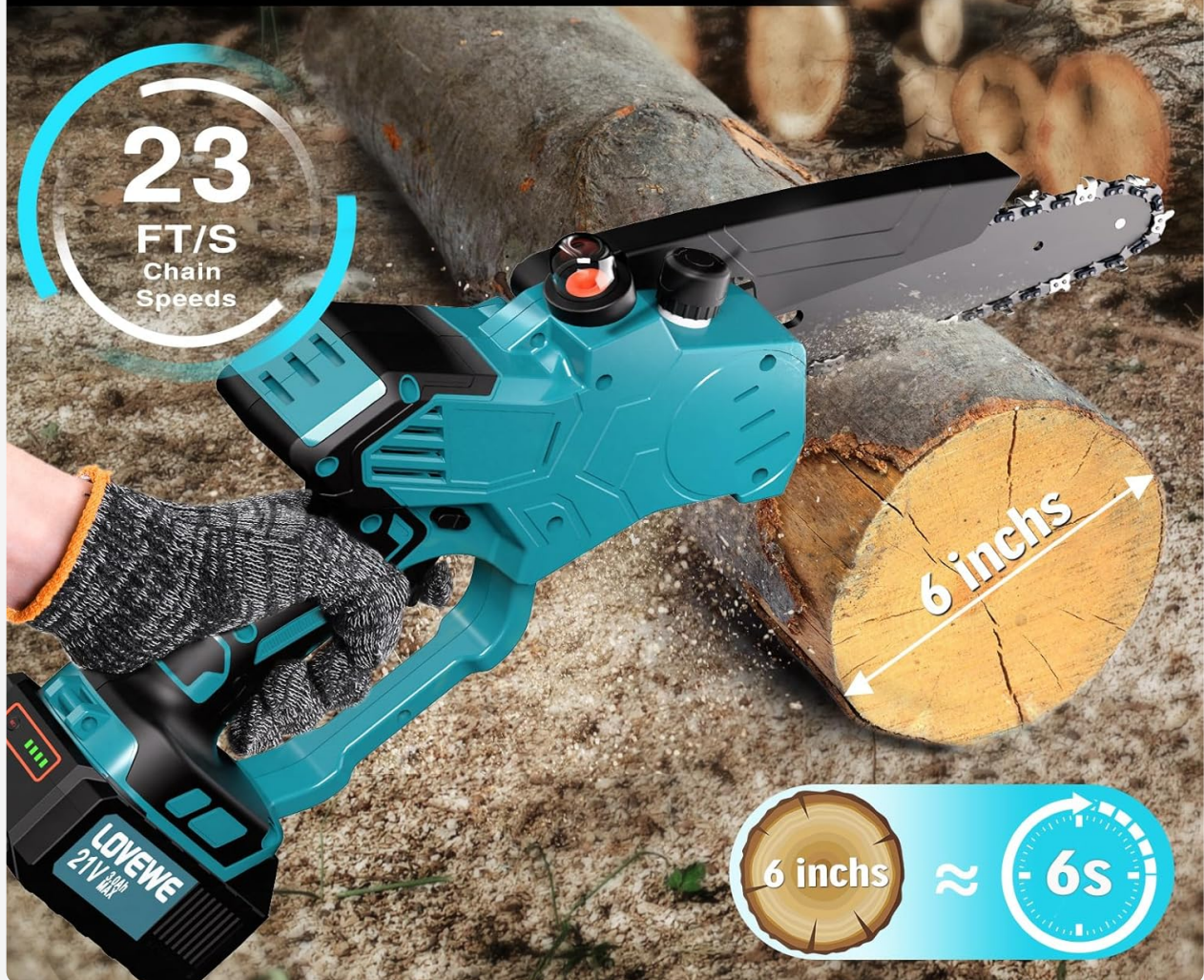
Figure 6: The 650W high-power motor allows the chainsaw to cut 6-inch branches efficiently, as demonstrated on a log.