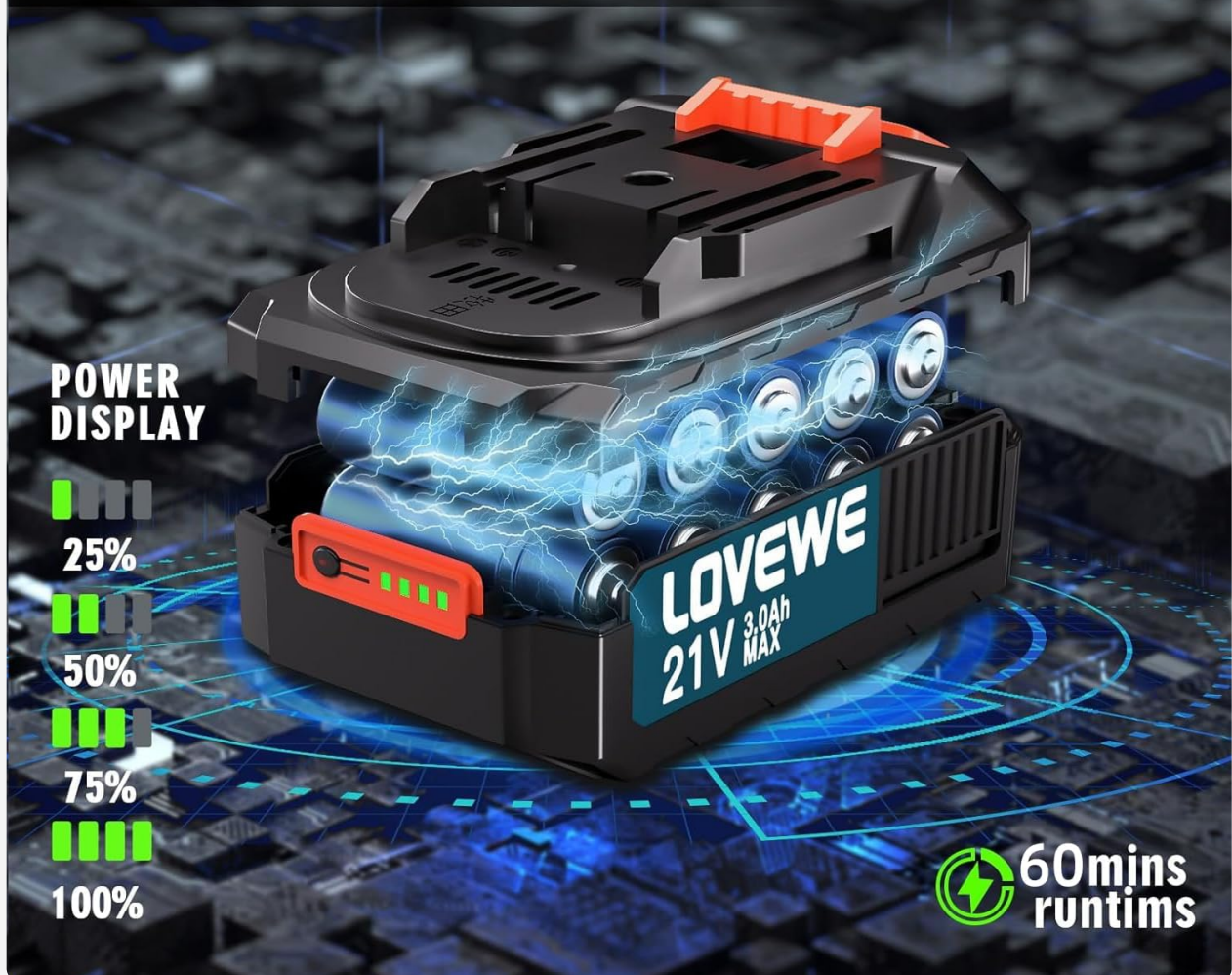
Figure 3: The 21V 3000mAh Lithium Battery features a power display to indicate charge level. A full charge provides approximately 60 minutes of runtime.