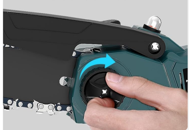
Figure 4: Steps for tool-free chain tensioning: 1) Loosen control nut, 2) Adjust outer gear for slack, 3) Ensure 5mm chain distance, 4) Tighten control nut.