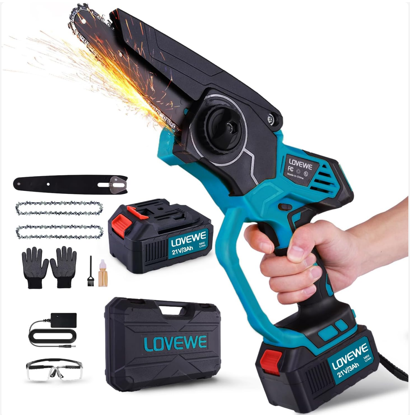
Figure 1: The LOVEWE Mini Chainsaw with all included accessories, including the chainsaw unit, battery, charger, extra chain, gloves, safety goggles, and carrying case.