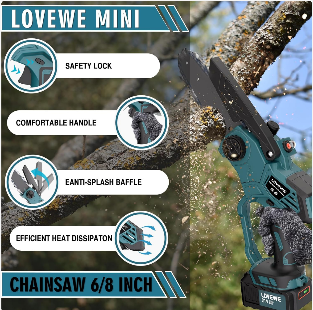
Figure 7: Overview of chainsaw features including tool-free installation, double security control, 3.0Ah battery, lubrication system, cooling system, and ergonomic handle.