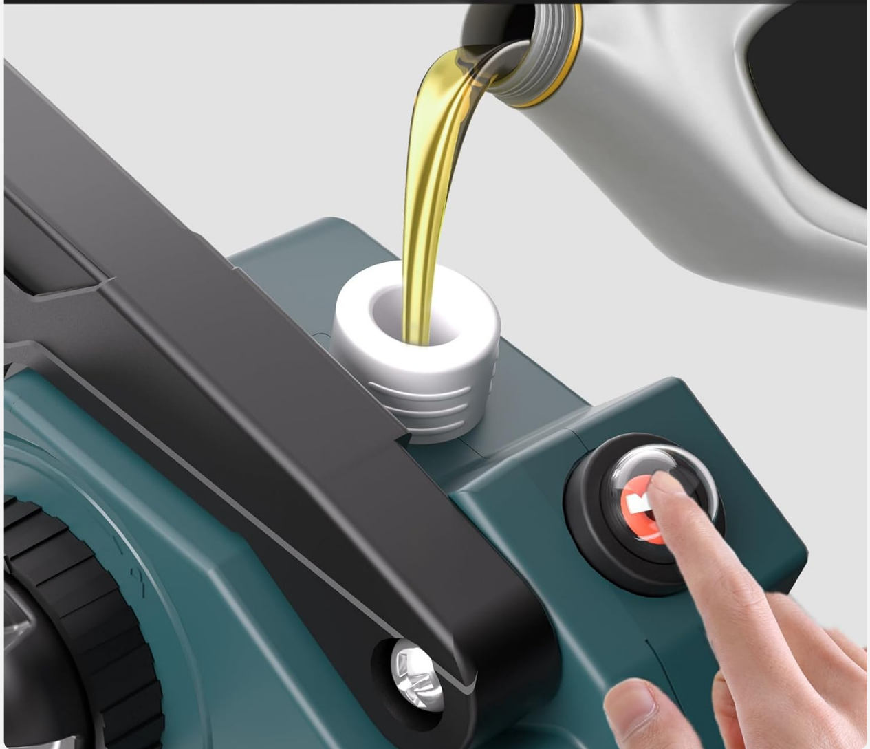
Figure 5: The chainsaw features a lubrication system. Add bar and chain oil into the designated port to ensure smooth operation and chain longevity.